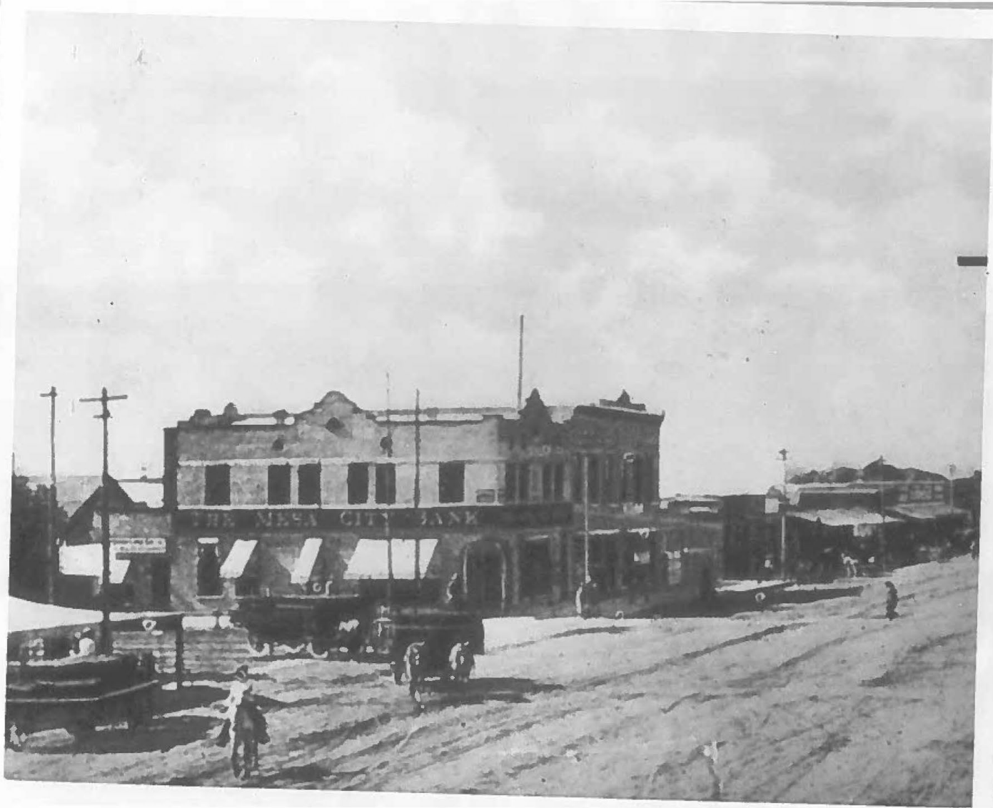
99-114.4 Mesa City Bank 1900 s