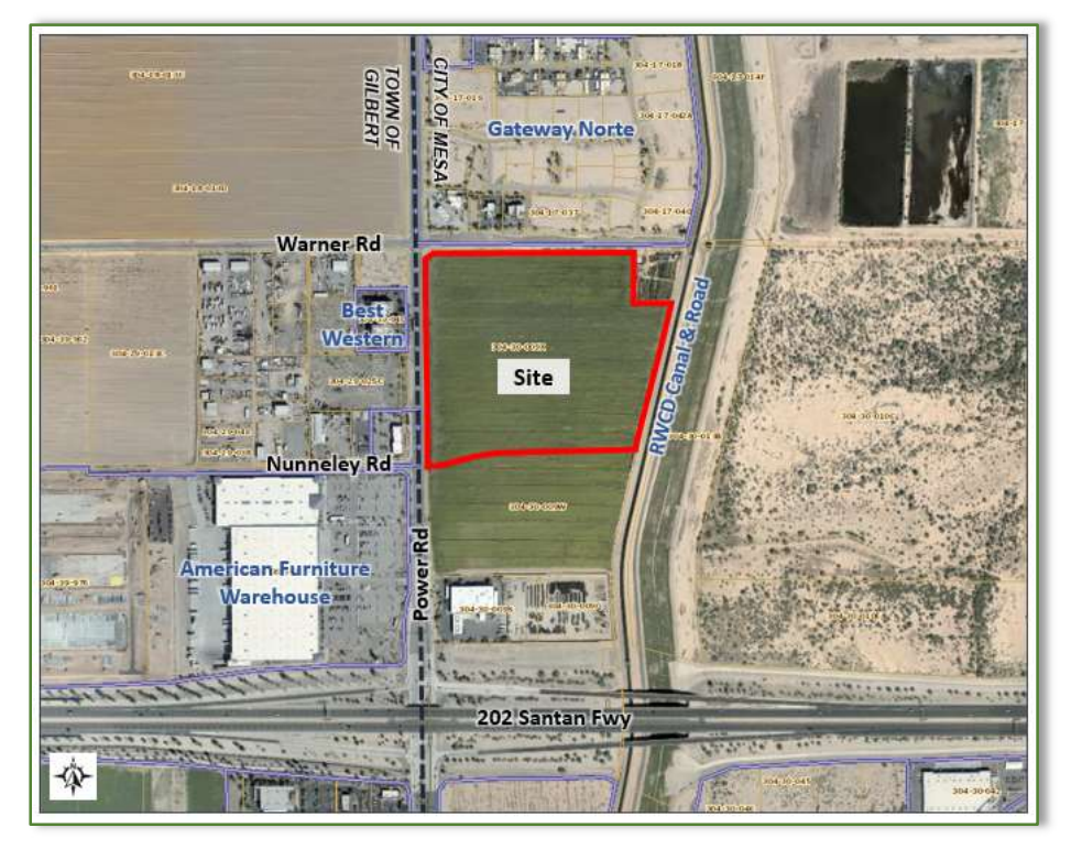
Figure 1 – Site Aerial

Pew & Lake, PLC, on behalf of Action Zone Business, LLC, is pleased to submit this Project Narrative and related exhibits for development requests to allow for Phase 2 of the Cannon Beach Mixed Use development. The purpose is to allow for retail and pad buildings fronting Power Road on approximately 5.4 acres of the the approximately 37-acre overall site located at the southeast corner of Power Road and Warner Road in Mesa. The overall subject property is further identified on the Maricopa County Assessor's Map as a portion of parcel number 304-30-009X (the "Property," see Site Aerial below).