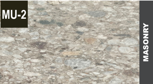
MALIBU SAND TRENDSTONE