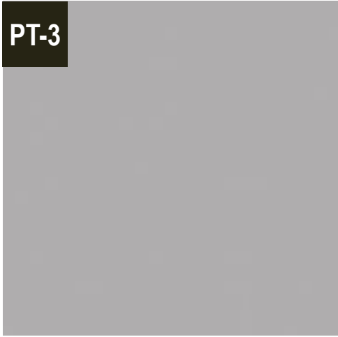
INDUSTRIAL AGE DET618