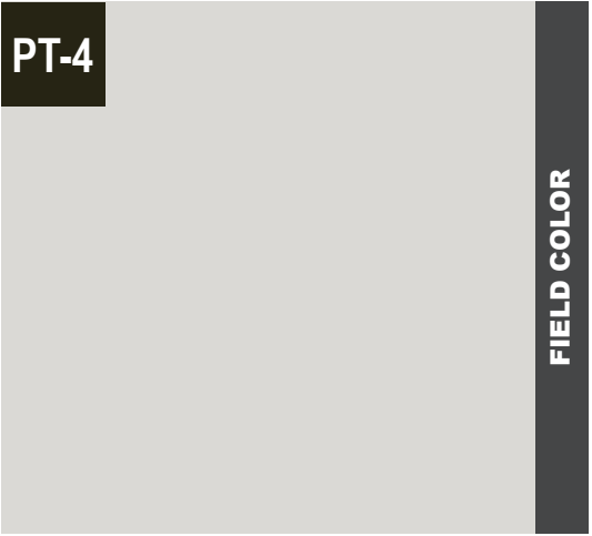
WINTER MORN DE6T217