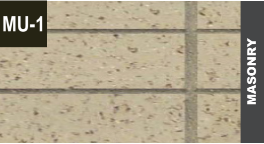
TUMBLEWEED EMPEROR THIN BRICK STACKED BOND