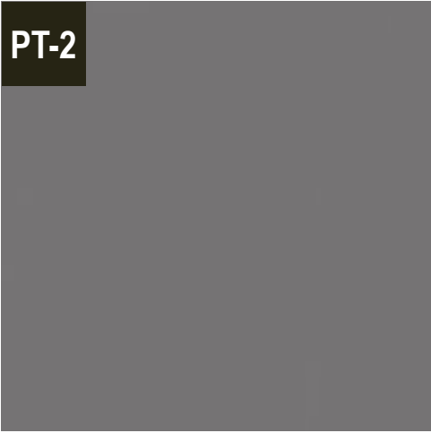
BANK VAULT DE6383