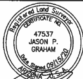
EXHIBIT "A" RIGHT OF WAY ABANDONMENT

A PART OF NORTHEAST QUARTER SECTION 23, T1N, R5E, GILA & SALT RIVER MERIDIAN, MARICOPA COUNTY, ARIZONA