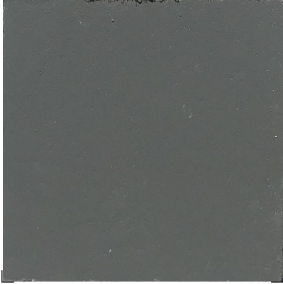
1.4 LS1: LAP SIDING, 10 3/4" EXPOSURE SMOOTH (RAW SAMPLE -UNCOLORED)