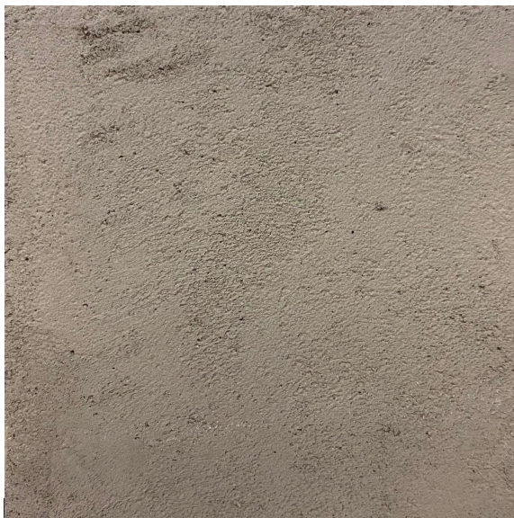
1.2 STC2: STUCCO, SMOOTH TEXTURE WITH REVEALS AS SHOWN ON ELEVATIONS(UNCOLORED)