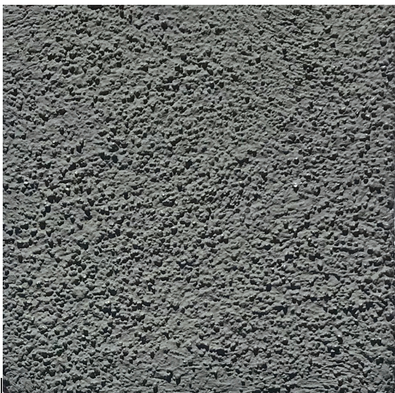
1.1 STC1: STUCCO, SAND FINISH TEXTURE WITH REVEALS AS SHOWN ON ELEVATIONS (UNCOLORED)