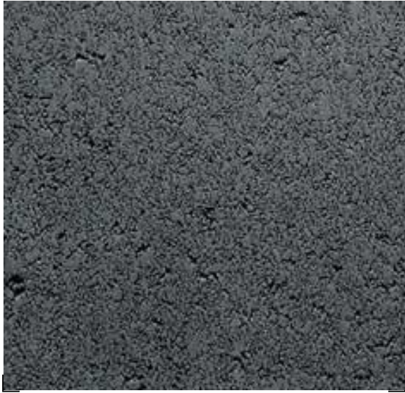
1.6 BLK1: CMU, 8X12X16 BLOCK, DARK GREY COLOR W/ RAKED GROUT JOINTS (DARK GREY)