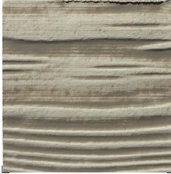
1.5 LS2: LAP SIDING, 4" EXPOSURE PATTERNED (RAW SAMPLE-UNCOLORED)