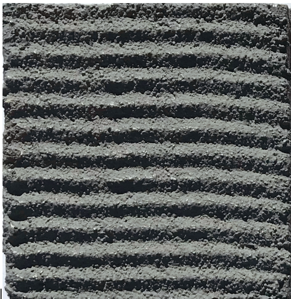
1.3 STC3: STUCCO, HORIZONTAL RAKED TEXTURE WITH REVEALS AS SHOWN ON ELEVATIONS (UNCOLORED)