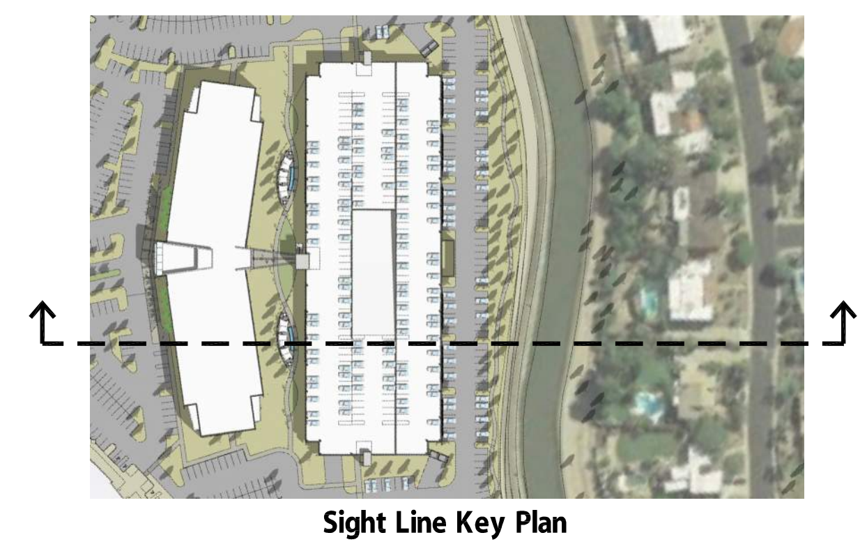
Sight Line Key Plan