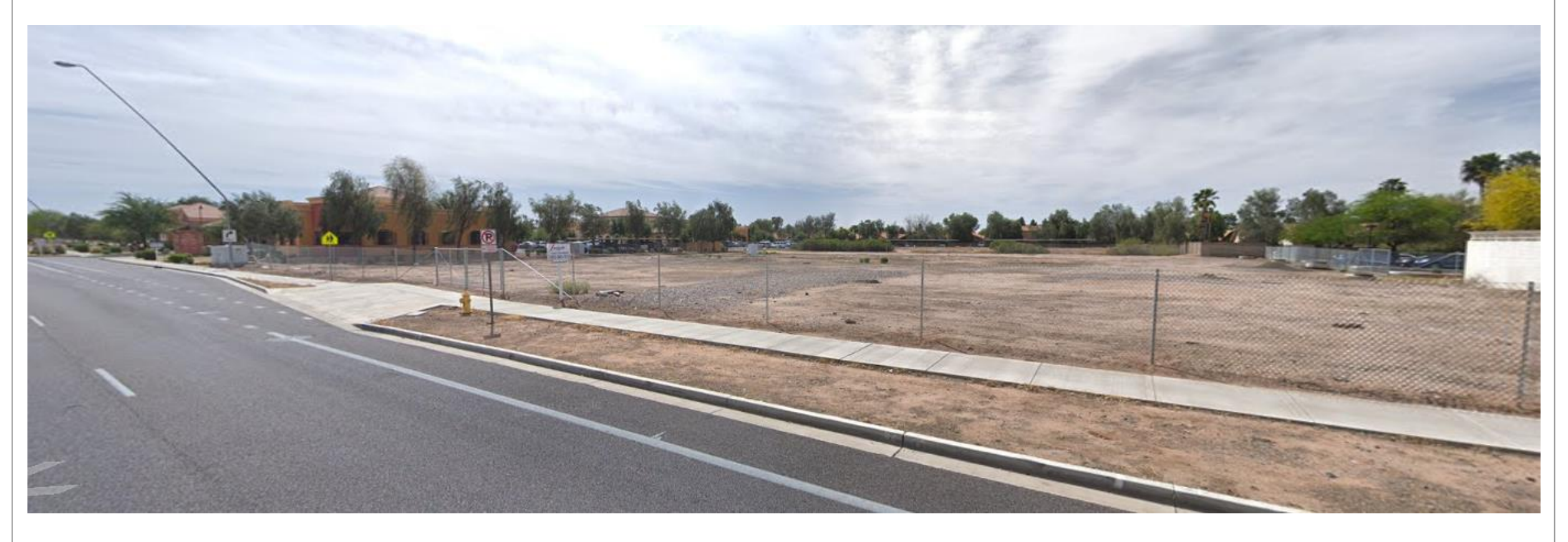
Looking southeast from Southern Avenue into the site