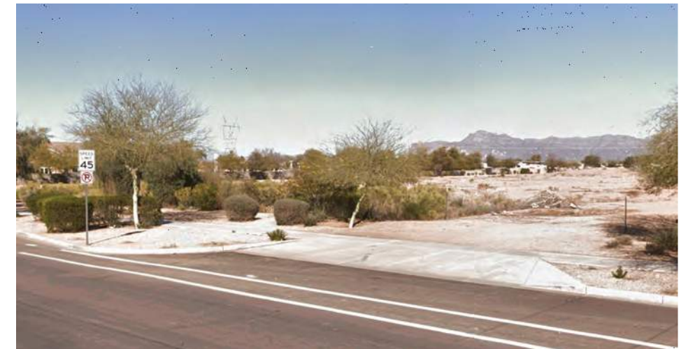
VIEW 1 - EXISTING STREET VIEW