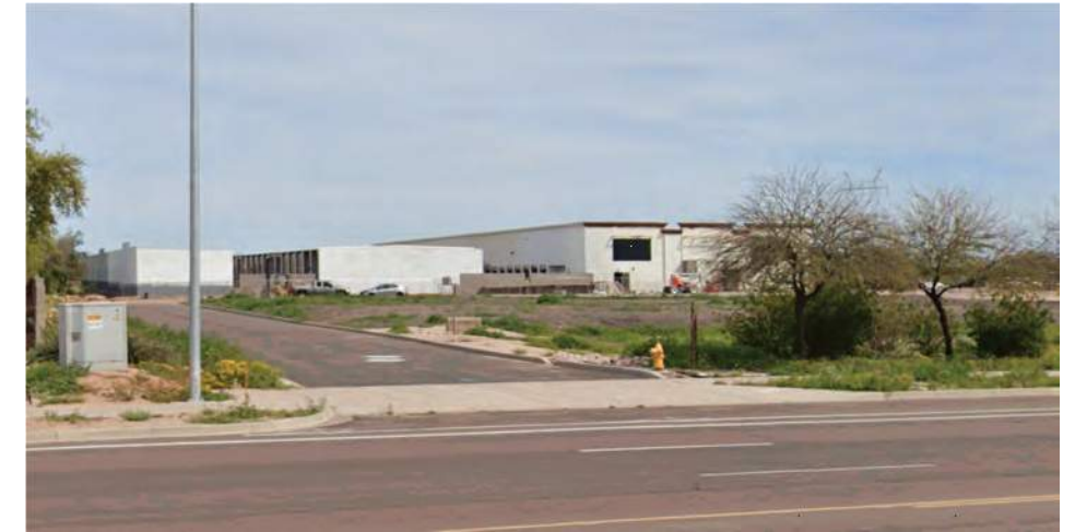
VIEW 3 - EXISTING STREET VIEW