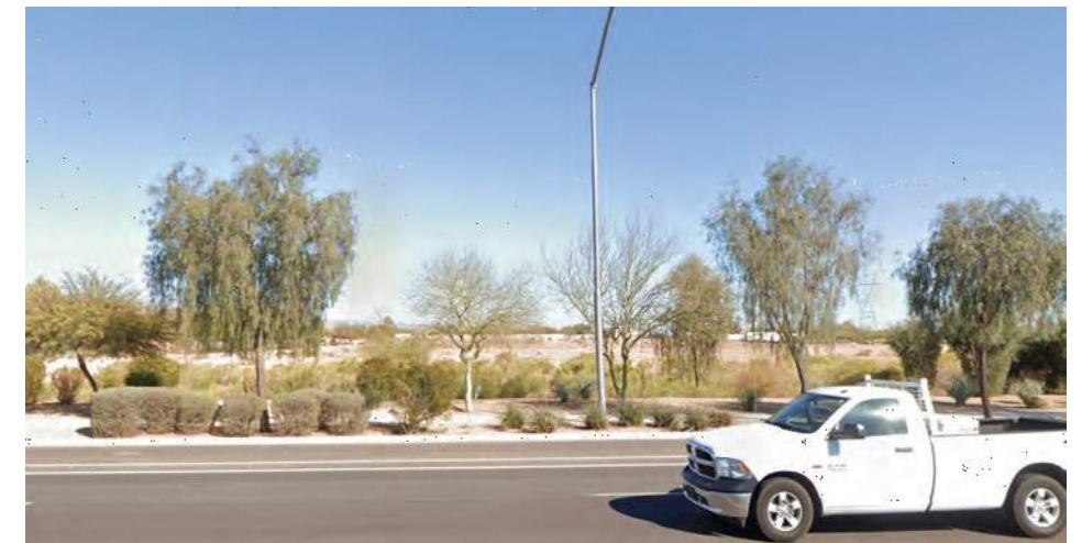
VIEW 2 - EXISTING STREET VIEW