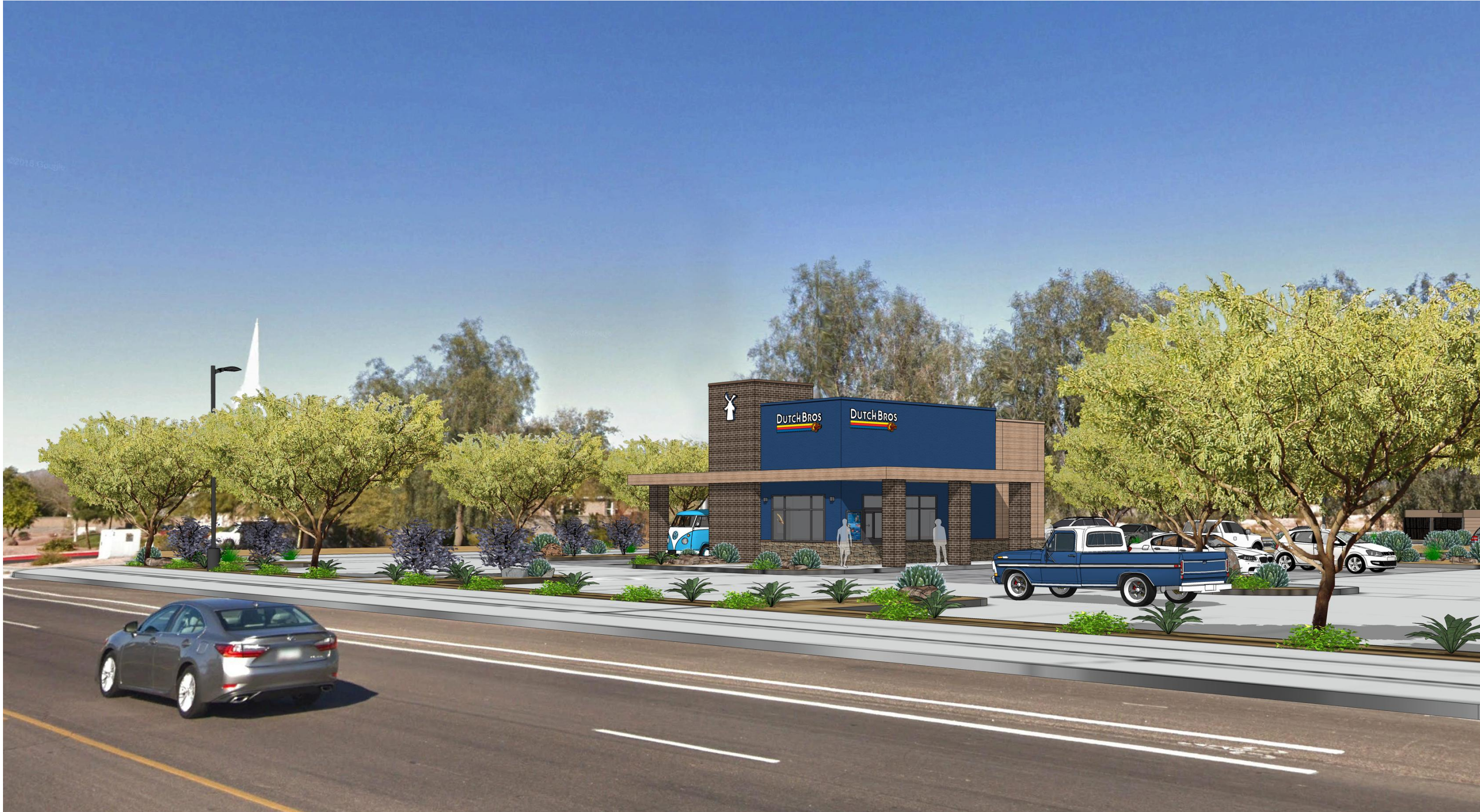
VIEW FROM S. SIGNAL BUTTE RD. FACING NORTH