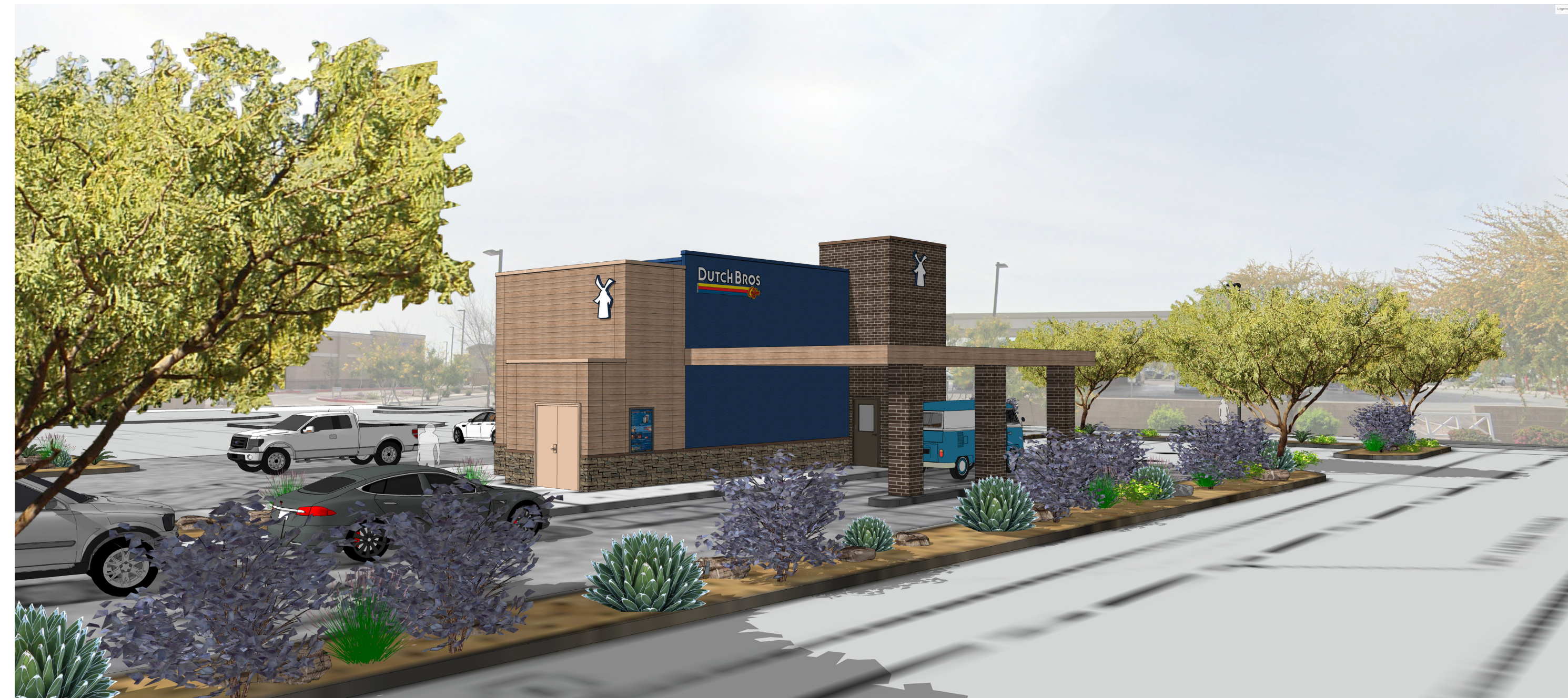
DRIVE THROUGH LANE (NORTH ELEVATION)