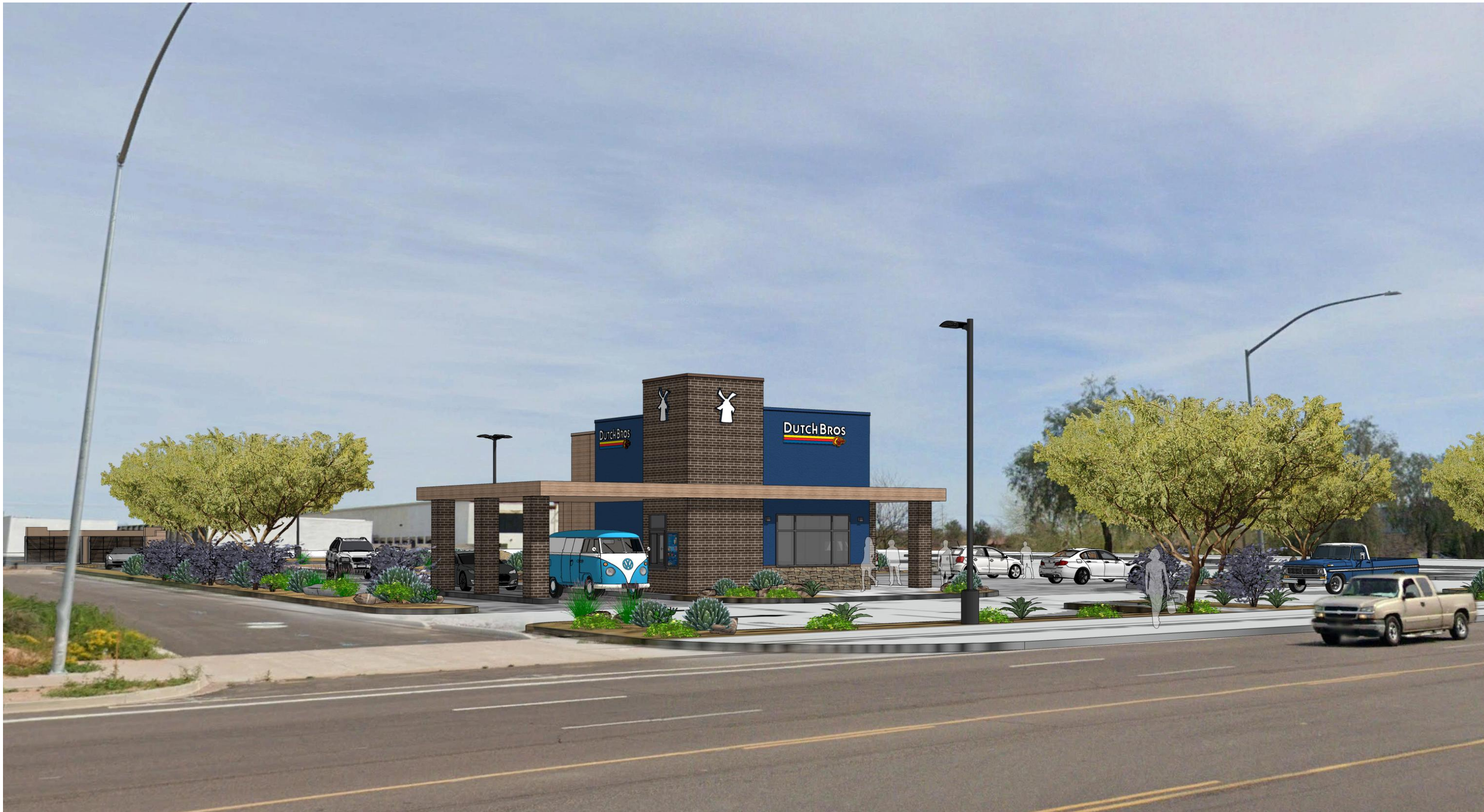
VIEW FROM S. SIGNAL BUTTE RD. FACING SOUTH