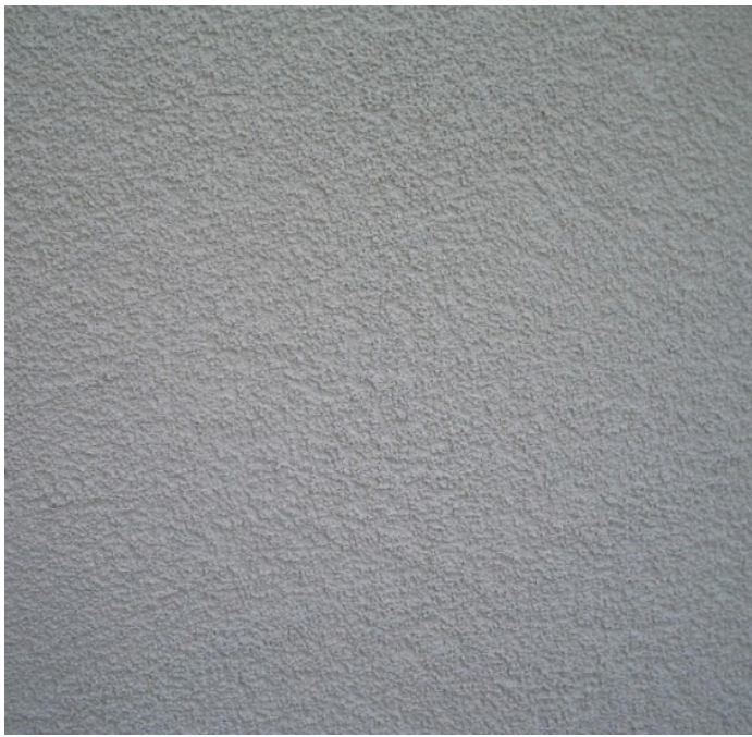
EXTERIOR INSULATION AND FINISH SYSTEM (EIFS) COLOR AS SHOWN ON THE COLORED ELEVATIONS