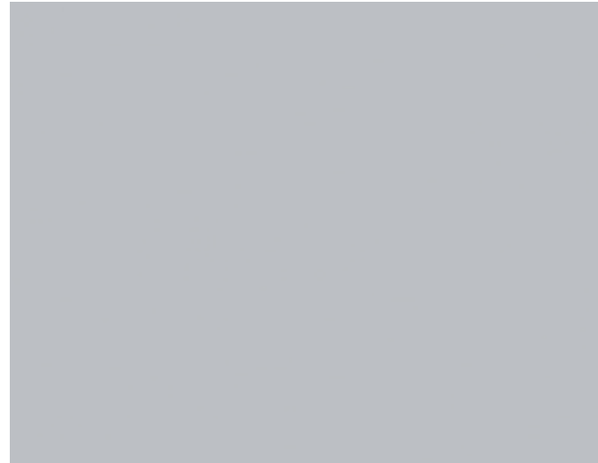
COLOR DUNN EDWARD DE 6353 SILVER LINED