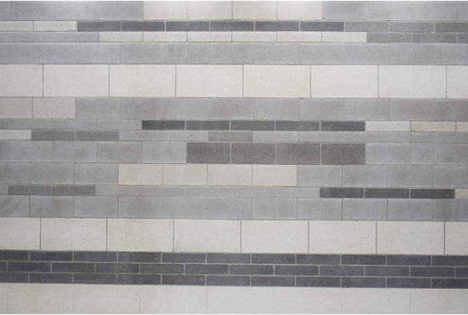
SMOOTH FINISH CMU- COLOR SILVER MIST BLEND