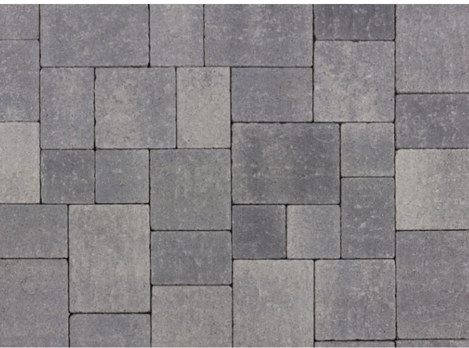
CONCRETE PAVER BELGARD- SLATE BLEND OR SMILLER