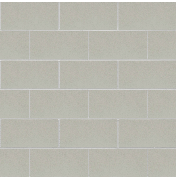
SMOOTH FINISH CMU- COLOR PEBBLE BEACH (LIGHT GRAY)