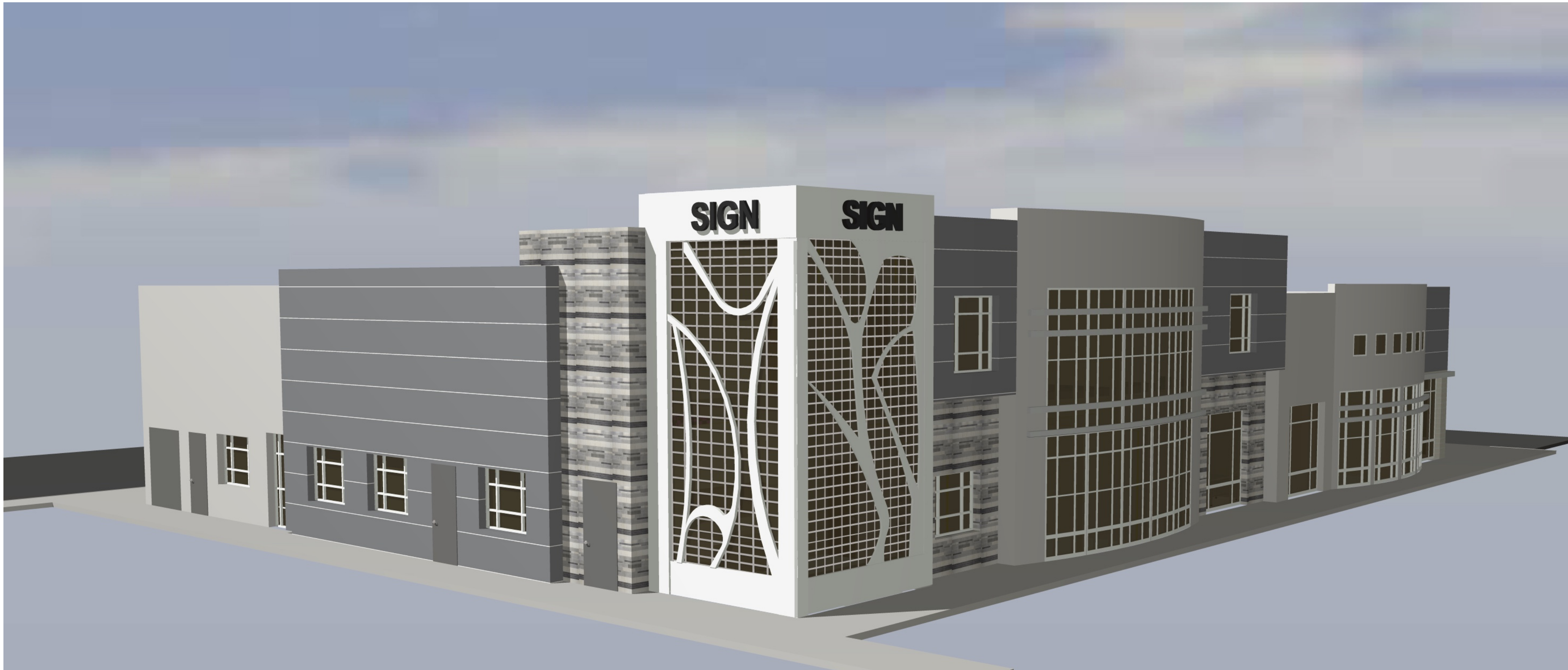
NORTH EAST VIEW