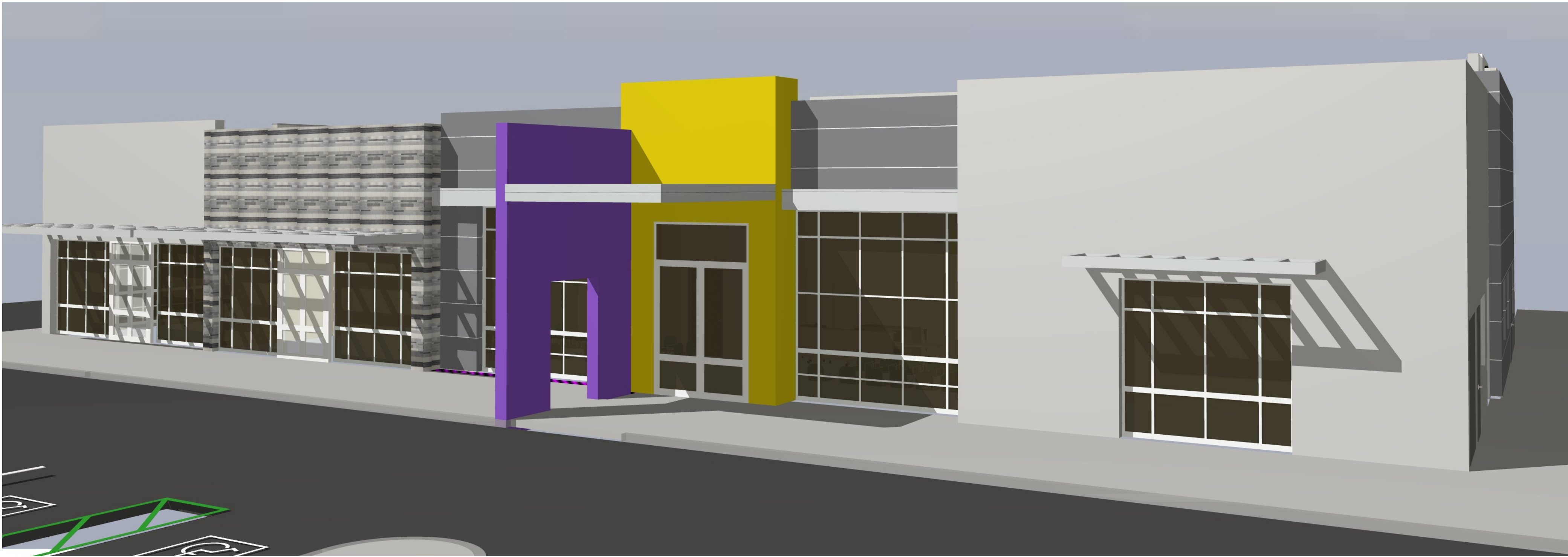
SOUTH EAST VIEW