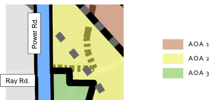
AOA Boundaries as recommended by Planning and Zoning Board

This property is at a prominent location on Power and Ray Roads. Aircraft flights in this area more typically turn north away from this property. To provide some additional flexibility to development of this property, staff is agreeable to redefining the line on this property and is recommending the AOA Boundary be changed to follow the noise contour. The map included in the attached update reflects this change.