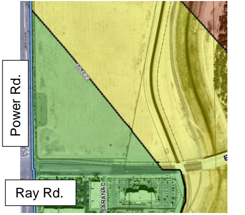
Revised proposed AOA boundaries