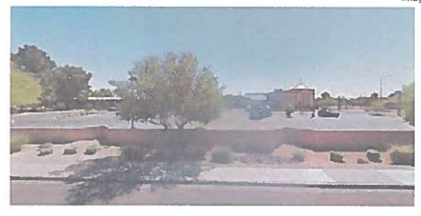
1551 E Dana Ave Mesa, AZ 85204