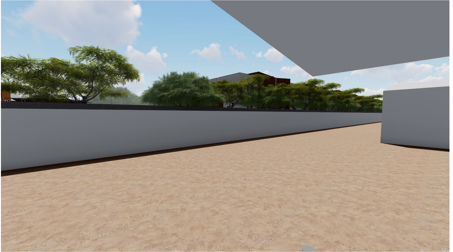
Approximate view from 7508 E. Abilene rear yard