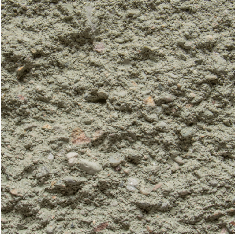
STANDARD BLOCK AND SPLIT FACE BLOCK ELECTRICAL BUILDING AND SITE WALL SUPERLITE - WILLOW GREEN