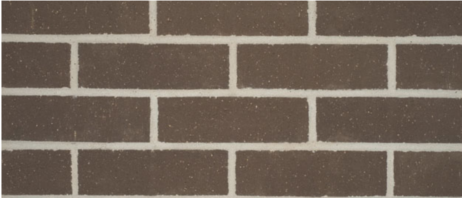
BRICK AND BRICK VENEER SITE WALL COLUMN AND WALL CAPS SUMMIT - GRAPHITE