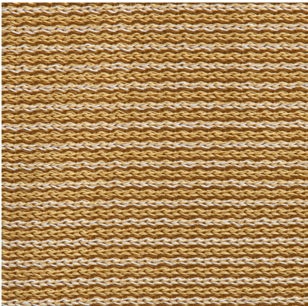
FABRIC PANELS SHADE CANOPY COMMERICAL 95 340 - DESERT SAND