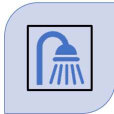
WATER HEATER REPLACEMENT