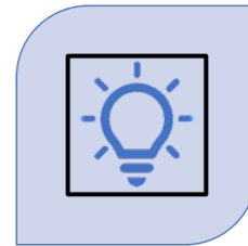
SEVERE ELECTRICAL ISSUE