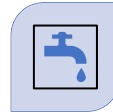
SEVERE PLUMBING ISSUE