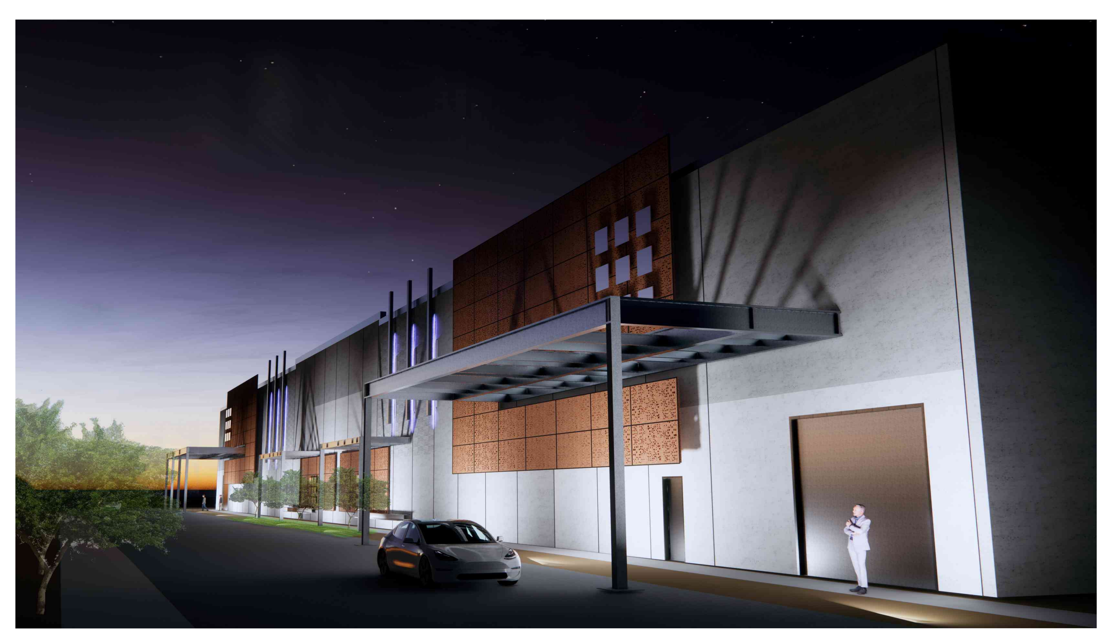
SOUTH ELEVATION REDNERING - VIEW E - NIGHTTIME

SOUTH ELEVATION RENDERING - VIEW F NIGHTTIME