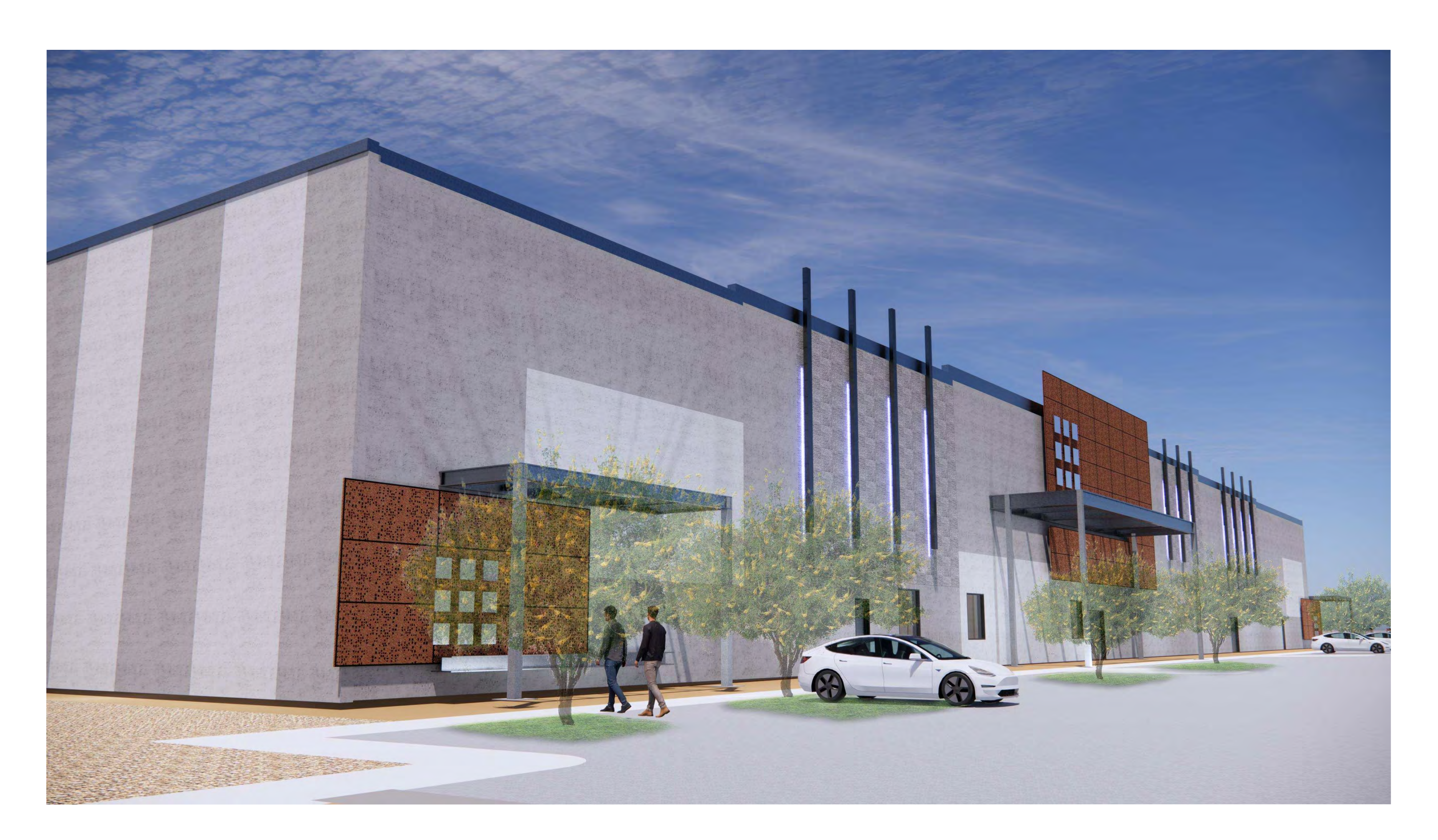
NORTH ELEVATION REDNERING - VIEW C - DAYTIME