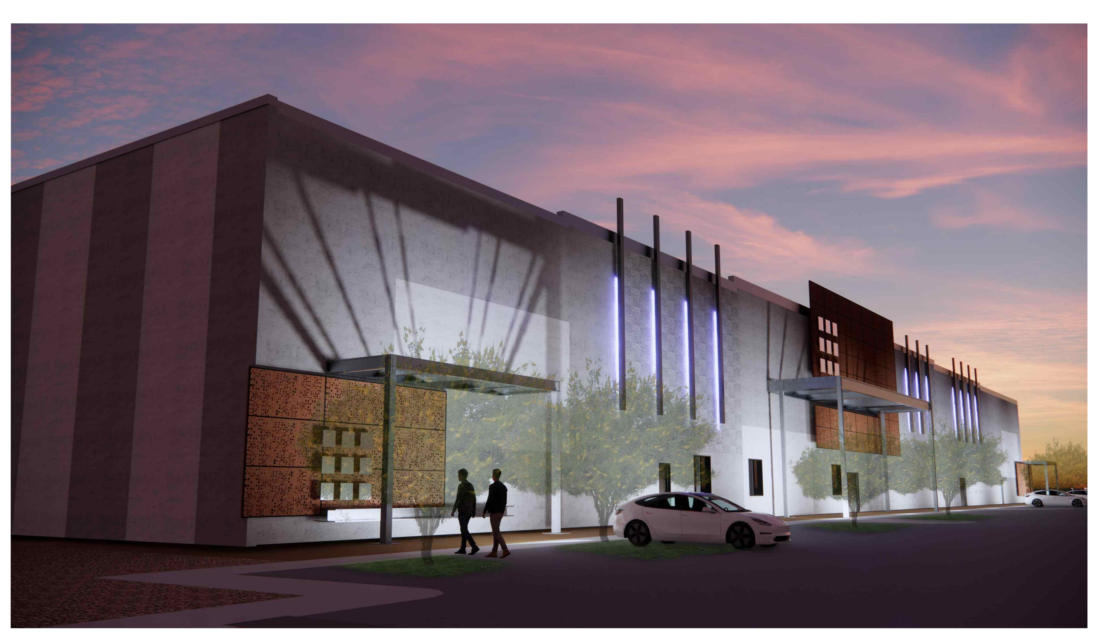
NORTH ELEVATION REDNERING - VIEW C - NIGHTTIME

NORTH ELEVATION RENDERING - VIEW D NIGHTTIME