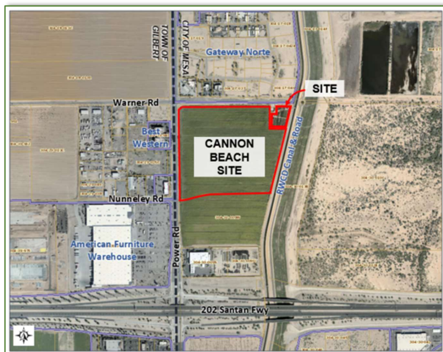
Figure 1 – Site Aerial

Pew & Lake, PLC, on behalf of Action Zone Business, LLC, is pleased to submit this Project Narrative and related exhibits for development requests to allow for a 1.6-net acre addition to the approved 37-acre Cannon Beach Mixed Use PAD. Cannon Beach is a regional commercial-entertainment mixed use development located at the southeast corner of Power Road and Warner Road in Mesa. The subject property is east of the intersection and further identified on the Maricopa County Assessor's Map as a portion of parcel number 304-30-011B (the "Property," see Site Aerial below). This proposal completes the project area adjacent to the canal on Warner Road at the project's back door. This minor modification continues to apply the same approved design in the Cannon Beach PAD and its related DRB cases. These plans represent the more finalized version for construction of this highly unique project that has been the first of its kind in Mesa and the Metro-Phoenix area.