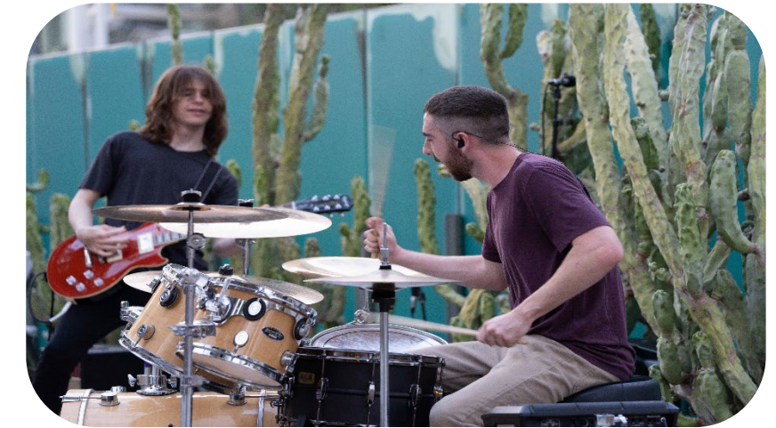
Featured Performing Arts