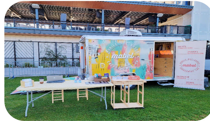
MABEL Hands- On Experiences

Six community events, one in each Council District, to take place in neighborhood parks. Each event to include: