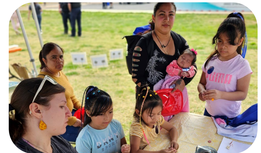
Family Friendly Event