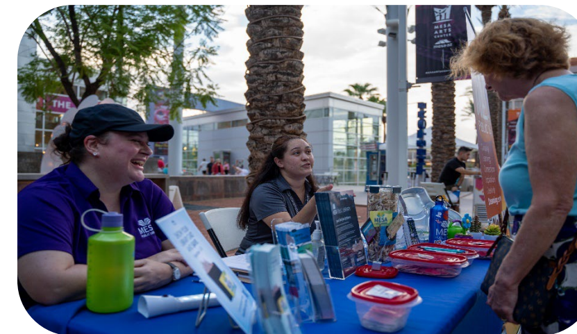
Activities & Community Engagement