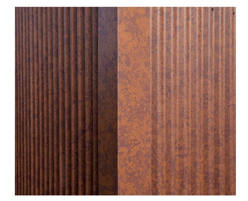
Corrugated Metal Panel Manufacturer: Western States Metal Style: 7/8" Corrugated Panel Color: Painted Rusted

Manufacturer: Echelon Masonry Style: Mesastone, Stacked Bond Color: Malibu Sand