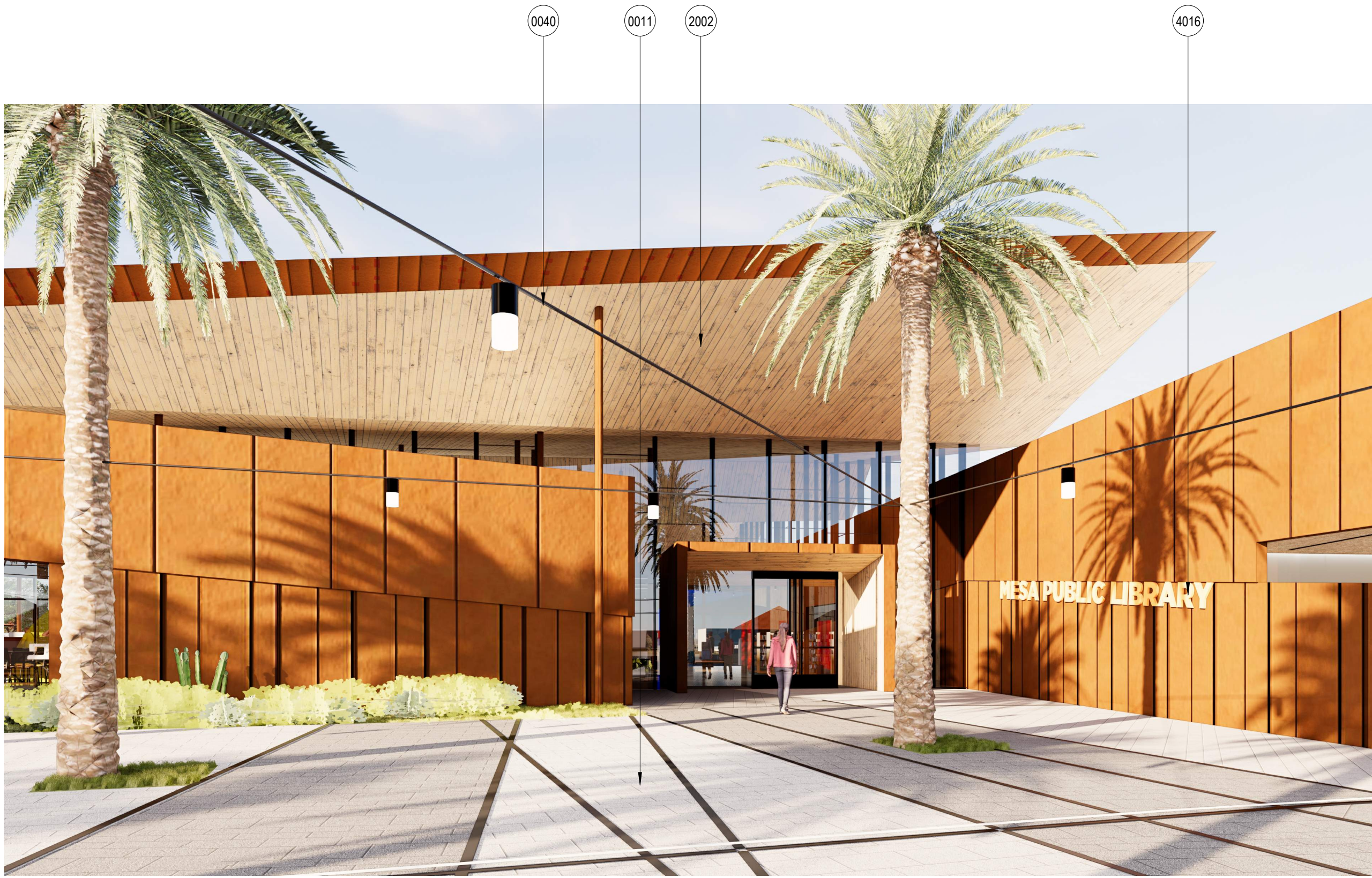
2 RENDERING MAIN ENTRY A-111/A-909 NTS