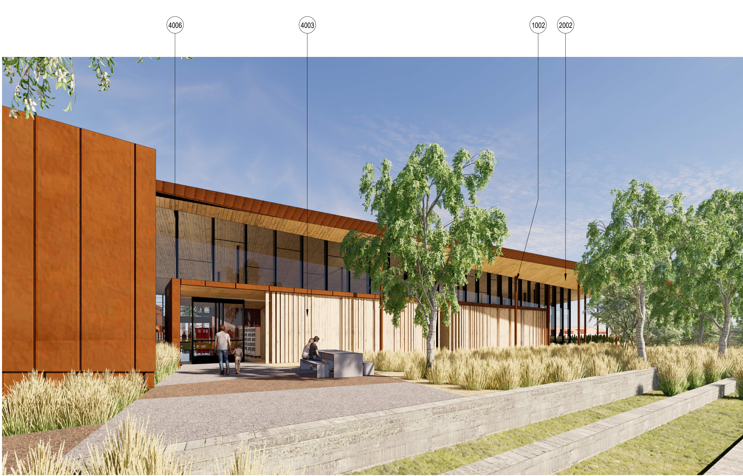
1 RENDERING WEST ENTRY A-111/A-909 NTS