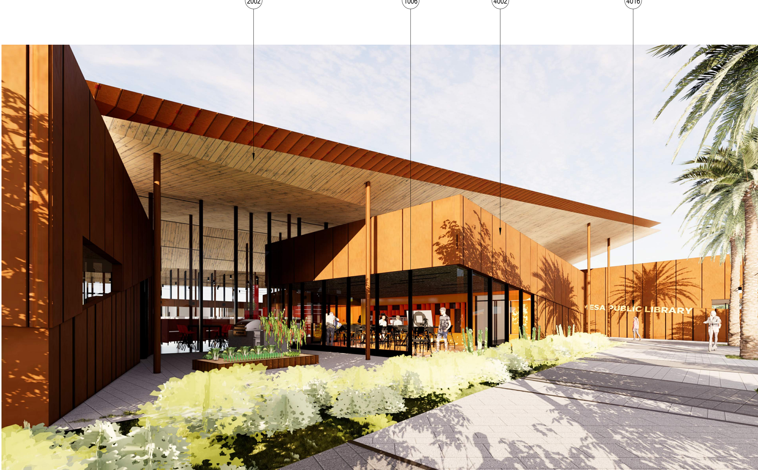
5 RENDERING THINKSPOT PATIO A-111/A-909 NTS