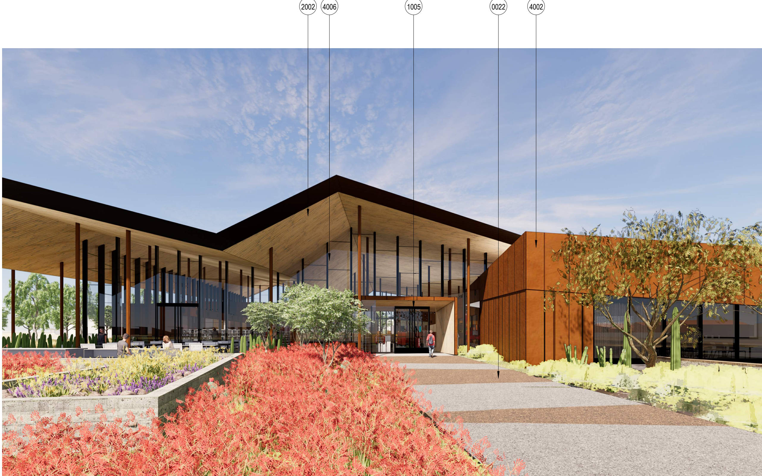
3 RENDERING SOUTH ENTRY A-101/A-909 NTS