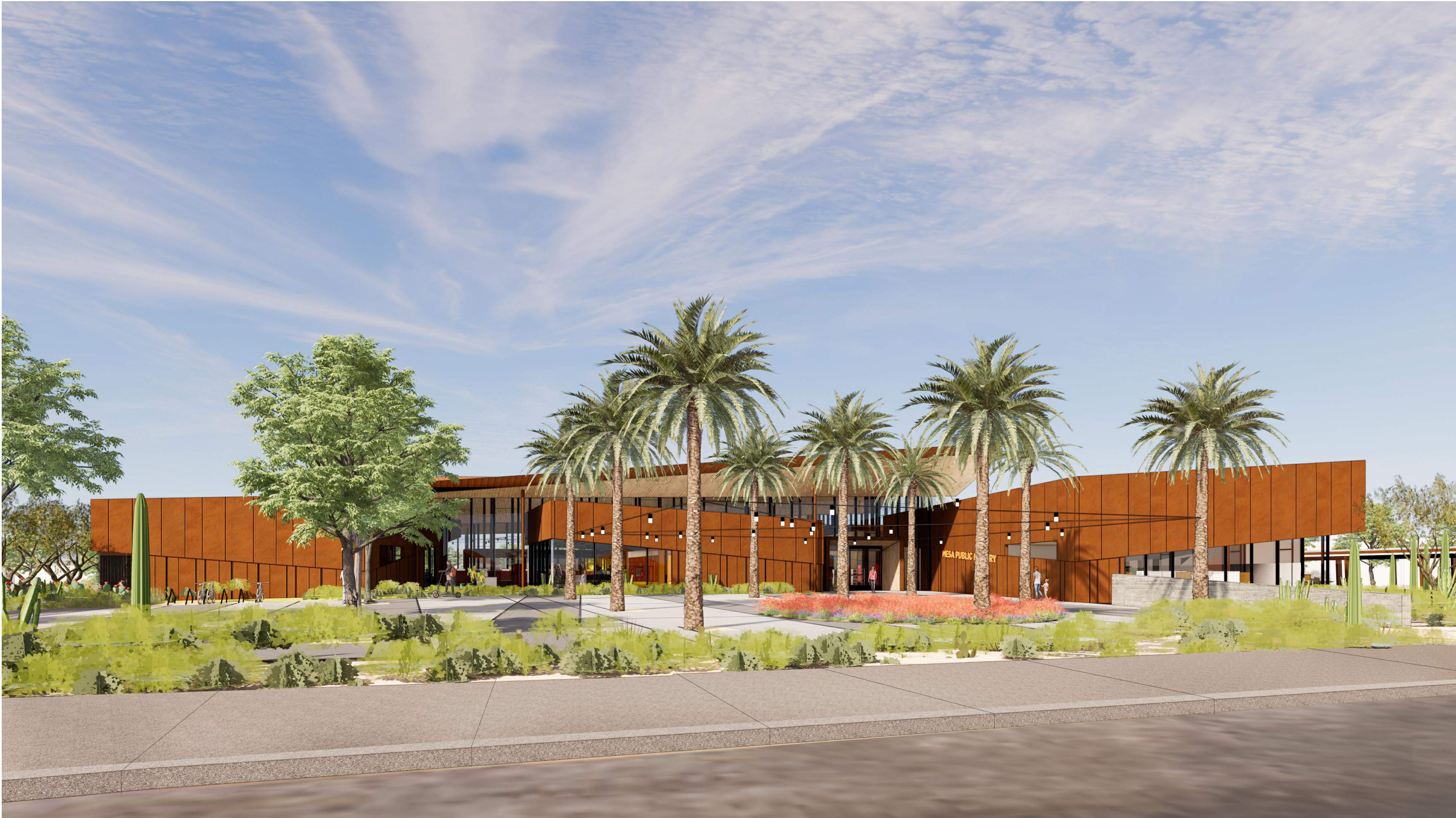
1 A-101/A-211 NTS EXTERIOR PERSPECTIVE - FROM EAST

1. RENDERED VIEWS ARE FOR REFERENCE ONLY. SEE TECHNICAL DRAWINGS FOR ADDITIONAL INFORMATION & MATERIAL DESIGNATIONS