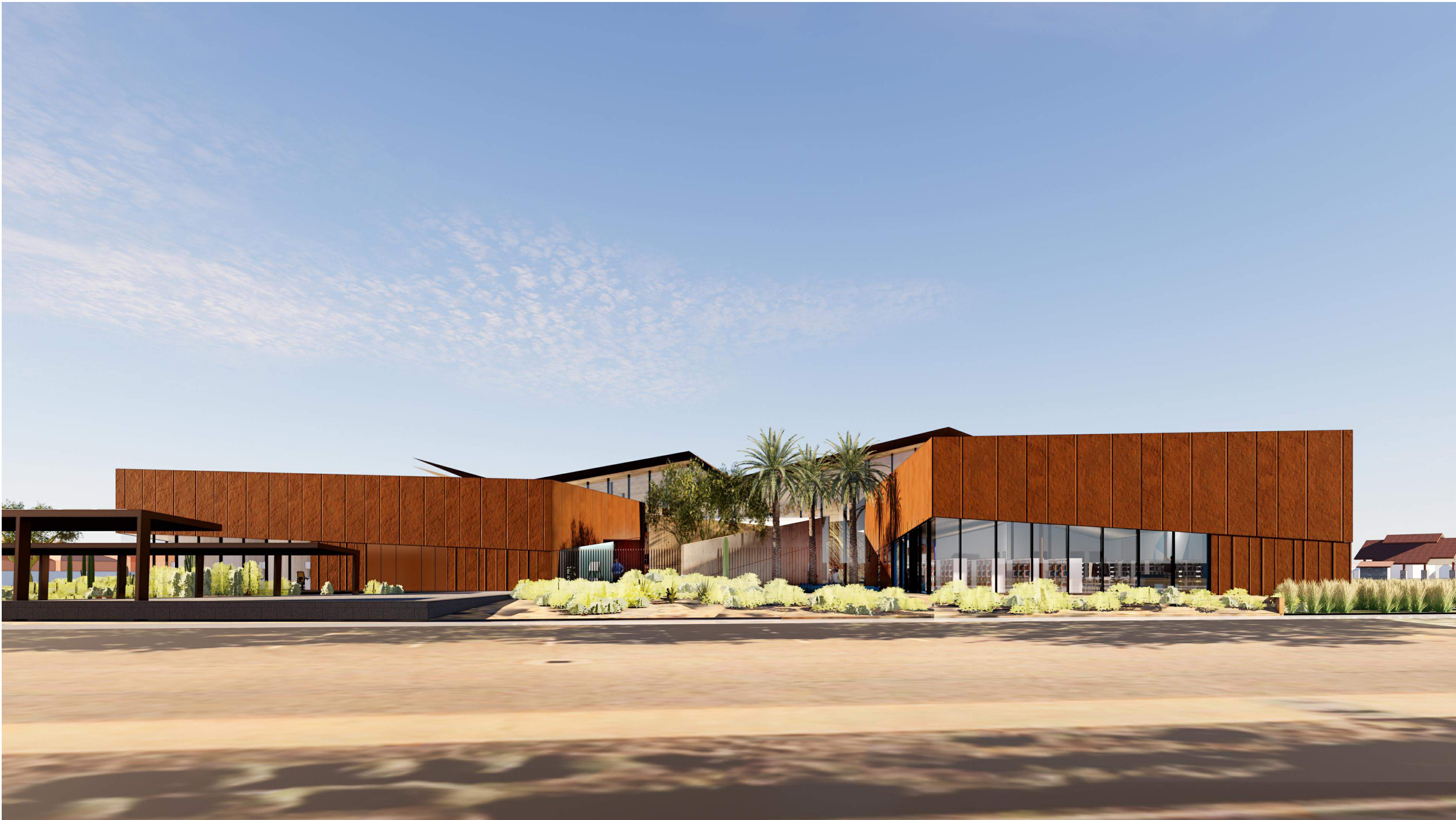
1 A-101/A-212 NTS EXTERIOR PERSPECTIVE - FROM NORTH