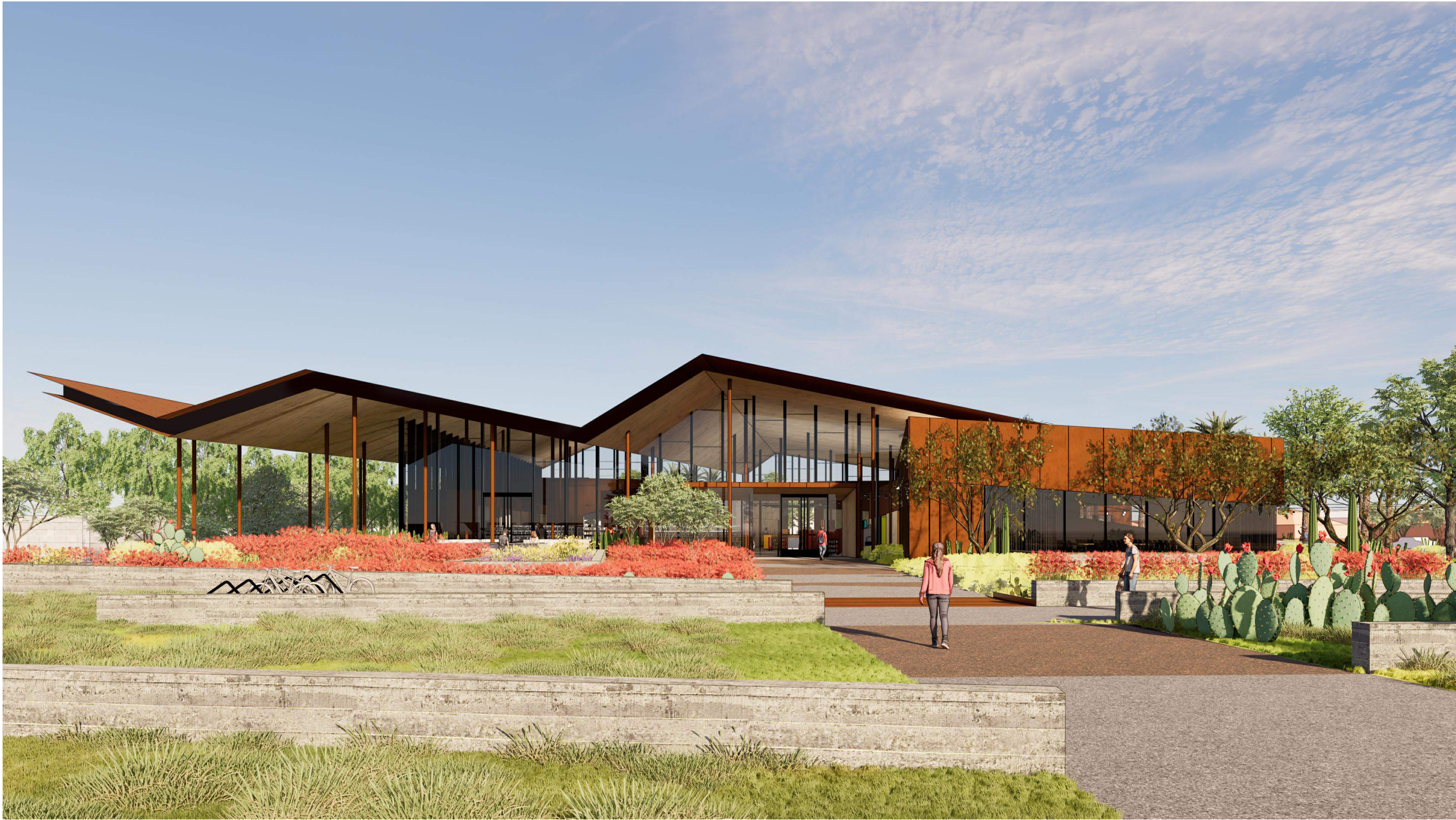
2 A-101/A-211 NTS EXTERIOR PERSPECTIVE - FROM SOUTH