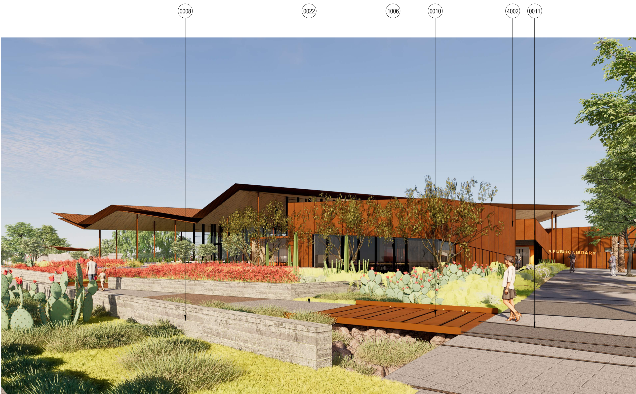
6 RENDERING SOUTHEAST APPROACH A-101/A-909 NTS