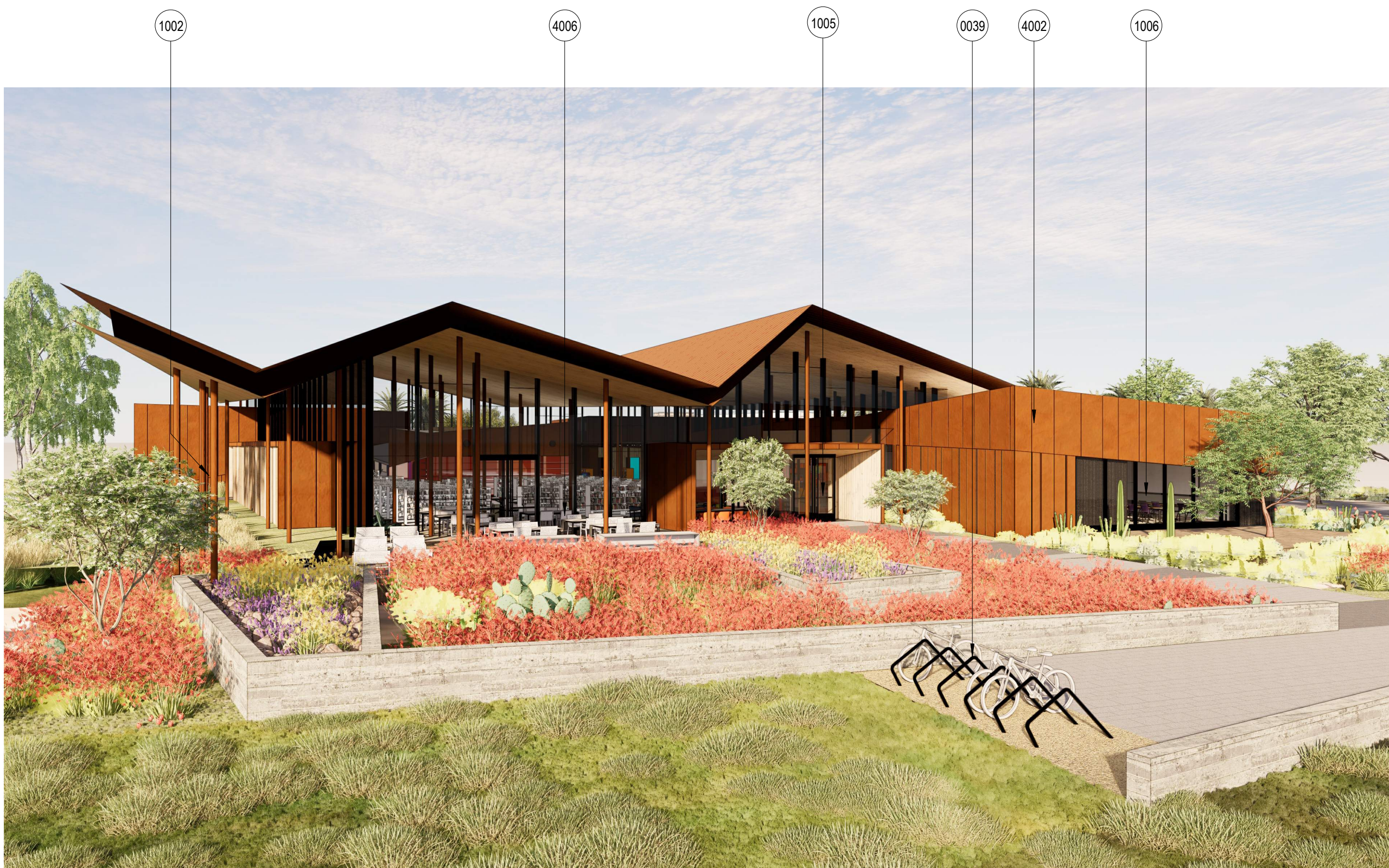
4 RENDERING READING PATIO A-101/A-909 NTS