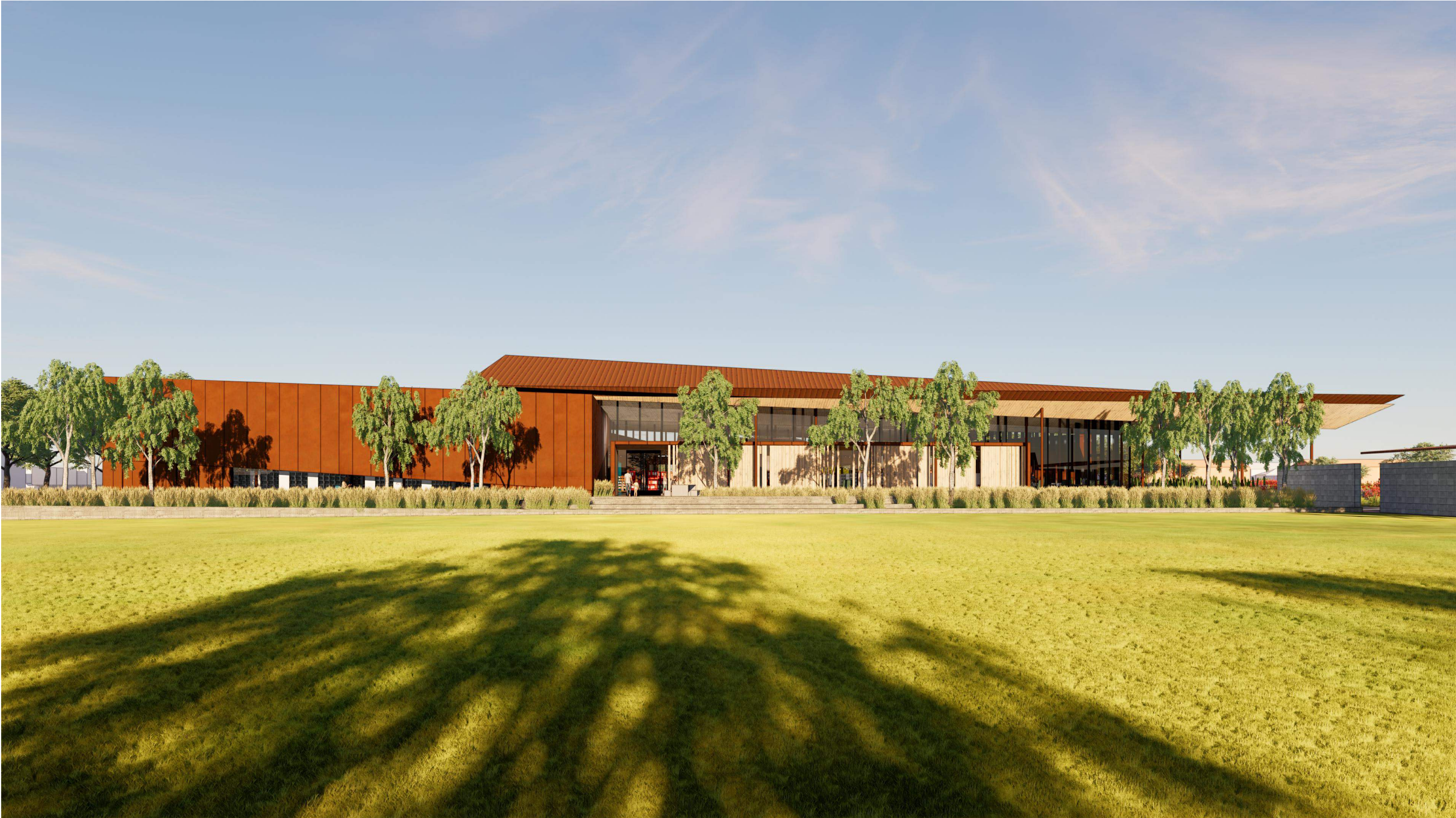
2 A-101/A-212 NTS EXTERIOR PERSPECTIVE - FROM WEST

1. RENDERED VIEWS ARE FOR REFERENCE ONLY. SEE TECHNICAL DRAWINGS FOR ADDITIONAL INFORMATION & MATERIAL DESIGNATIONS