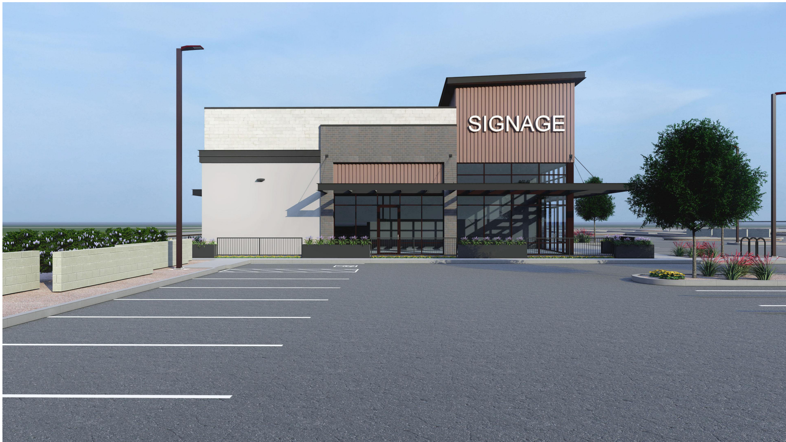
3 A203 1/4" = 1'-0" CADENCE SHOPS-VIEW FROM EAST SIDE