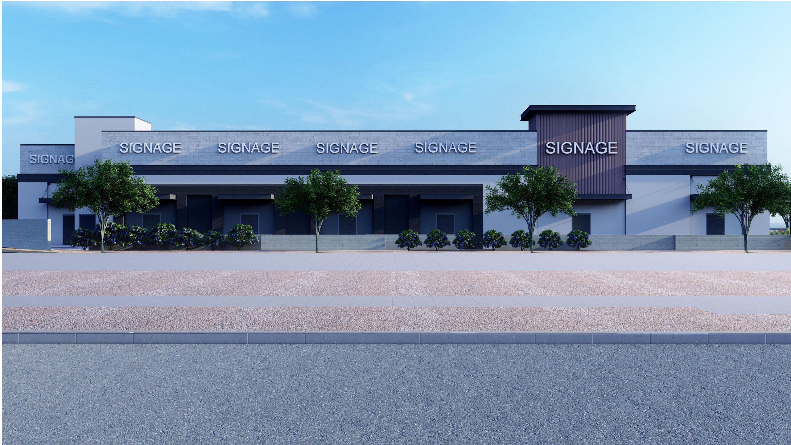
3 A203/ RAY SHOPS - VIEW FROM NORTH SIDE 1/4" = 1'-0"