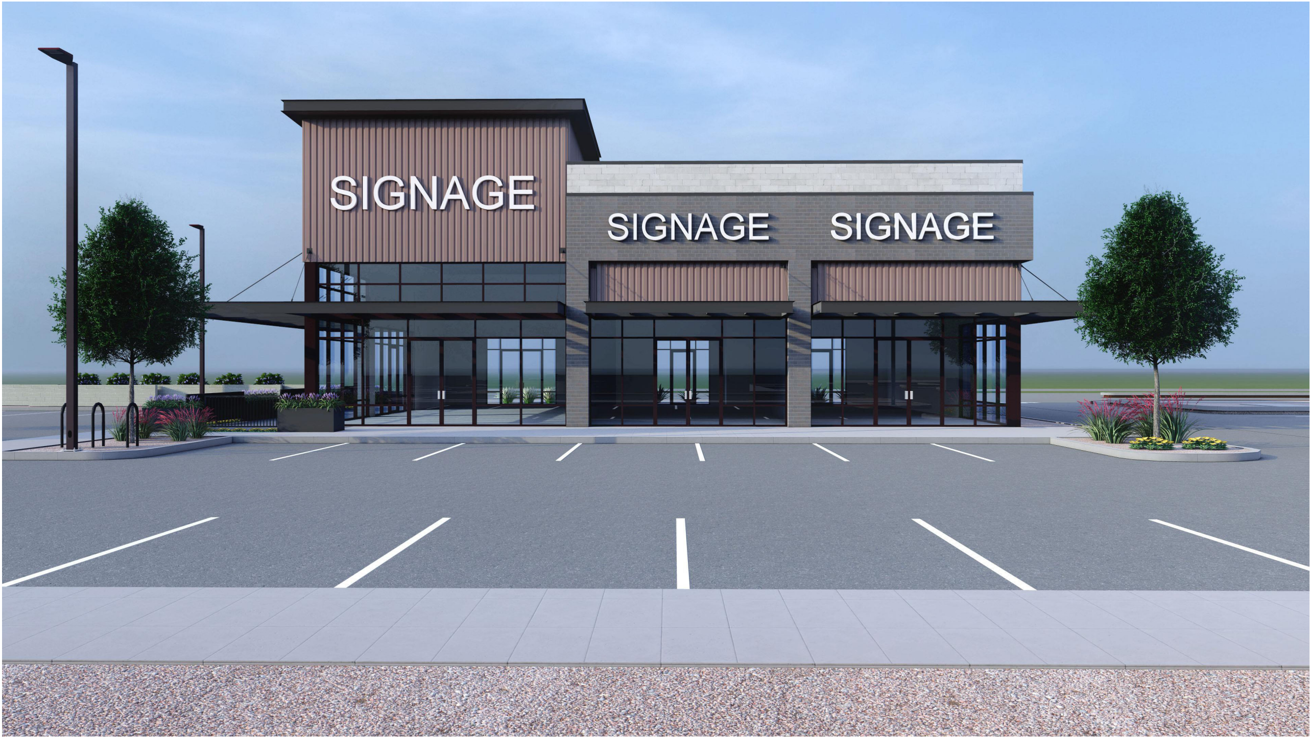
2 A203 1/4" = 1'-0" CADENCE SHOPS-VIEW FROM NORTH SIDE