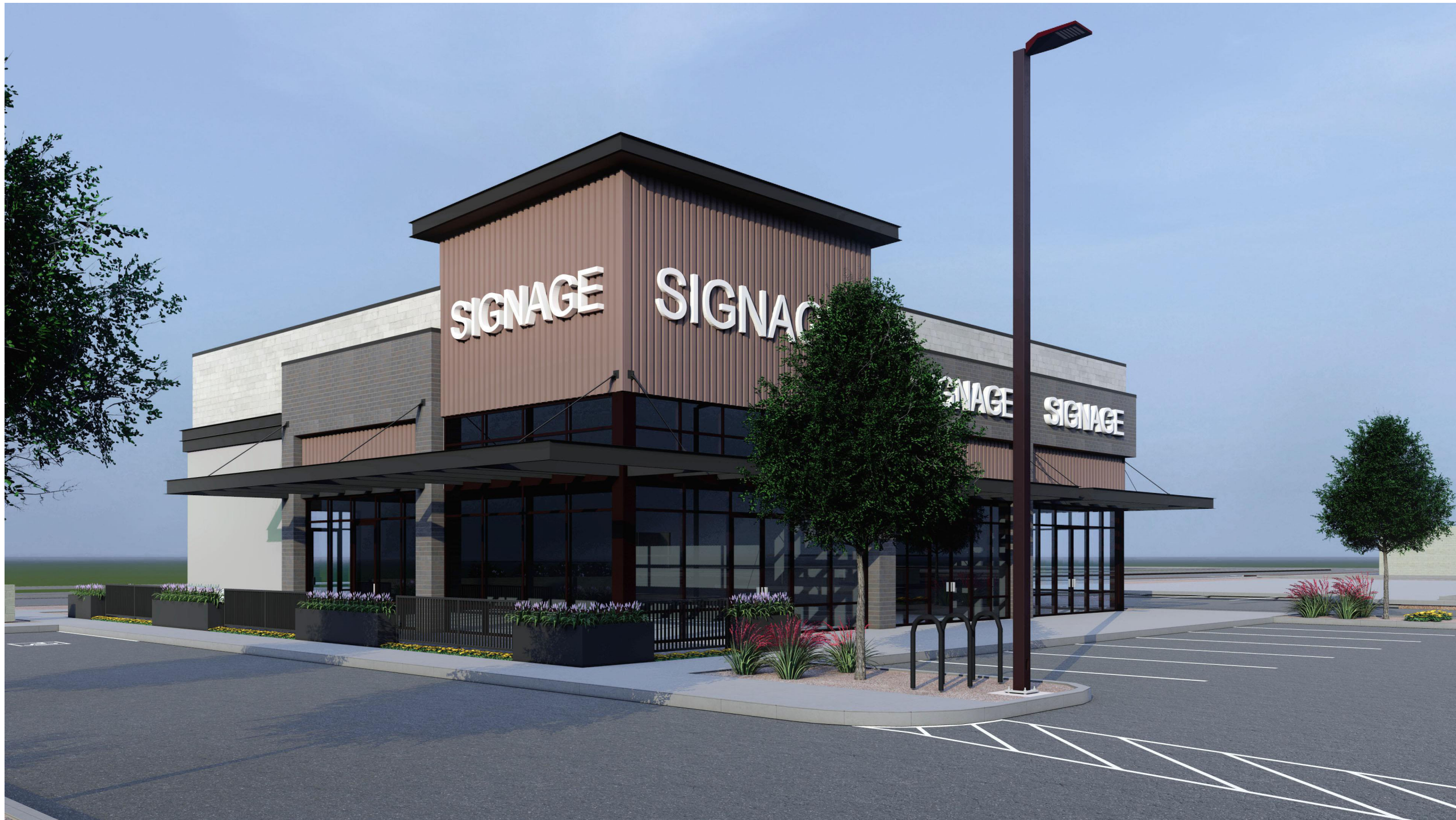
1 A203 1/4" = 1'-0" CADENCE SHOPS-VIEW FROM NE CORNER