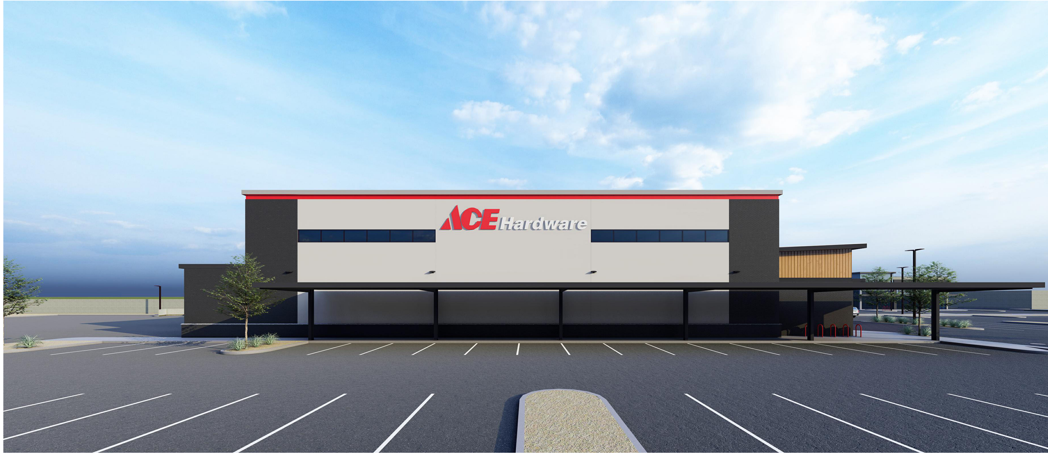
4 ACE HARDWARE-VIEW FROM NORTH SIDE A204/ 12" = 1'-0"