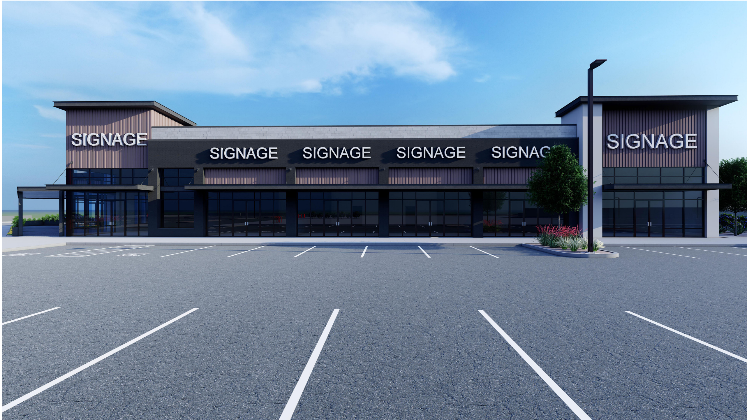
1 A203/ RAY SHOPS - VIEW FROM SOUTH SIDE 1/4" = 1'-0"