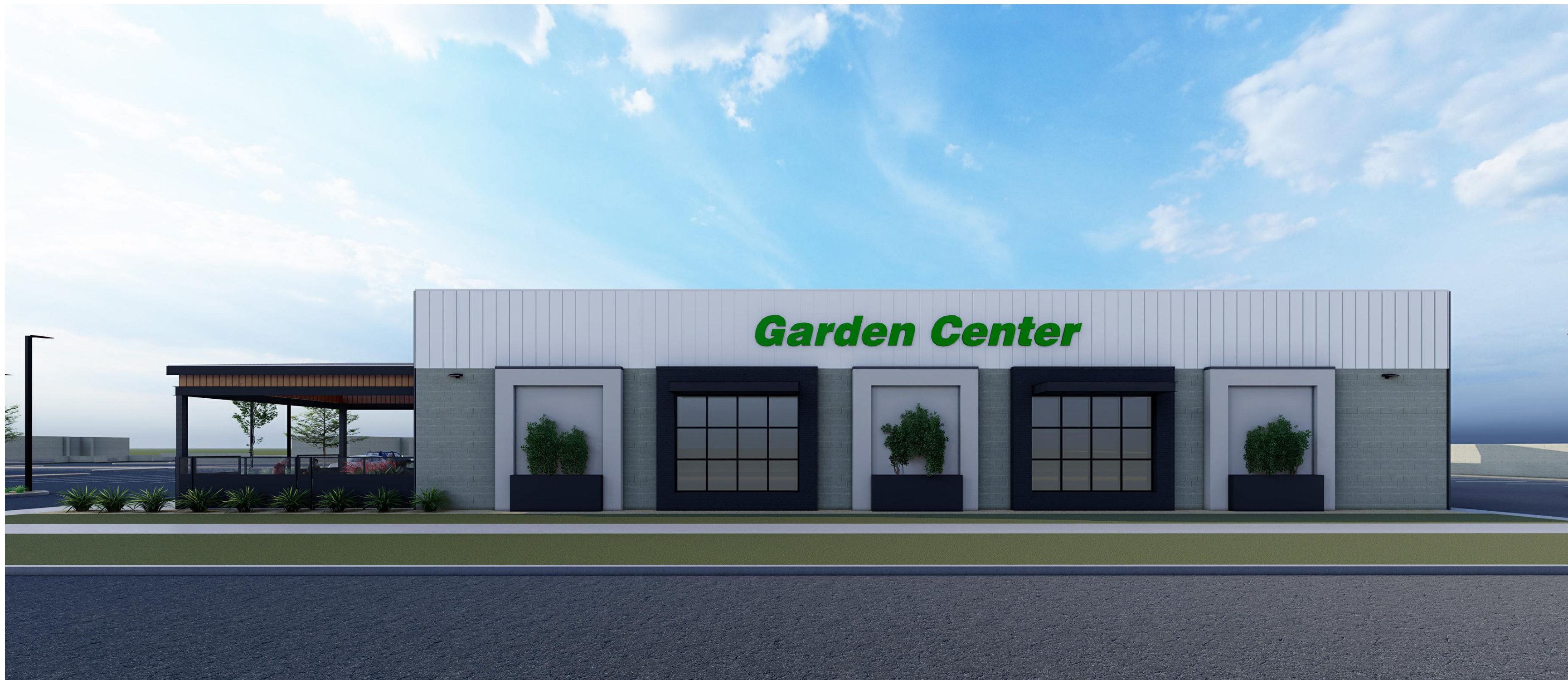
5 ACE HARDWARE-VIEW FROM SOUTH SIDE A204/ 12" = 1'-0"