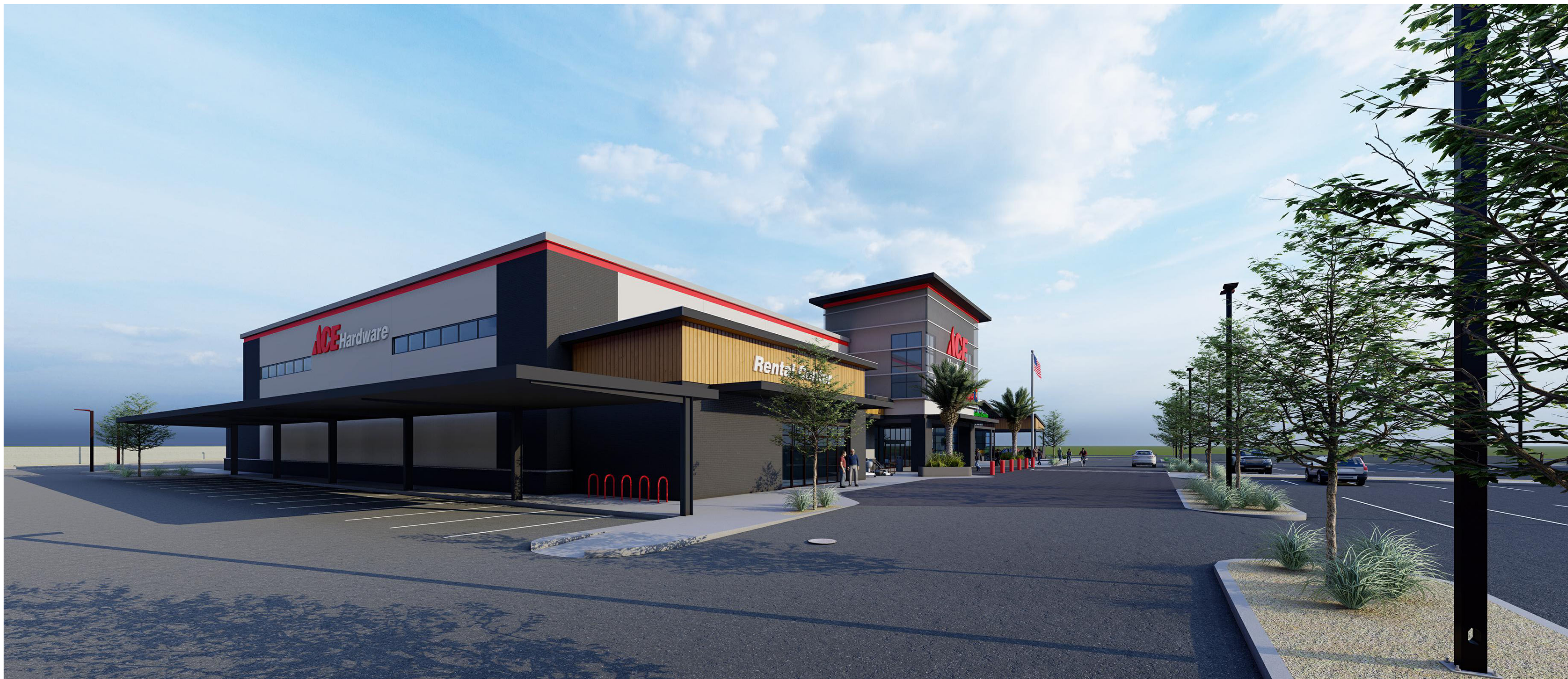
3 ACE HARDWARE-VIEW FROM NW CORNER A204/ 12" = 1'-0"