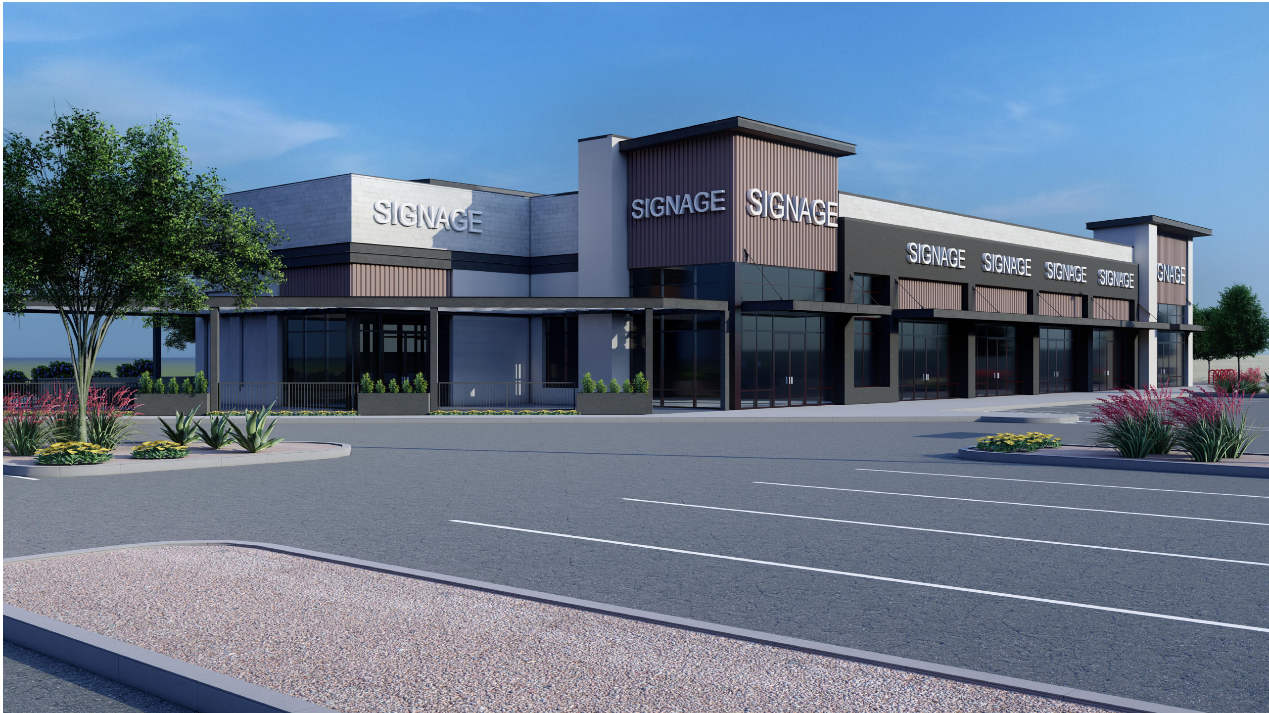
2 A203/ RAY SHOPS - FROM SE CORNER 1/4" = 1'-0"