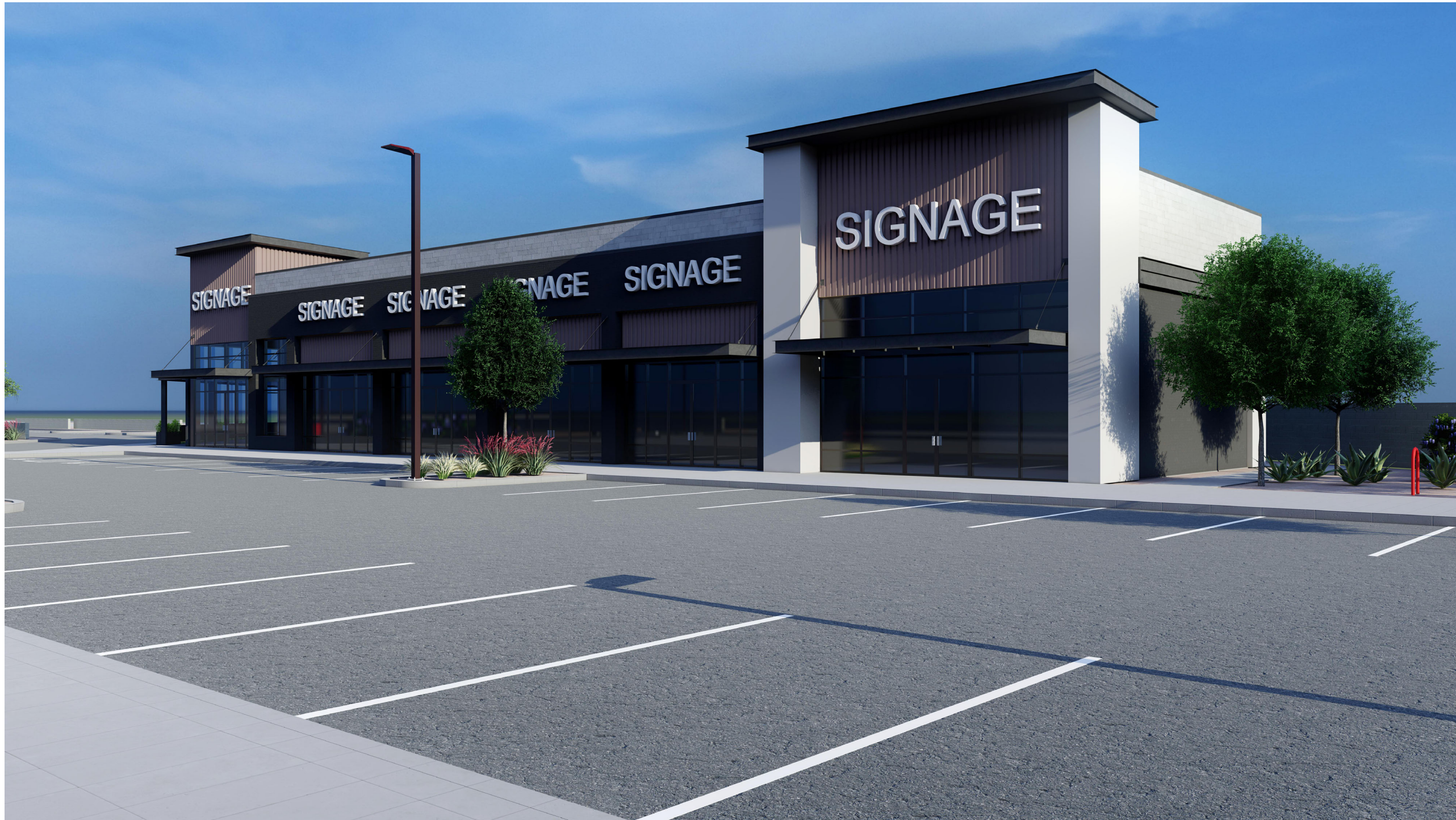
4 A203/ RAY SHOPS - VIEW FROM SW CORNER 1/4" = 1'-0"