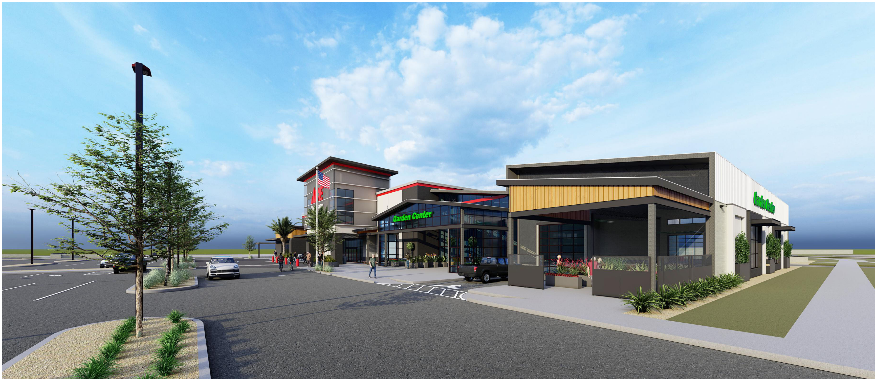
2 ACE HARDWARE-VIEW FROM SW CORNER A204/ 12" = 1'-0"