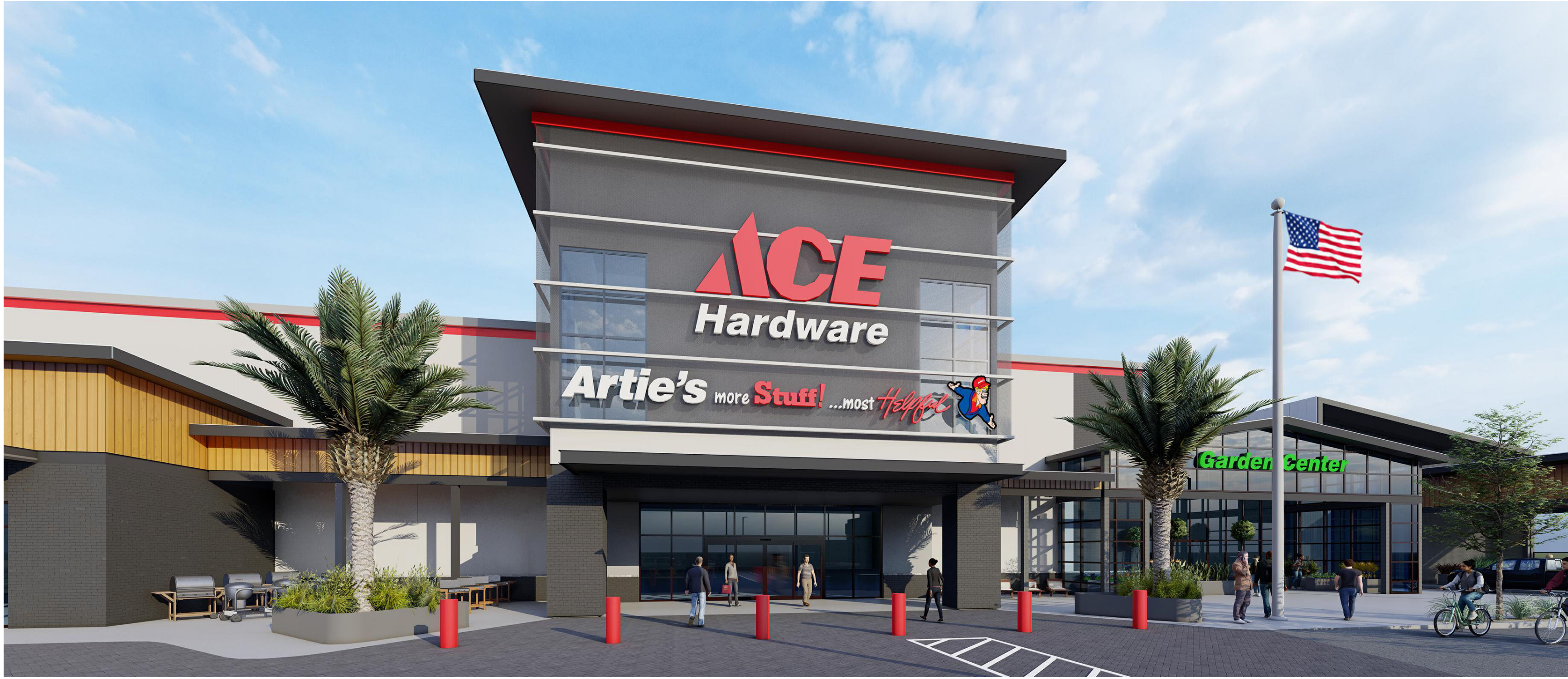
6 ACE HARDWARE-WALK UP VIEW A204/ 12" = 1'-0"