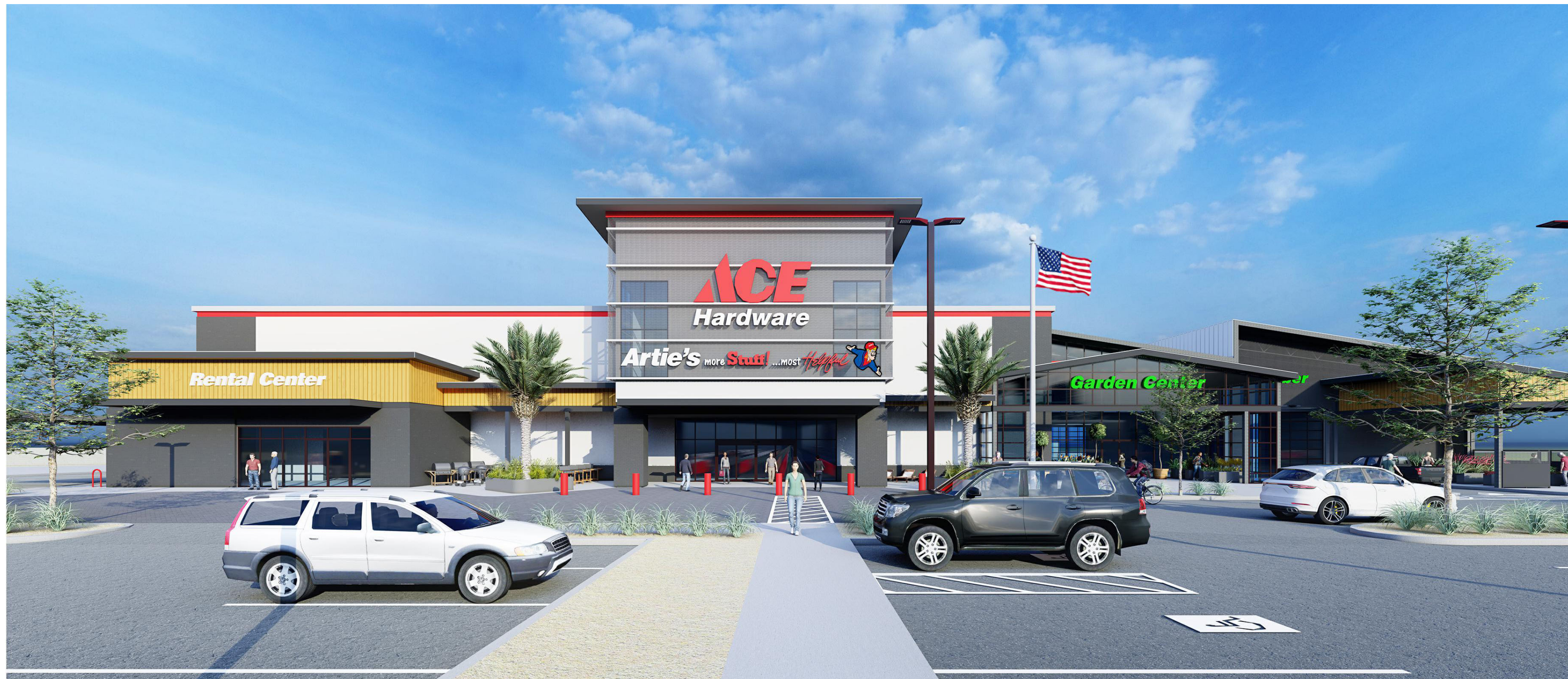
1 ACE HARDWARE-VIEW FROM WEST SIDE A204/ 12" = 1'-0"