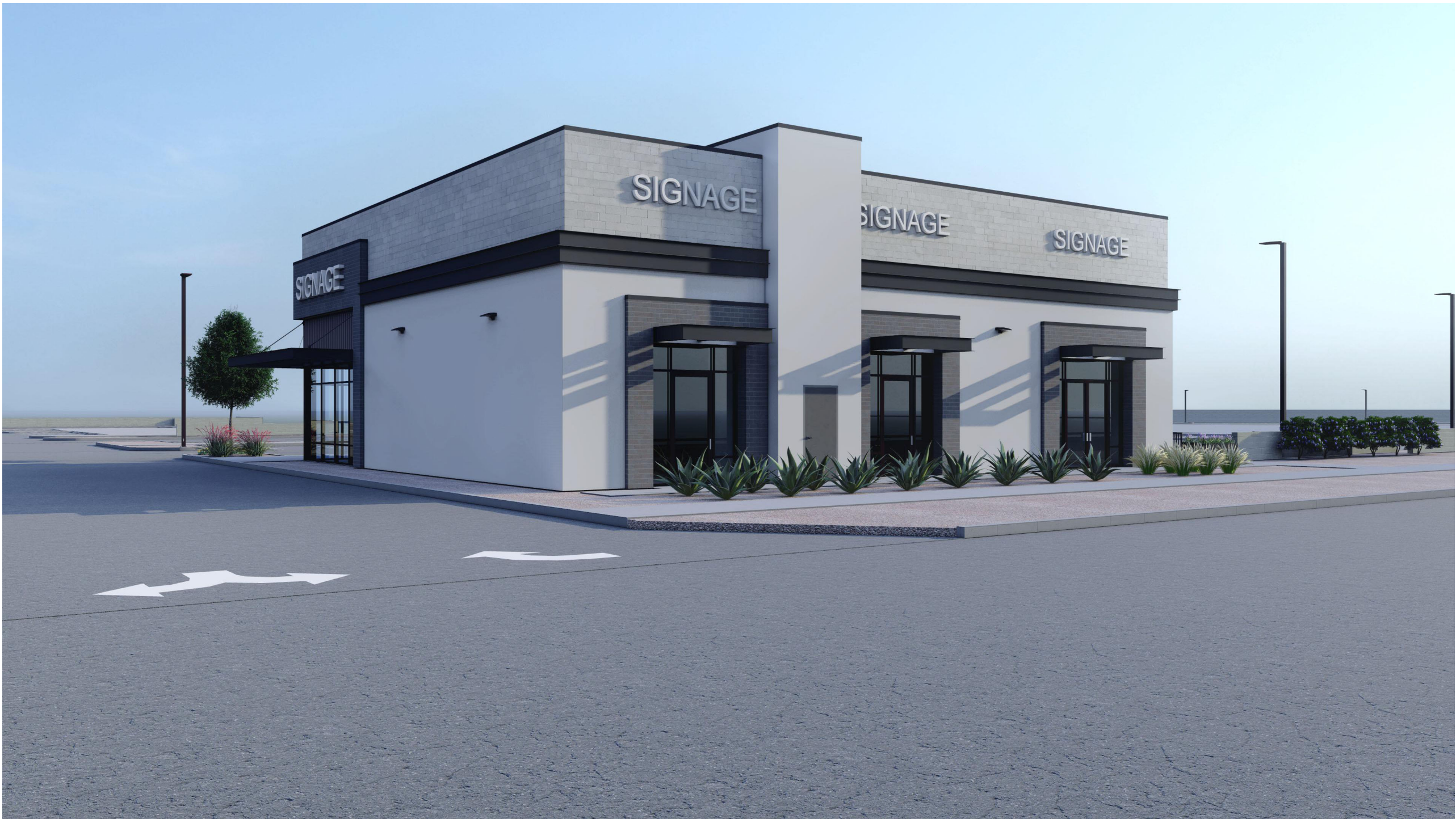
4 A203 1/4" = 1'-0" CADENCE SHOPS-VIEW FROM CADENCE