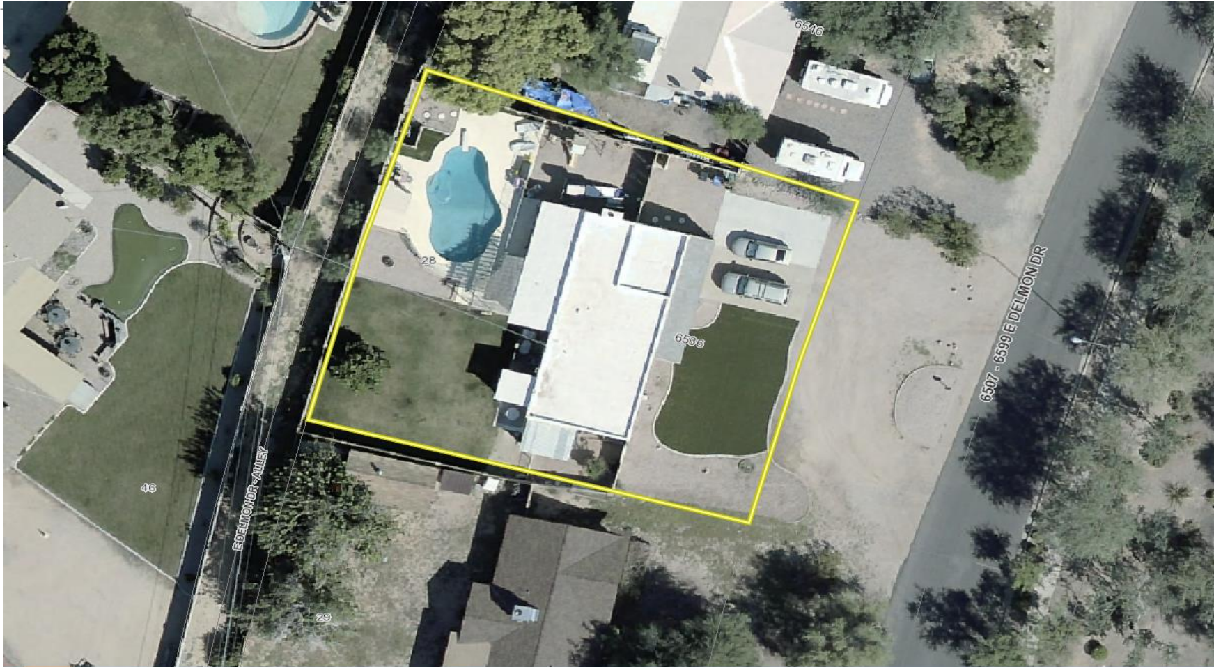
Arial Photo of the site