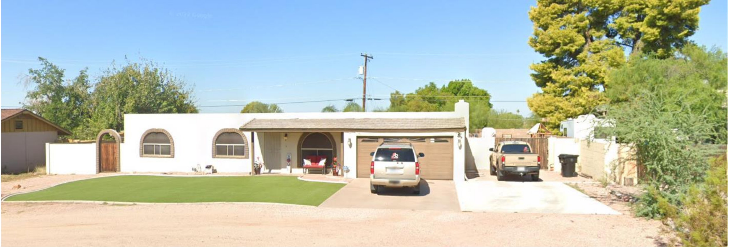
Picture of the site looking west from East Delmon Drive