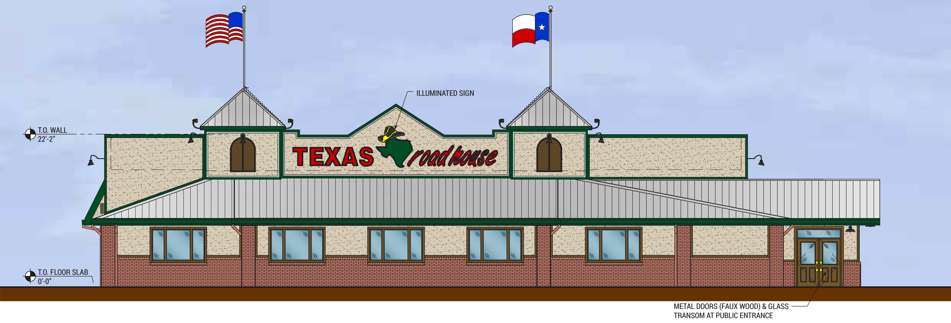
FRONT ELEVATION (WEST)