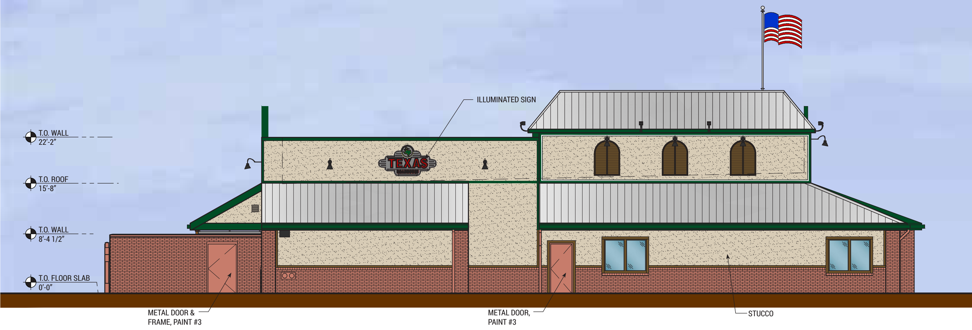
LEFT ELEVATION (NORTH)