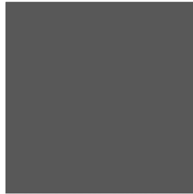
C SW 7069 "IRON ORE" D BY: SHERWIN WILLIAMS