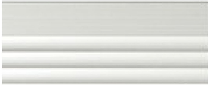
E GLAZING WITH ANODIZED ALUMINUM FRAME