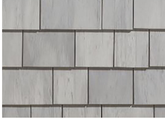
B CERTAINTeed NORTHWOODS VINYL SHAKES COLOR - "DRIFTWOOD BLEND"