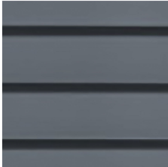
L CERTAINTED CEDARBOARDS INSULATED SIDING 6" - COLOR : "PACIFIC BLUE"