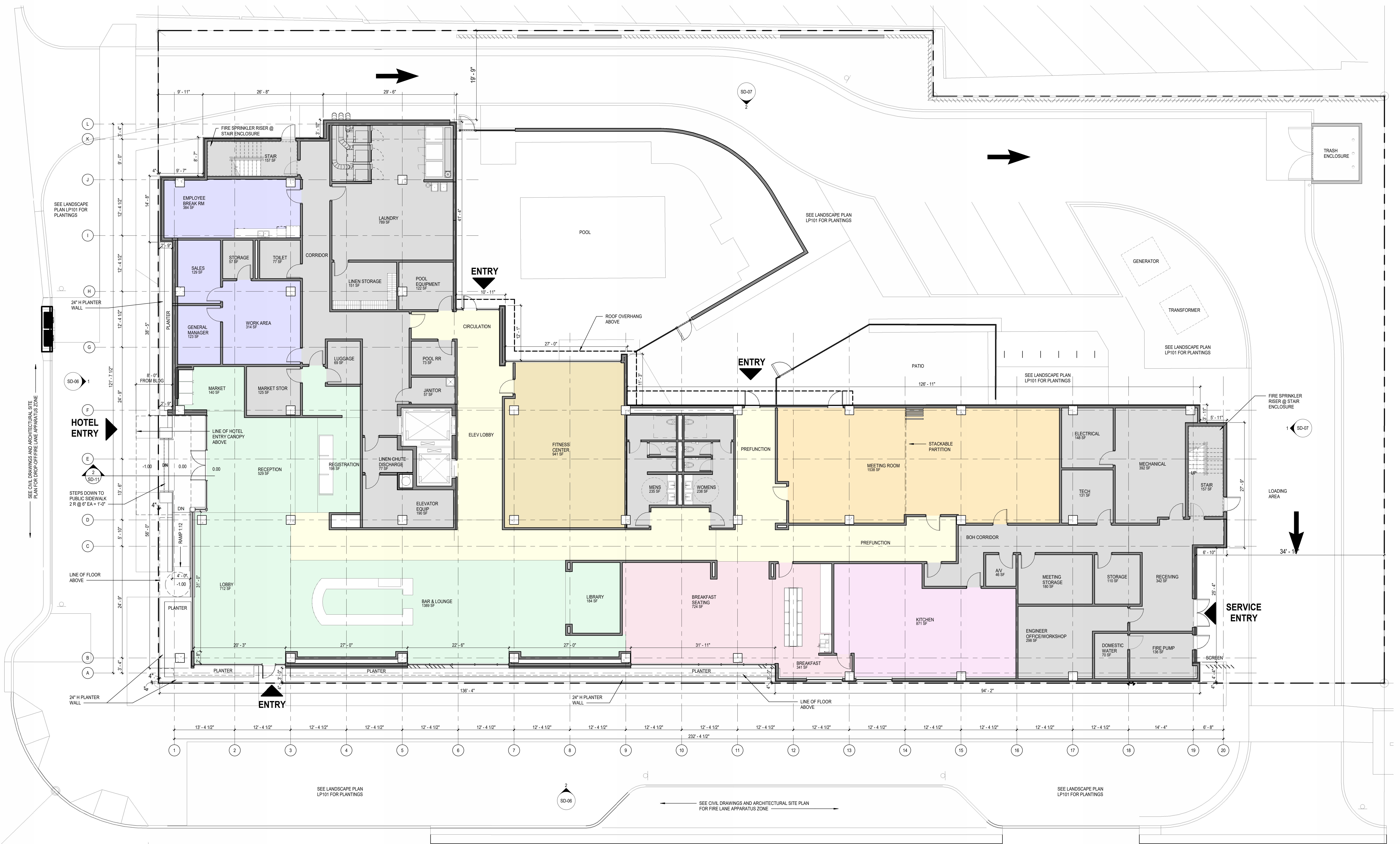
OVERALL FLOOR PLAN, LEVEL 1 SCALE: 1/8" = 1'-0"

NOTE: SEE ARCHITECTURAL SITE PLAN SD-03a FOR SITE DIMENSIONS