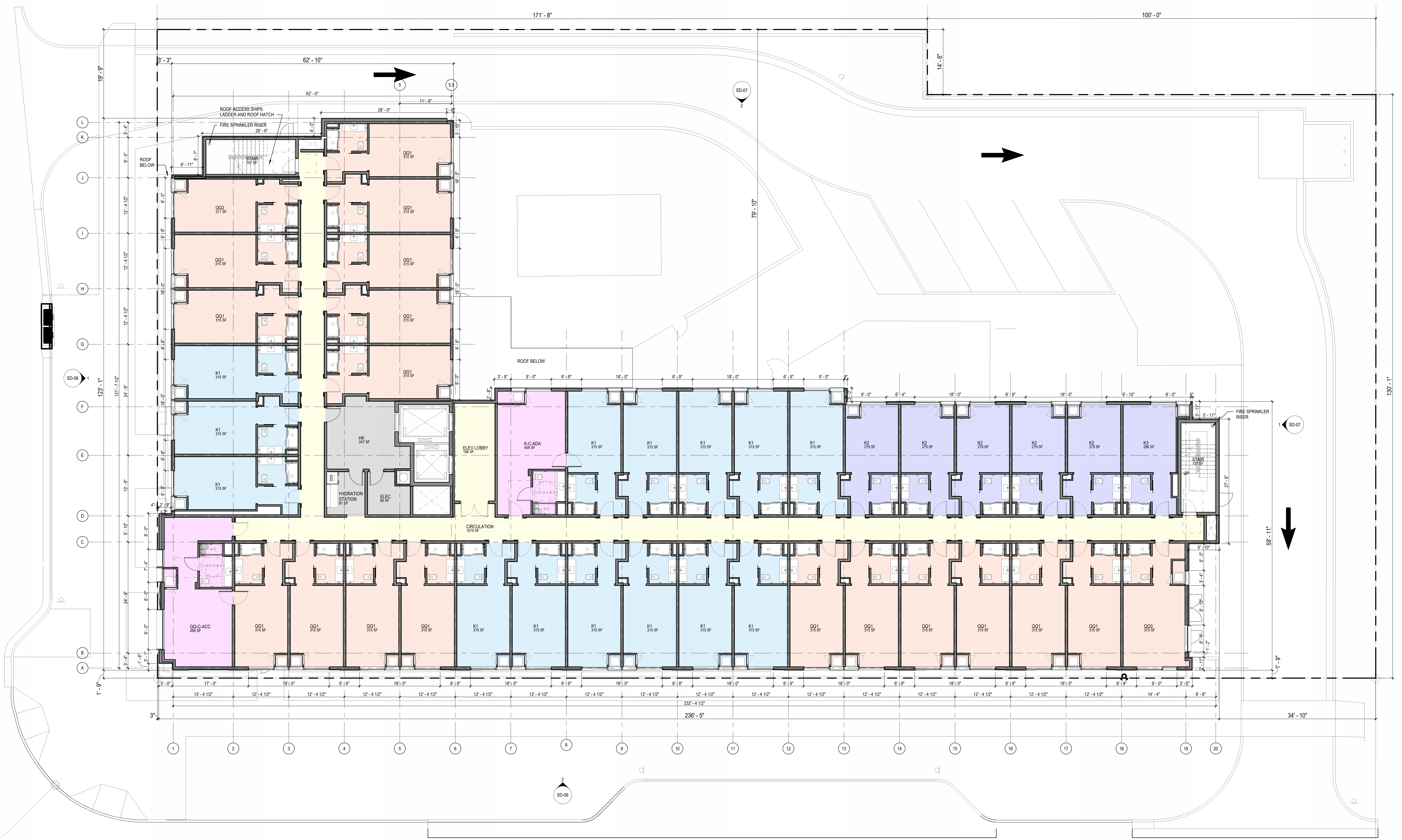
LEVEL 02 - FLOOR PLAN