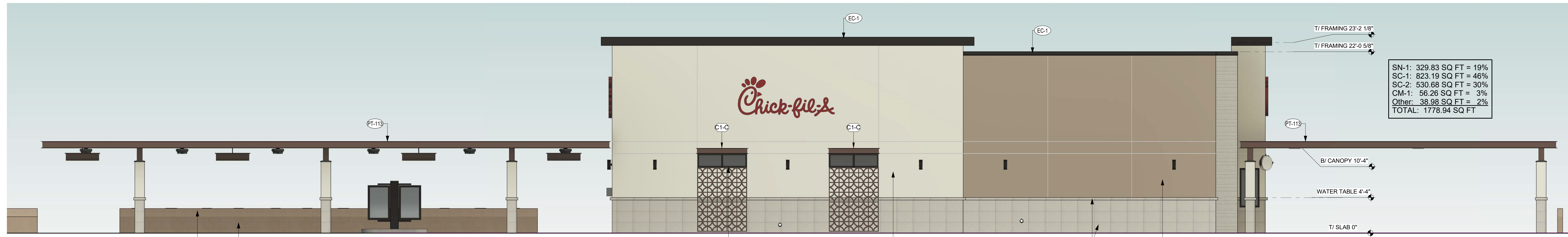
1 EXTERIOR ELEVATION- SOUTH 3/16" = 1'-0"

SN-1: 329.83 SQ FT = 19% SC-1: 823.19 SQ FT = 46% SC-2: 530.68 SQ FT = 30% CM-1: 58.26 SQ FT = 3% Other: 38.98 SQ FT = 2% TOTAL: 1778.94 SQ FT