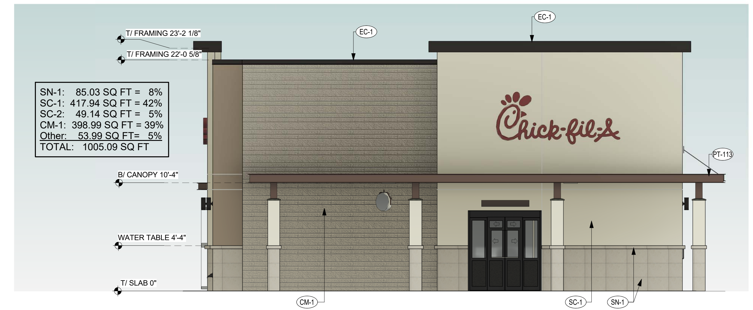
4 EXTERIOR ELEVATION- EAST 3/16" = 1'-0"

SN-1: 177.41 SQ FT = 18% SC-1: 514.53 SQ FT = 50% SC-2: 276.90 SQ FT = 28% Other: 47.93 SQ FT = 5% TOTAL: 1016.77 SQ FT