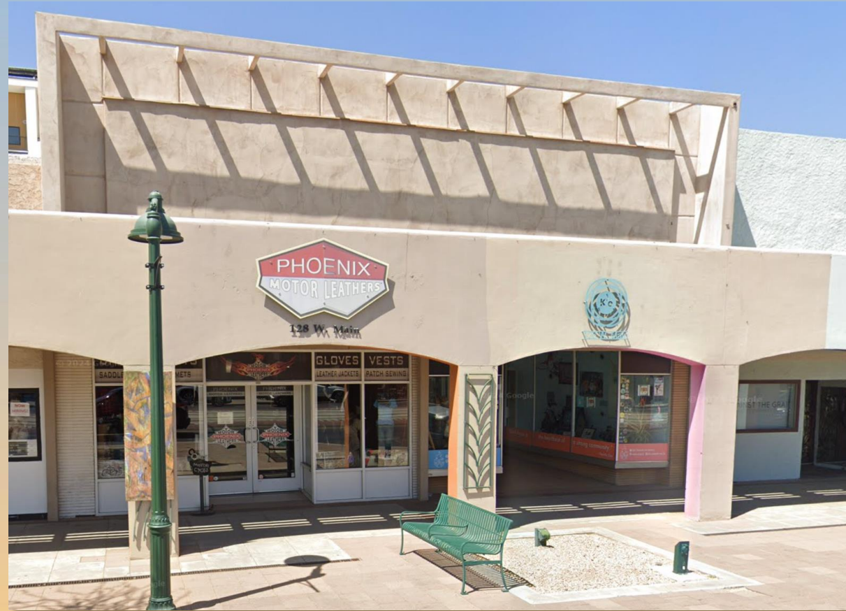
Looking north from Main Street