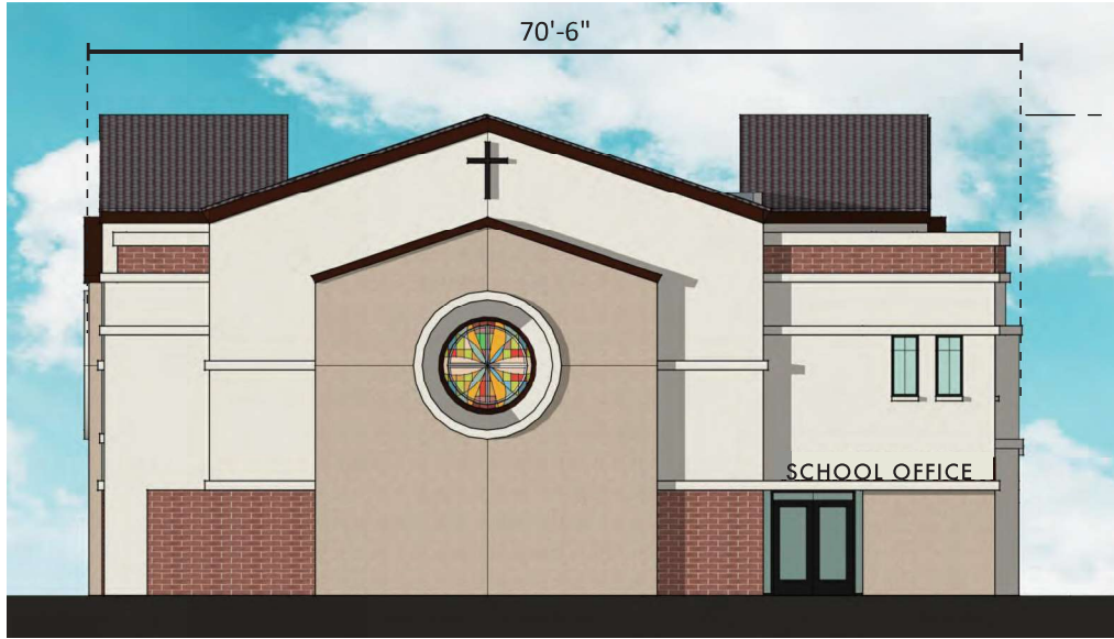
NORTH ELEVATION scale: 1/16" = 1'-0"