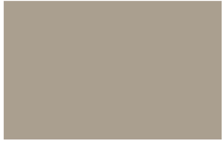
EIFS MANUFACTURER: DRYVIT COLOR: 106 | PEARL ASH TEXTURE: SANDBLAST NXT LRV: 35