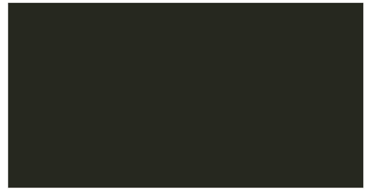
STOREFRONT WINDOW FRAME MANUFACTURER: OLDCASTLE COLOR: BLACK 378X500 MATERIAL: ALUMINUM