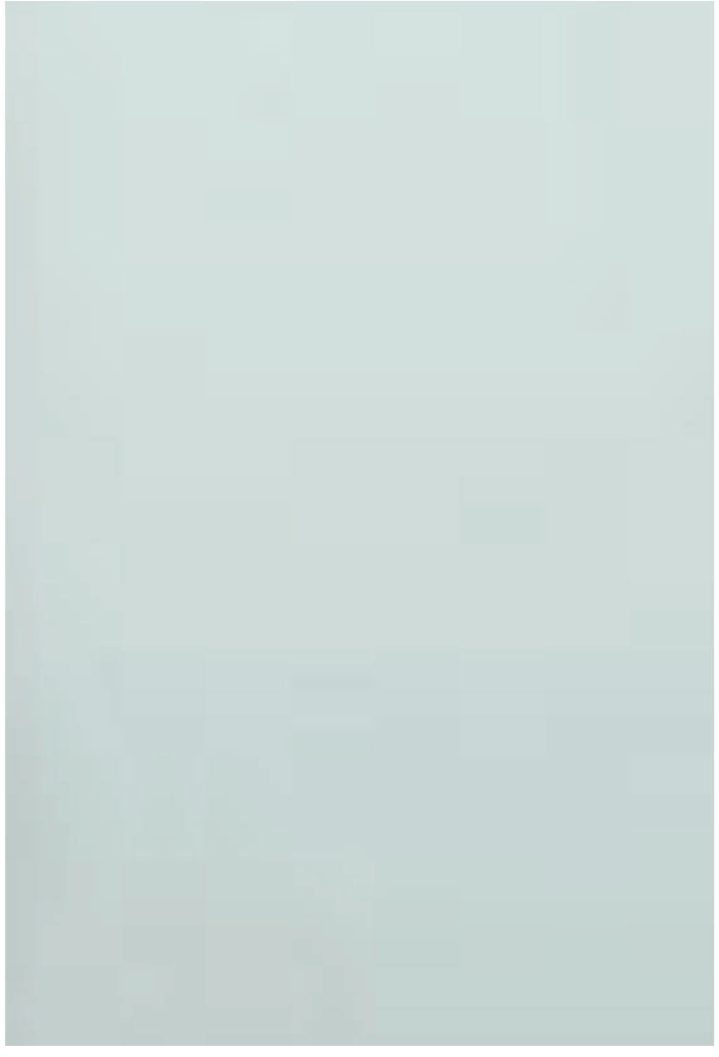
STOREFRONT WINDOW MANUFACTURER: VITRO ARCHITECTURAL GLASS COLOR: SOLARBAN 60 (2) SOLARGREY + CLEAR GLASS INSULATING GLASS UNIT