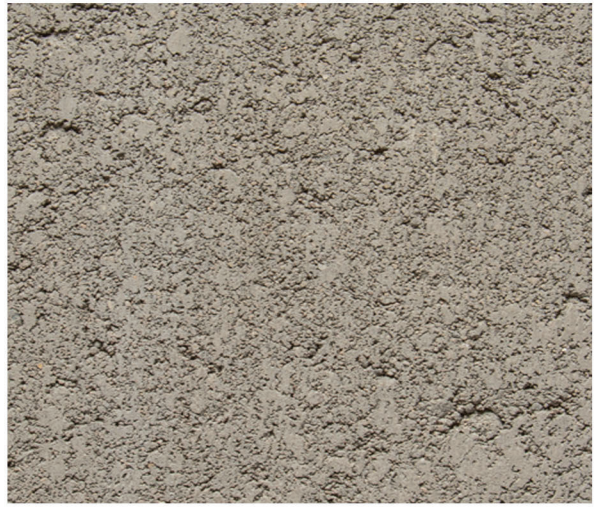
CMU MASONRY MANUFACTURER: ECHELON CMU MASONRY COLOR: IRONWOOD TEXTURE: SMOOTH FACE