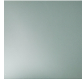
INSULATED GLASS UNIT VITRO SOLARBAN 70 (2) CLEAR GLASS