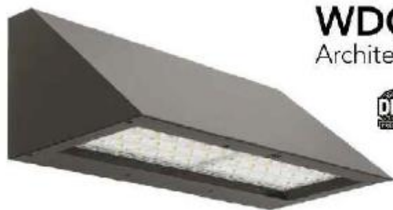
WDGE4 LED Architectural Wall Sconce