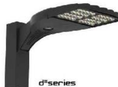
D-Series Size 0 LED Area Luminaire