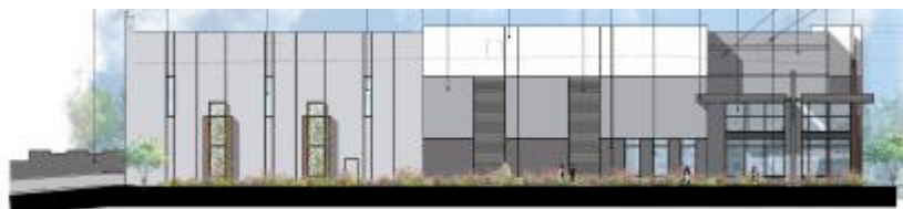
2 EAST ELEVATION Scale: 1" = 20'