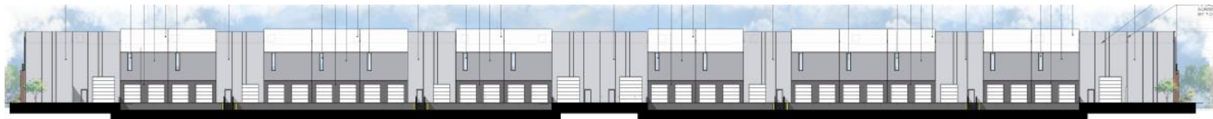
4 SOUTH ELEVATION Scale: 1" = 20'