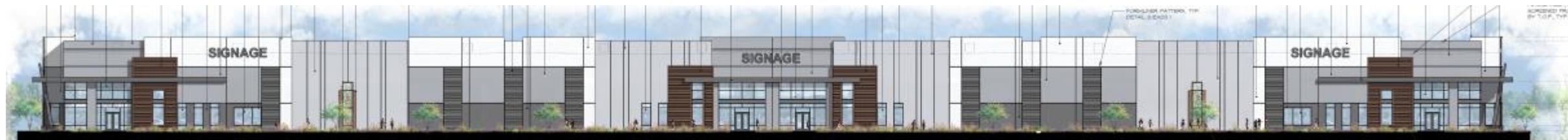
1 NORTH ELEVATION Scale: 1" = 20'