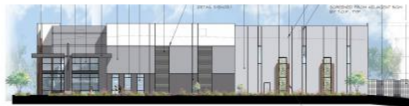
3 WEST ELEVATION Scale: 1" = 20'