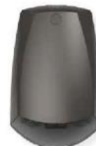
with photocell (dark bronze)