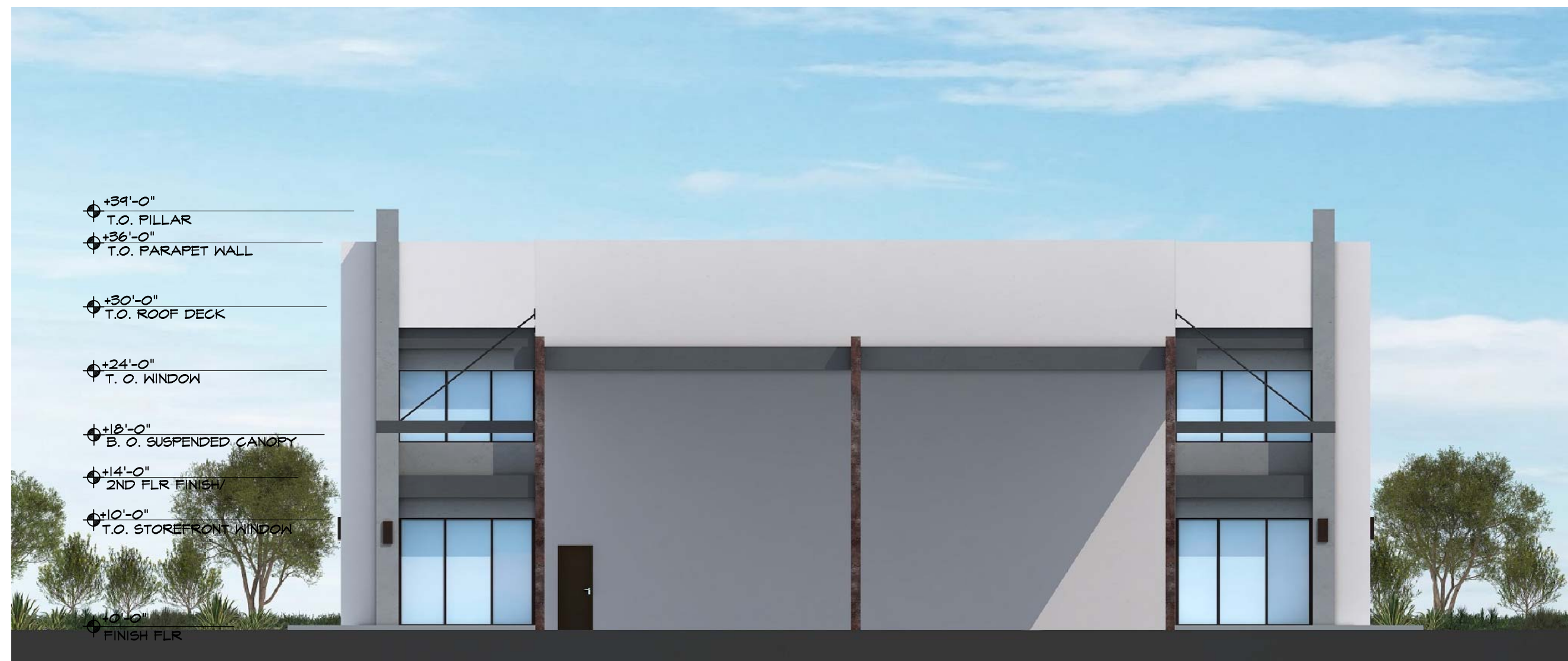
EAST SIDE ELEVATION