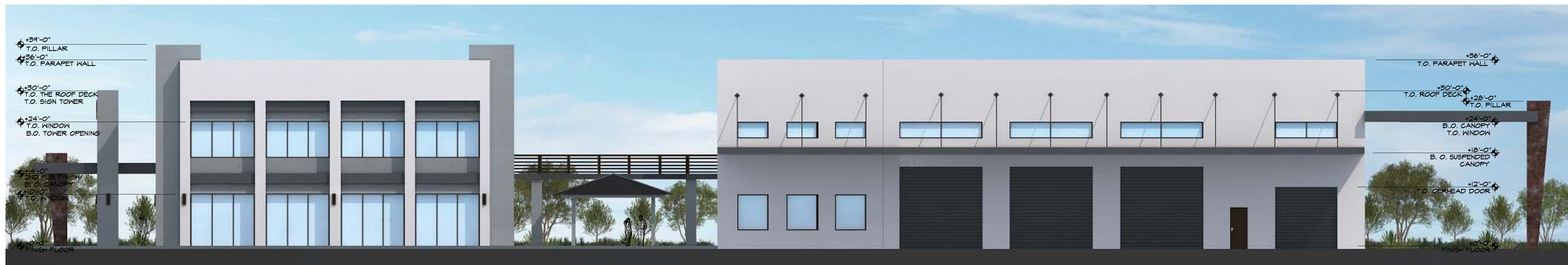
SOUTH SIDE ELEVATIONS