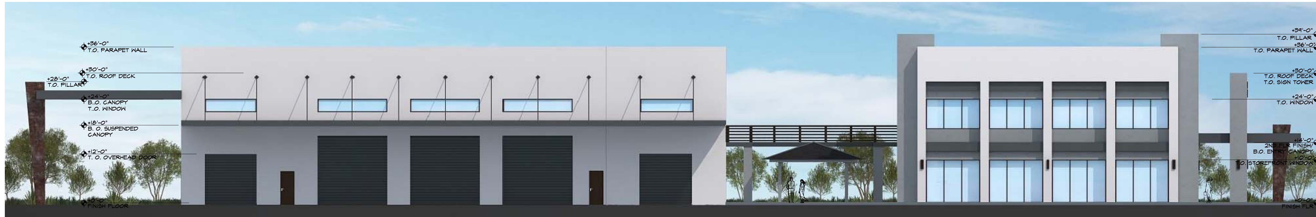
NORTH SIDE ELEVATIONS