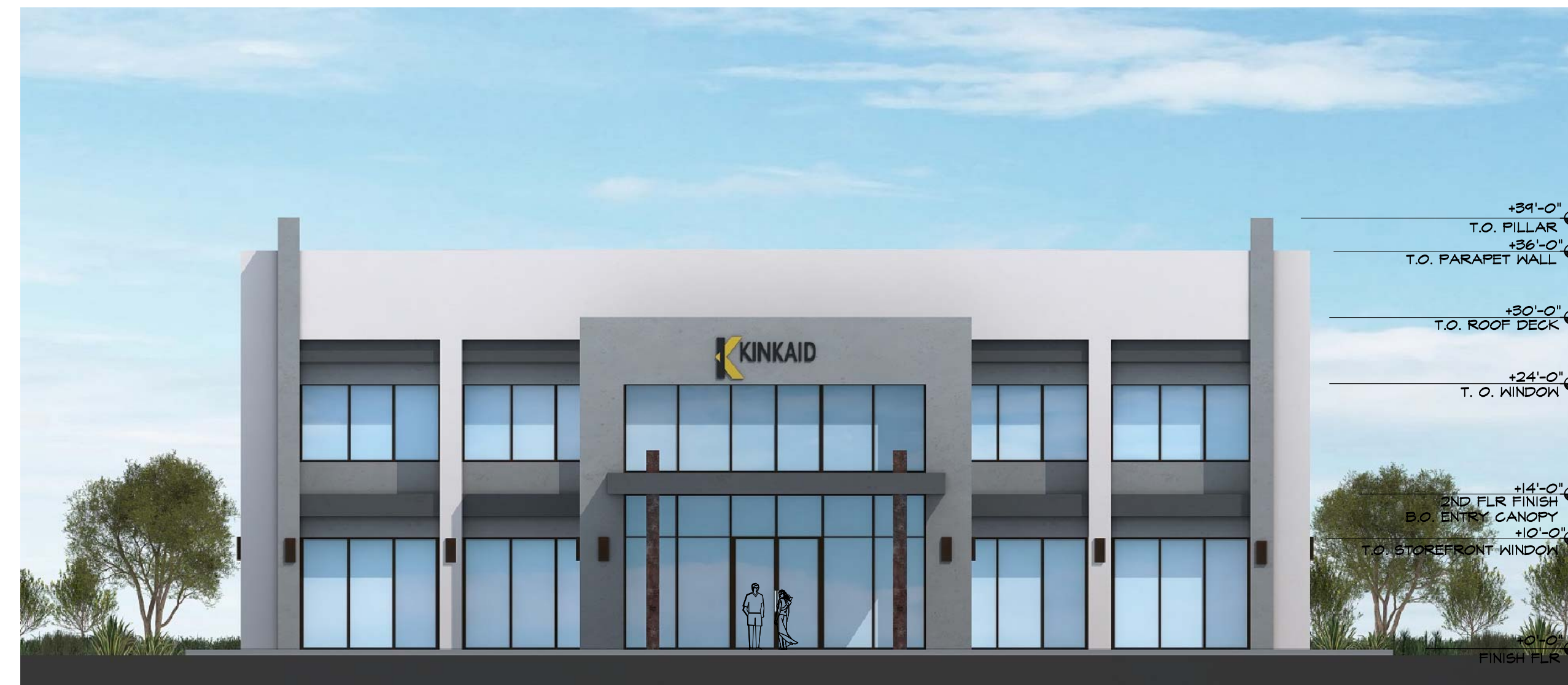
WEST SIDE ELEVATION