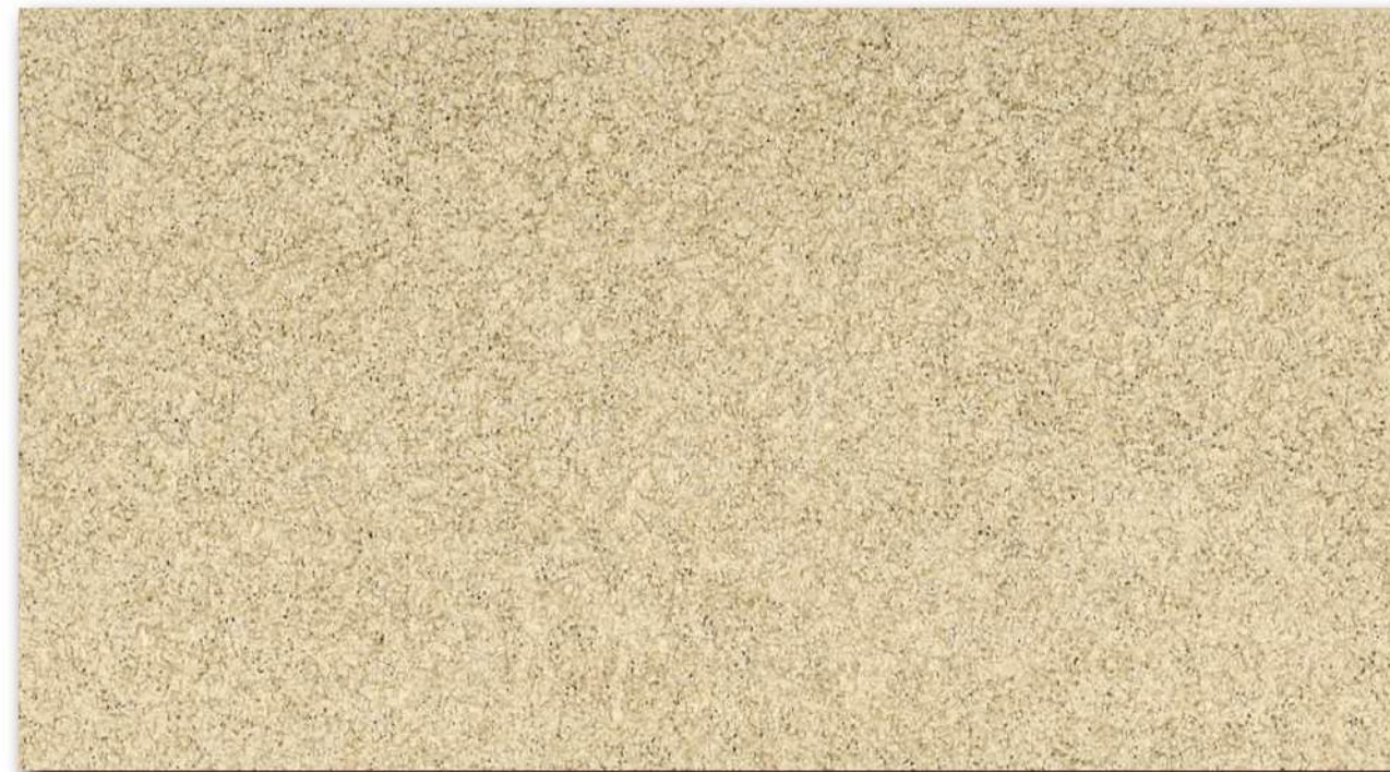
DRYVIT EIFS Synthetic Stucco - Sandblast Texture Marked Finish C