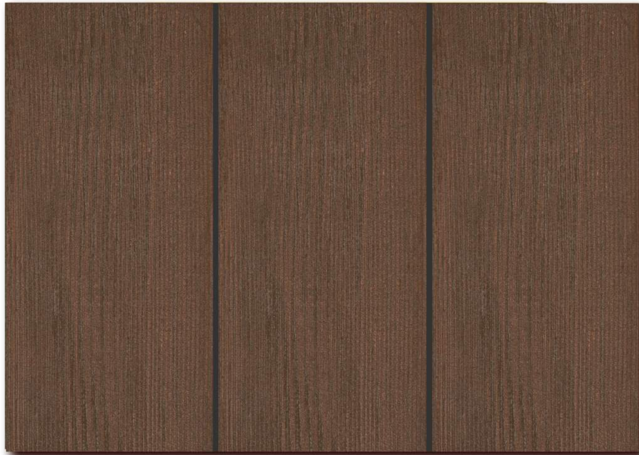
Pre-Engineered Vertical T&G Wood Planks and Trim Marked Finishes B