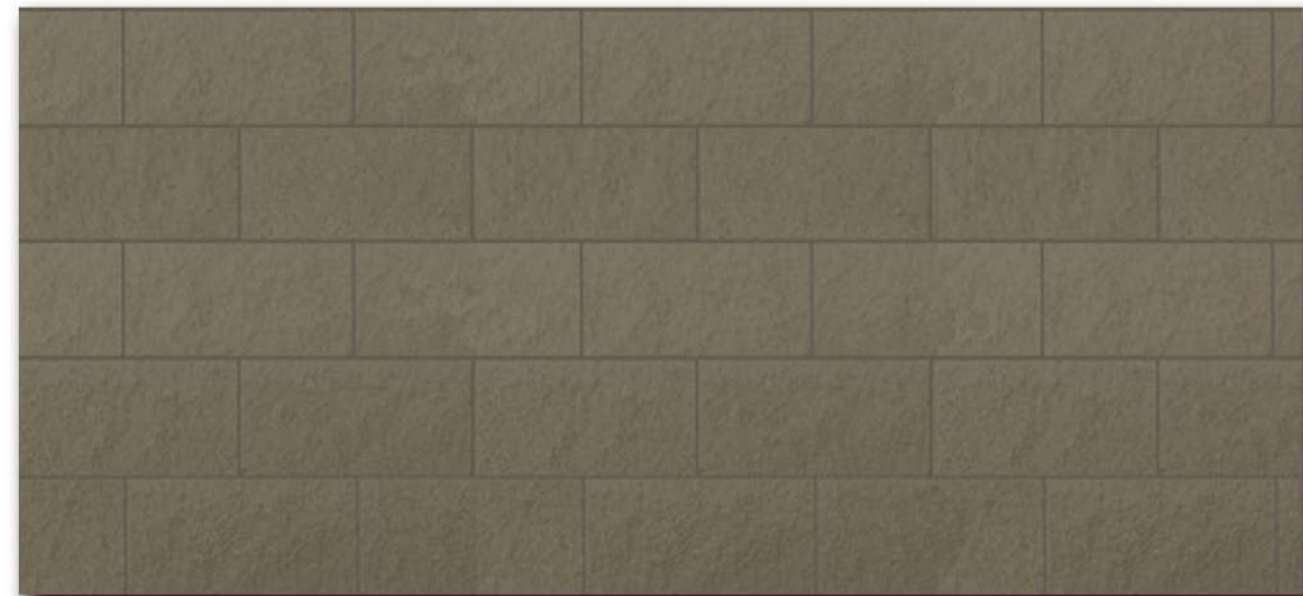
Split Face CMU - Series Echelon Marked Finish J