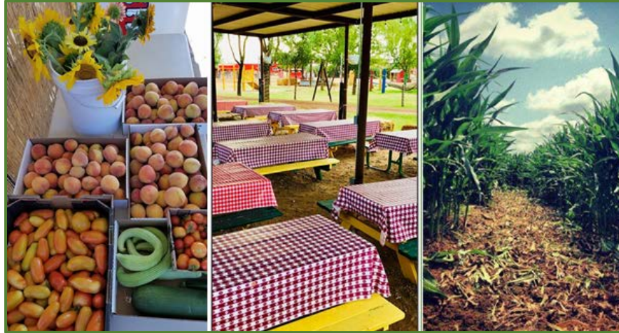
Figure 9 – Vertuccio Farms Context Photos

The operational details of the Vertuccio Farms are discussed below: