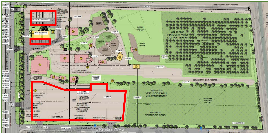
Figure 6 – Parking Areas