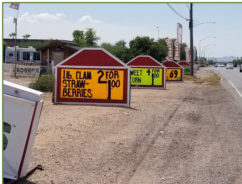
Figure 7 - Signage

Signage on site will comply with City of Mesa standards. According to MCDOT, Power Road at this section is maintained by Maricopa County and the City of Mesa limit begins 55 feet east of the Power Road section line. It is anticipated that some manner of signage will be provided to advertise the various prices of the produce for sale at the indoor Farmer's Market. These signs would be similar to those found at most farm stands in rural areas, an example being illustrated in Figure 7 below. City of Mesa sign approvals will be sought at a later date.