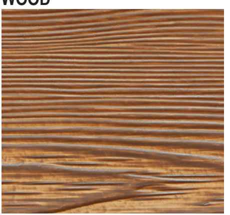
WOODTONE - RUSTIC SERIES SUMMER WHEAT