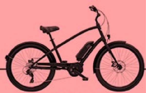
E - CRUISER