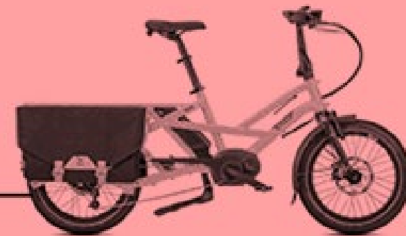
E - CARGO