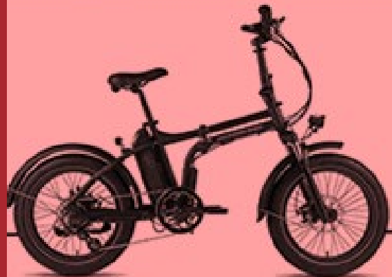
E - FOLDING