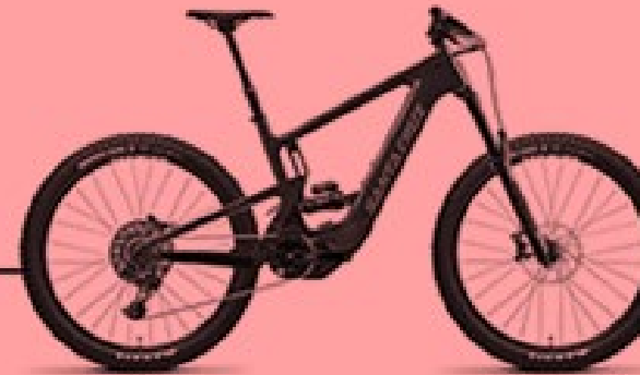
E - MOUNTAIN