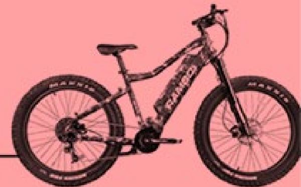
E - HUNTING