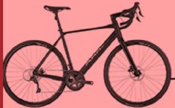
E - ROAD