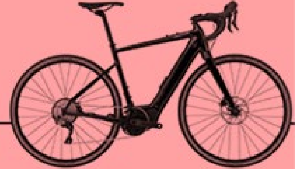
E - GRAVEL