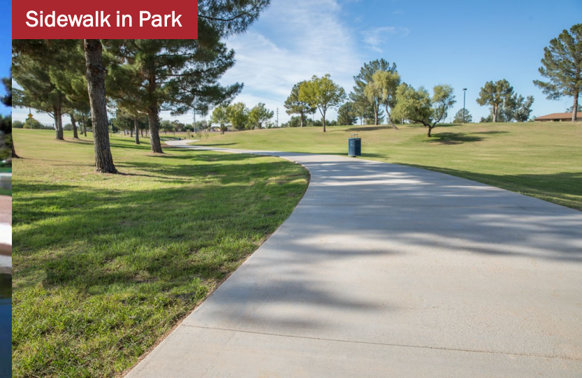
Sidewalk in Park