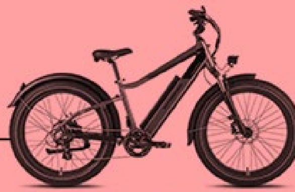
E - FAT