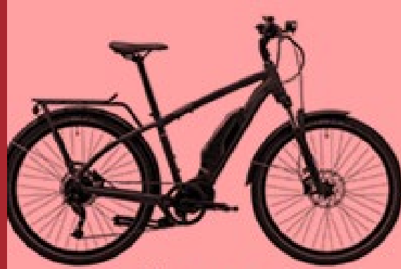
E - HYBRID