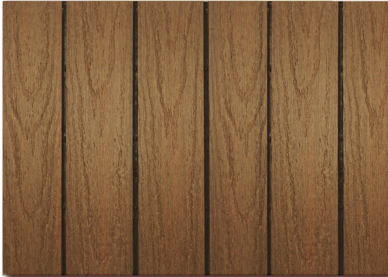
Pre-Engineered Vertical T&G Wood Planks and Trim Marked Finishes B