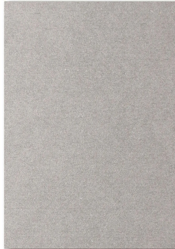
Concrete Look Panels Marked Finishes A