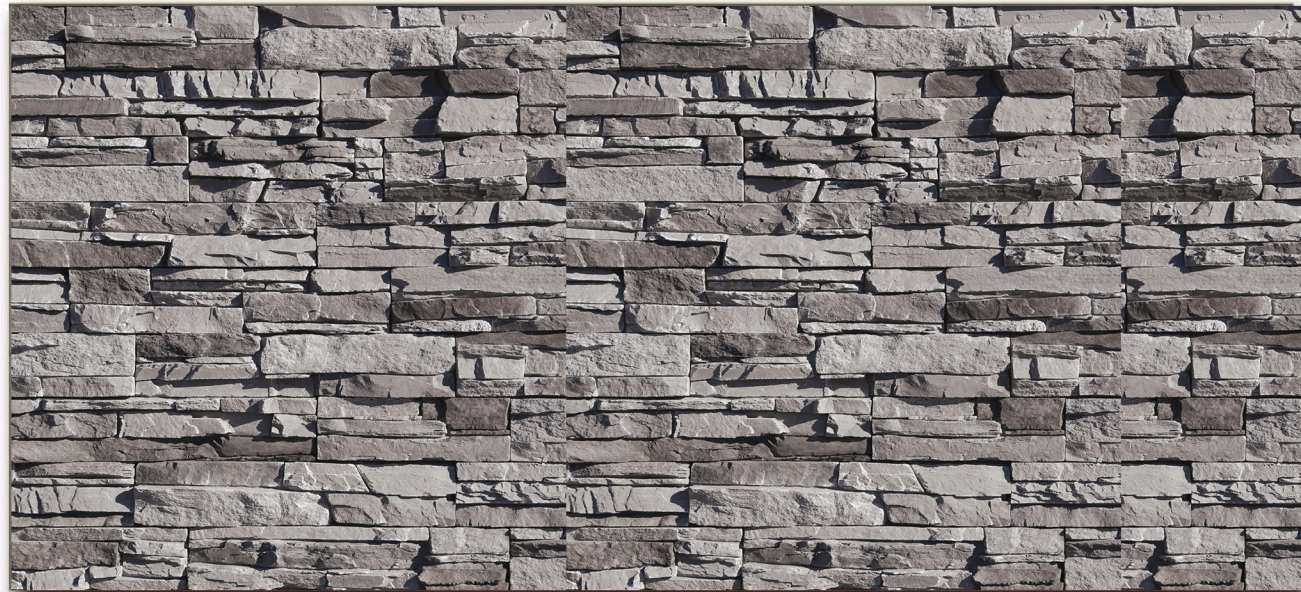
Stone Veneer-El Dorado Stone/Silver Lining Marked Finishes G