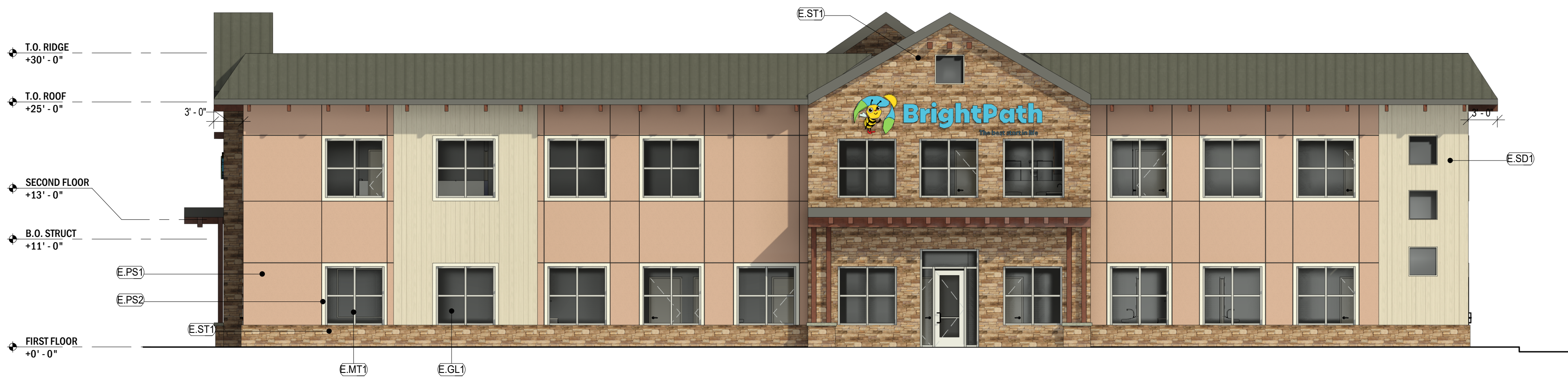
1 FRONT (SOUTH) ELEVATION 1/8" = 1'-0"