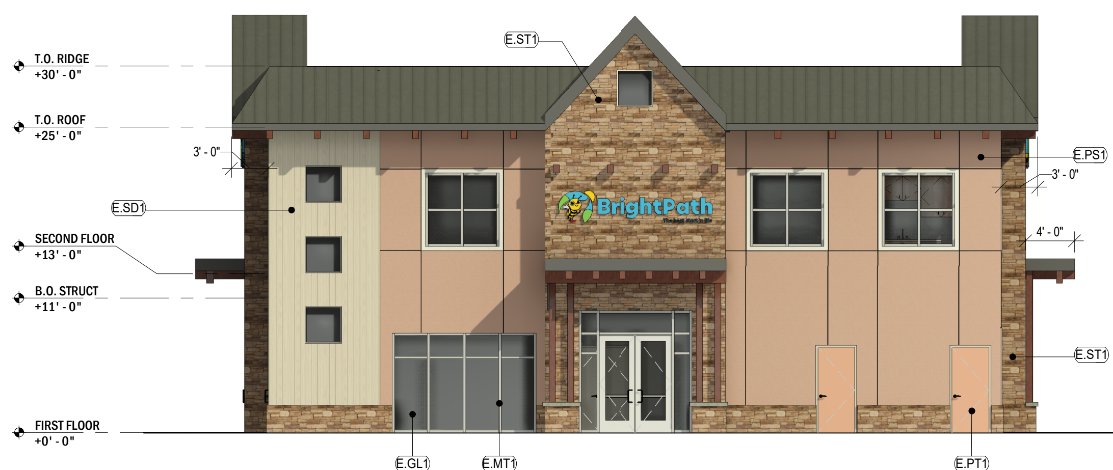
2 SIDE (WEST) ELEVATION 1/8" = 1'-0"