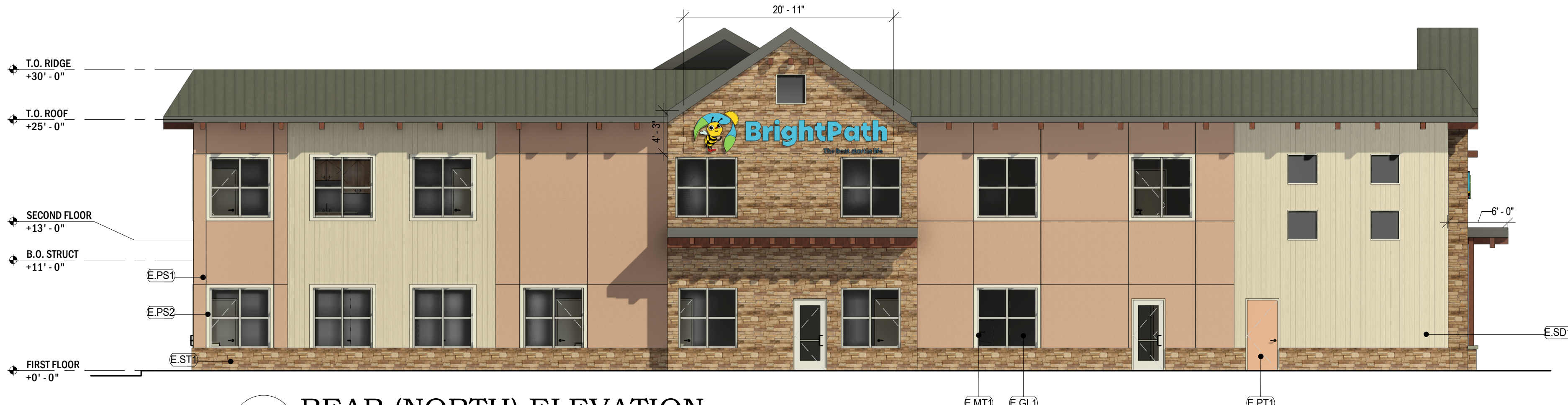
4 REAR (NORTH) ELEVATION 1/8" = 1'-0"