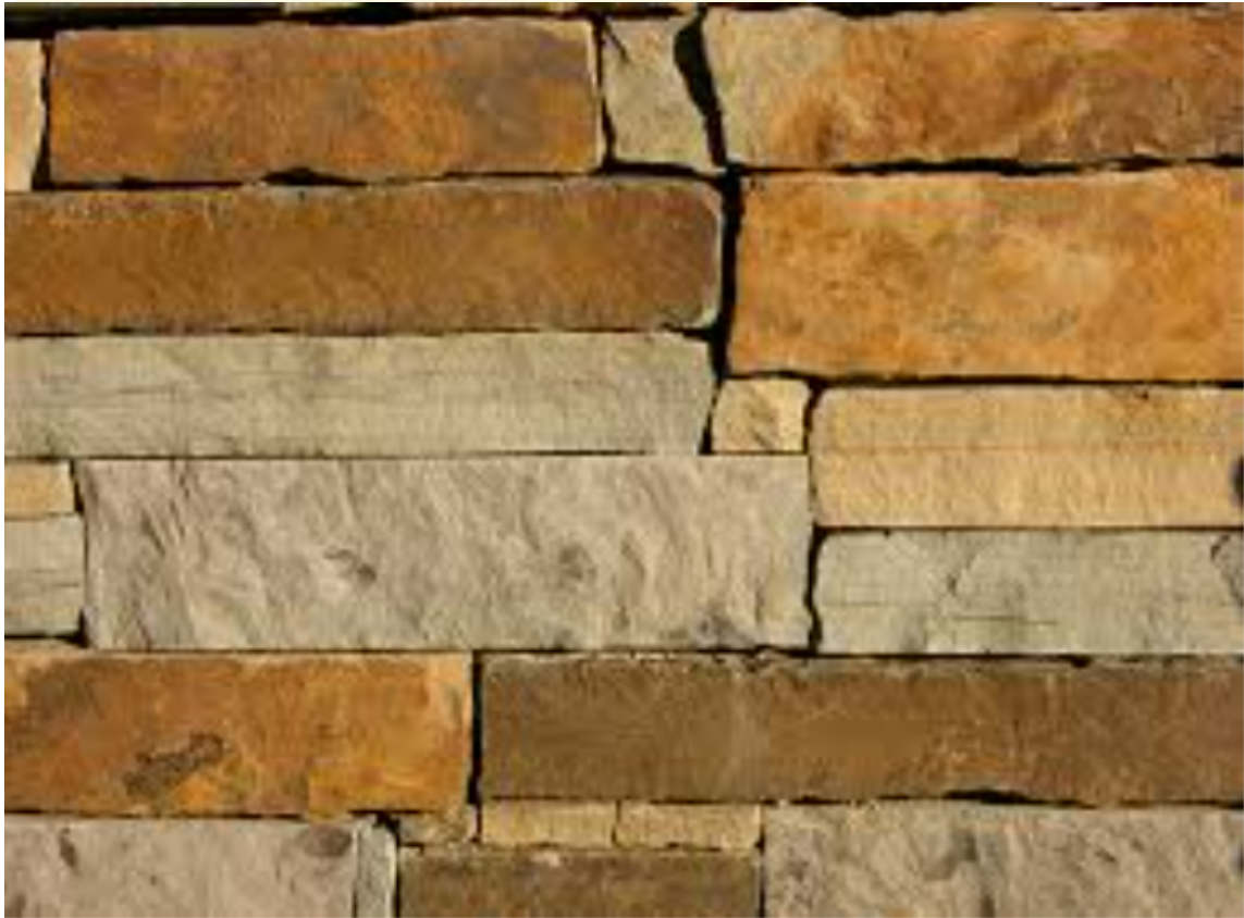
COUNTRY LEDGESTONE, COLOR: SEVILLA, AS MANUFACTURED BY CULTURED STONE

STUCCO COLORS ARE BASED ON THE STOCOLOR SOUTHWEST COLLECTION BY STO CORP.