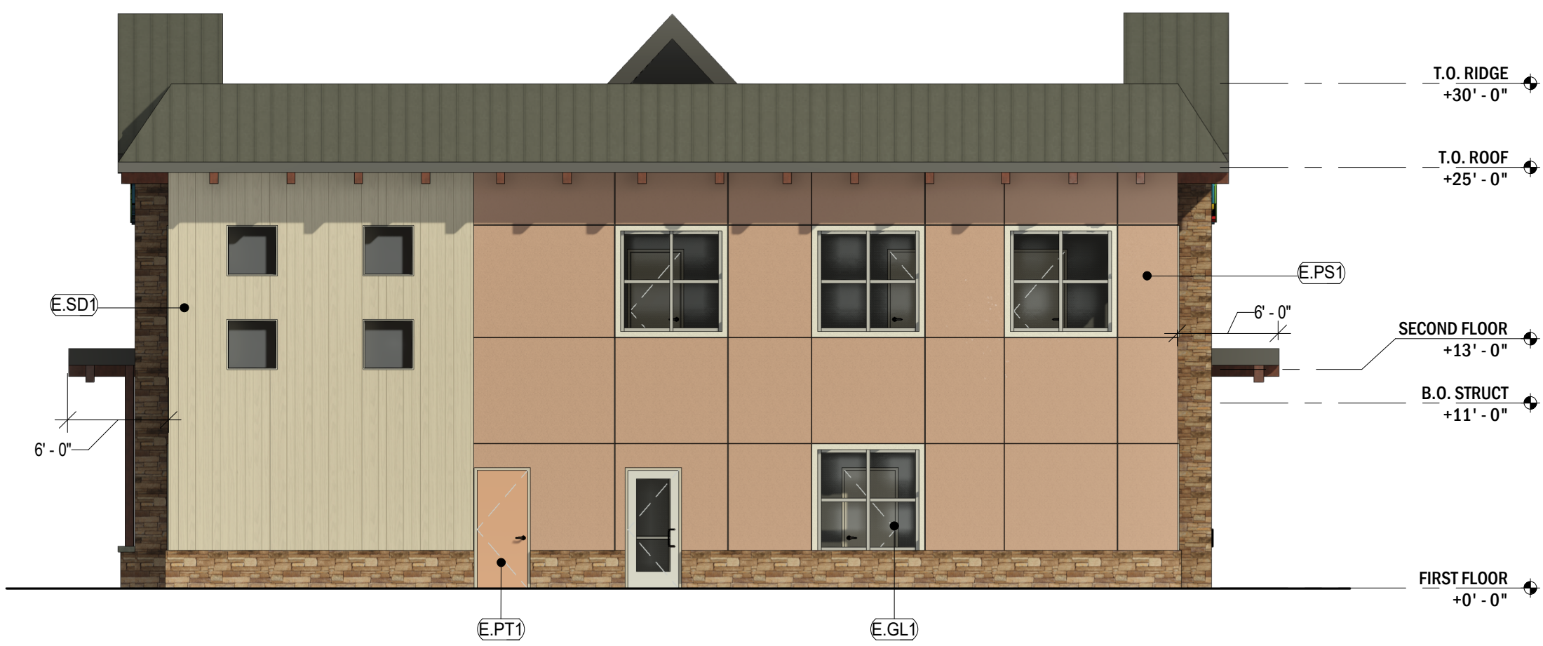
3 SIDE (EAST) ELEVATION 1/8" = 1'-0"