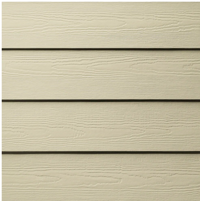
JAMES HARDIE CEDARMILL FIBER CEMENT LAP SIDING- NAVAJO BEIGE