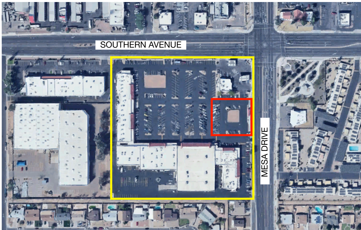
Figure 1 - Site Aerial

Figure 1 below shows the Property outlined in yellow & PAD A outlined in red.