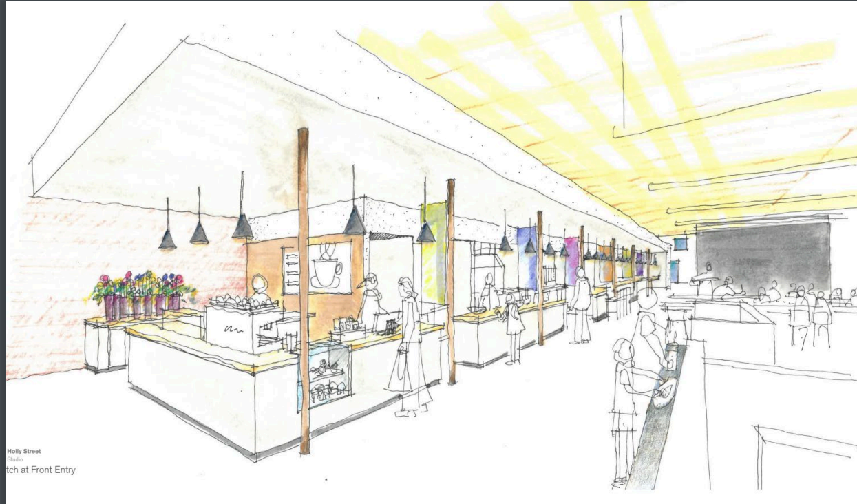
Holly Street Studio Sketch at Front Entry