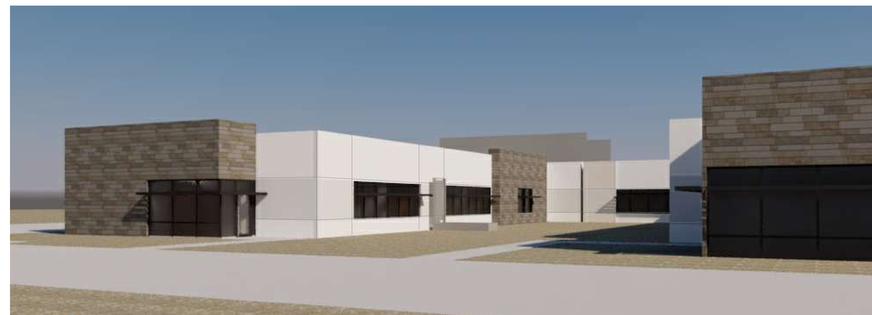
THREE-DIMENSIONAL COLORED RENDERING - SOUTH PERSPECTIVE