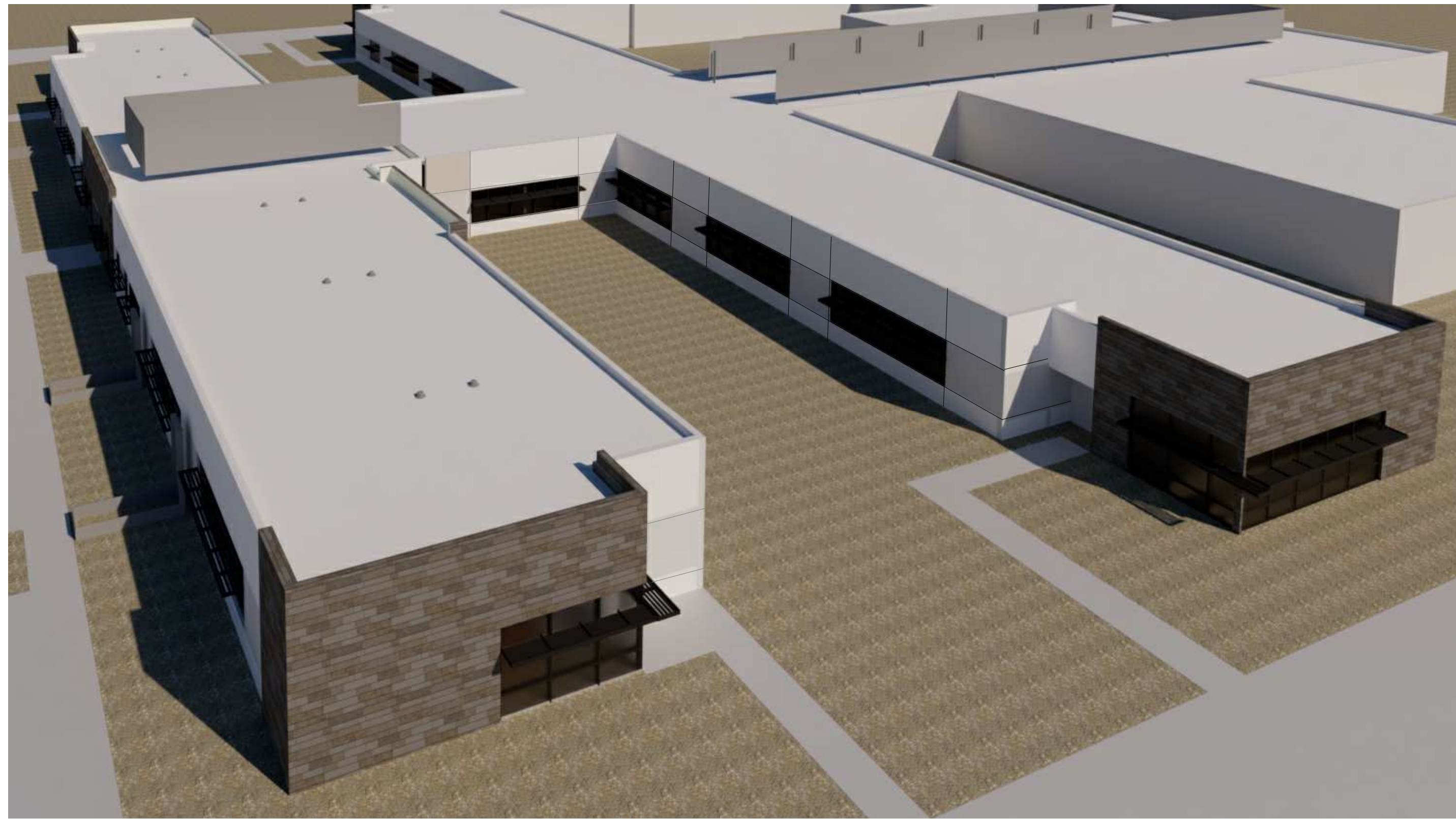
THREE-DIMENSIONAL COLORED RENDERING - SOUTH AERIAL PERSPECTIVE