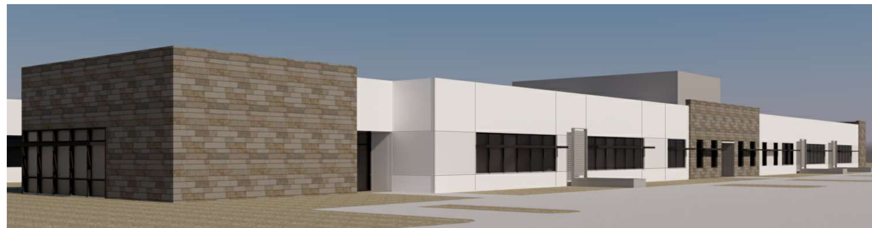
THREE-DIMENSIONAL COLORED RENDERING - NORTHWEST PERSPECTIVE