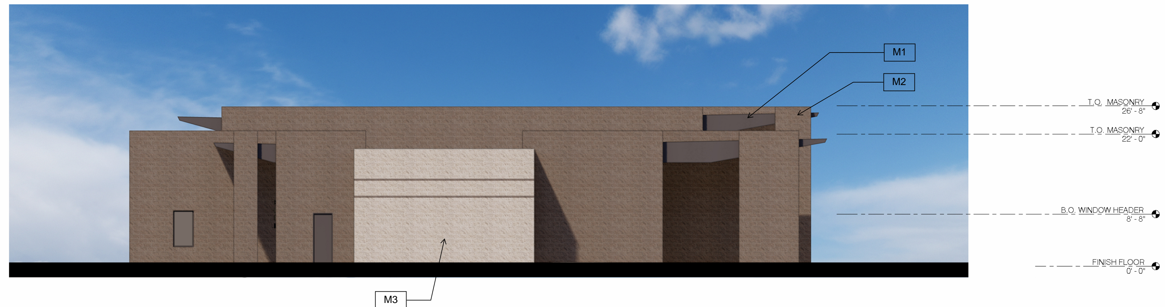
2 EXTERIOR ELEVATION - EAST 1" = 10'-0"