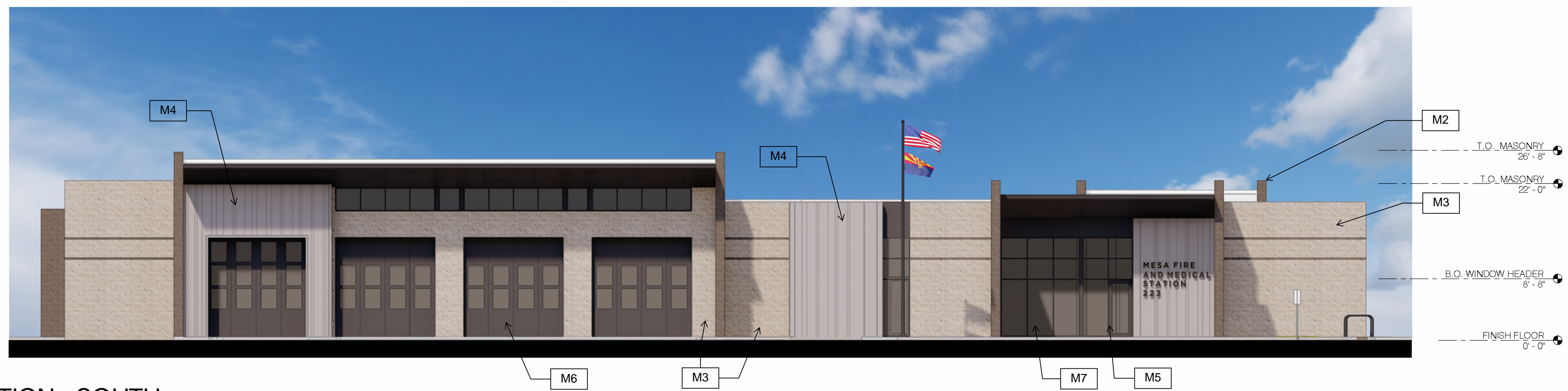
3 EXTERIOR ELEVATION - SOUTH 1" = 10'-0"