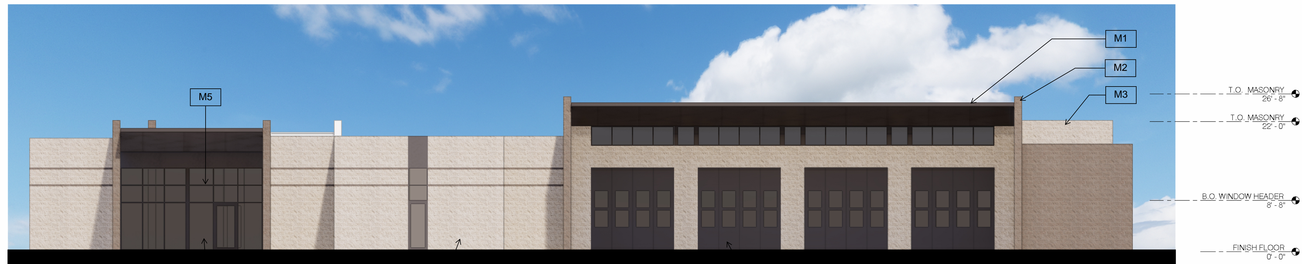
1 EXTERIOR ELEVATION - NORTH 1" = 10'-0"