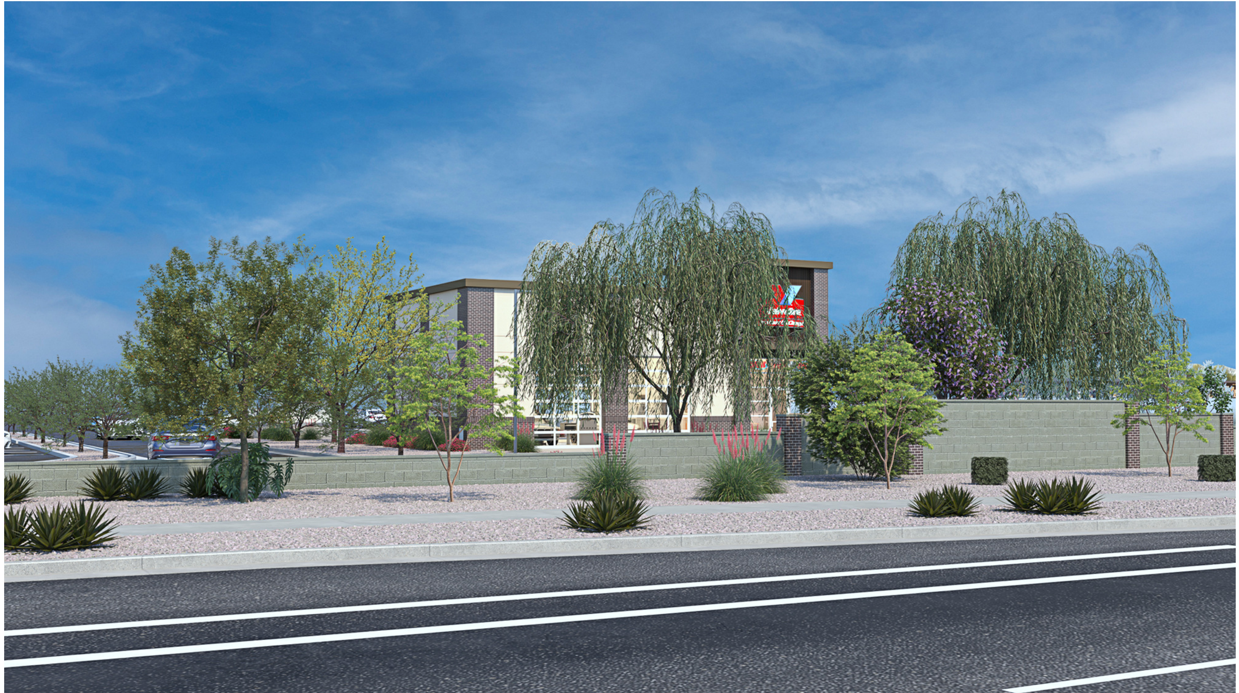
DAY STREET VIEW 2 - S SOSSAMAN ROAD

VALVOLINE INSTANT OIL CHANGE 1330 SOSSAMAN ROAD MESA, AZ 85209