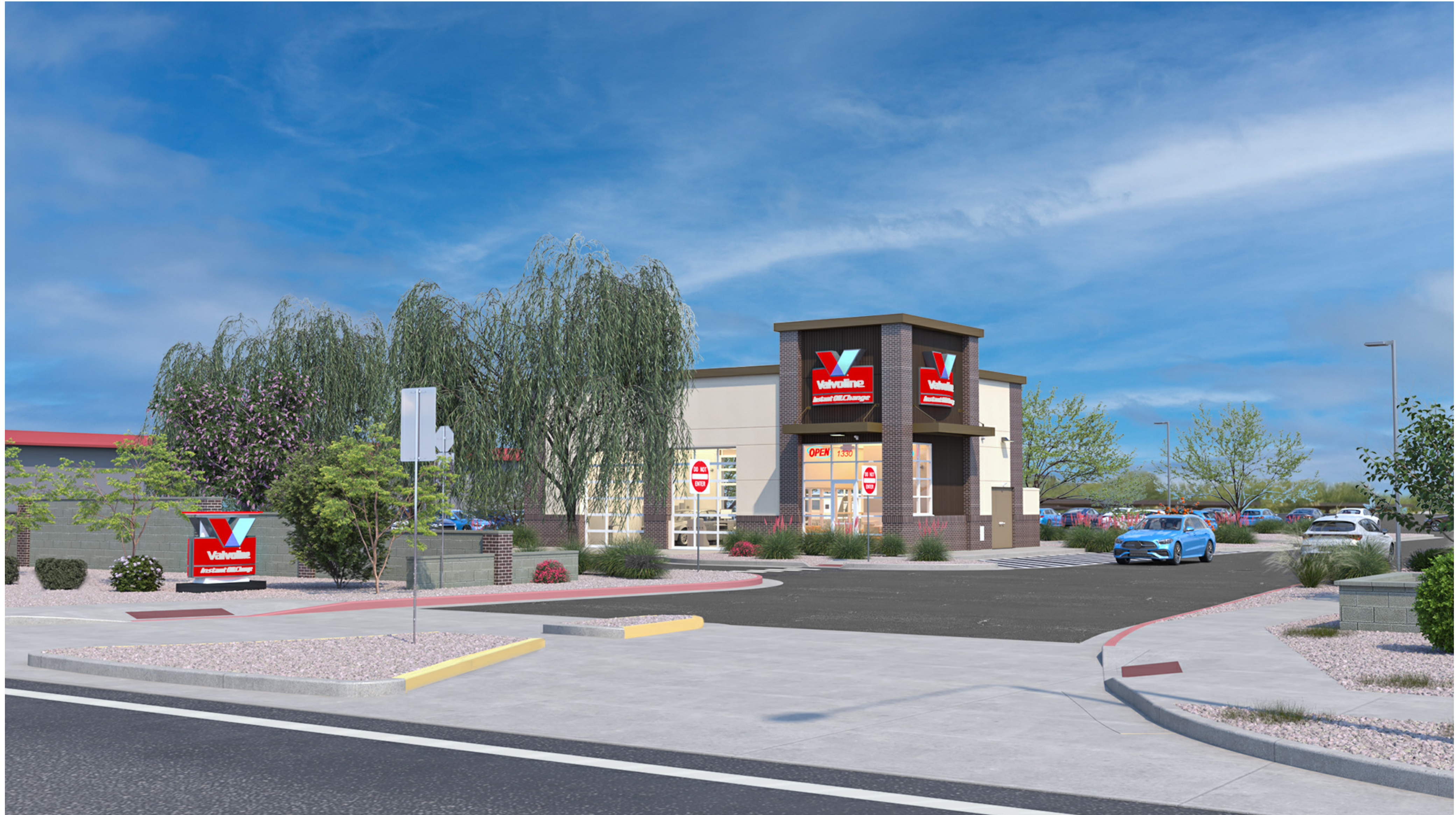
DAY STREET VIEW 1 - S SOSSAMAN ROAD

VALVOLINE INSTANT OIL CHANGE 1330 SOSSAMAN ROAD MESA, AZ 85209