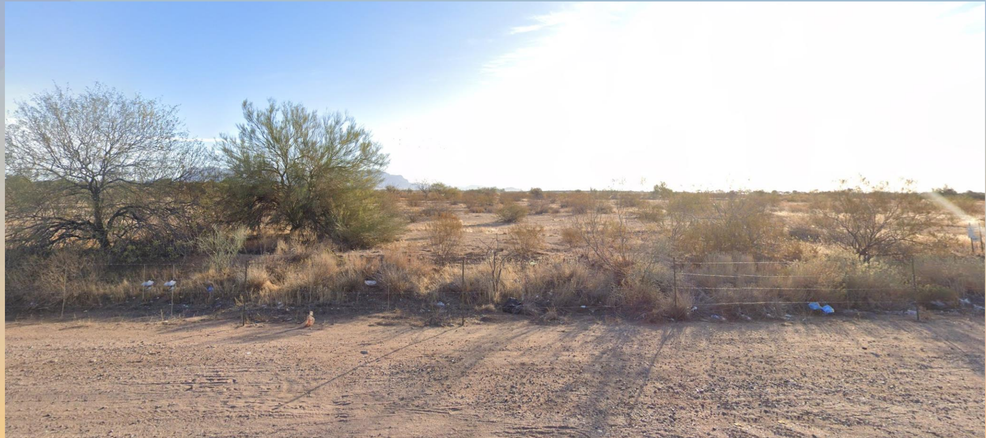
Looking east towards the site