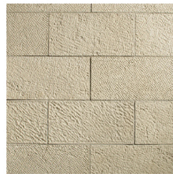
Kakwa stone biscuit-craft-chiseled-rectangle