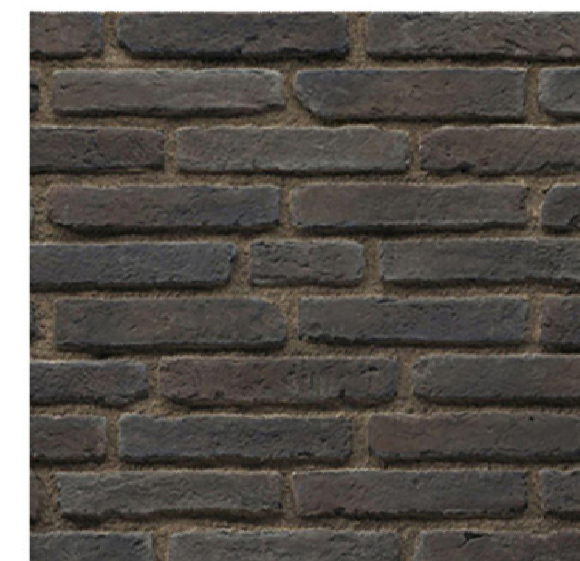
Ferrara Dark Grey Manufactured Stone Handmade Brick Veneer