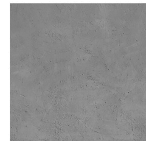
Dark Grey -Stucco