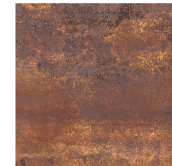
Corten Rusted Steel