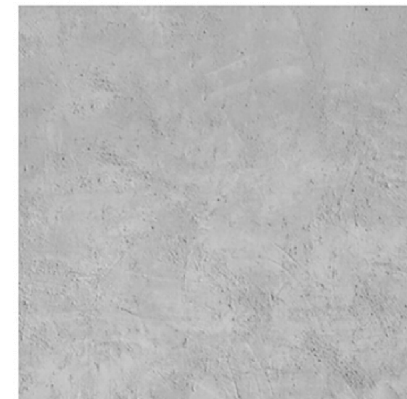
Light Grey -Stucco