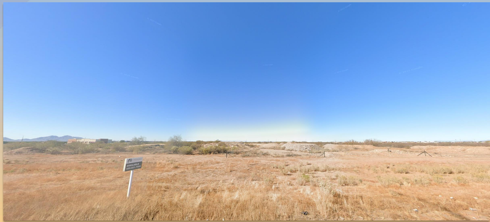
Looking west towards the western side of the site