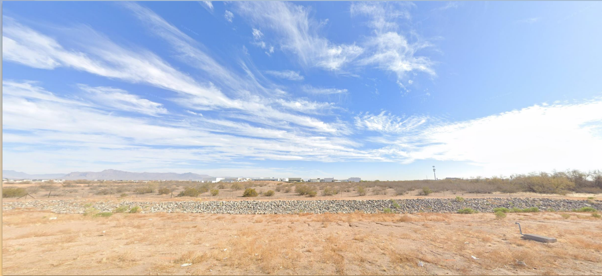
Looking east towards the eastern side of the site