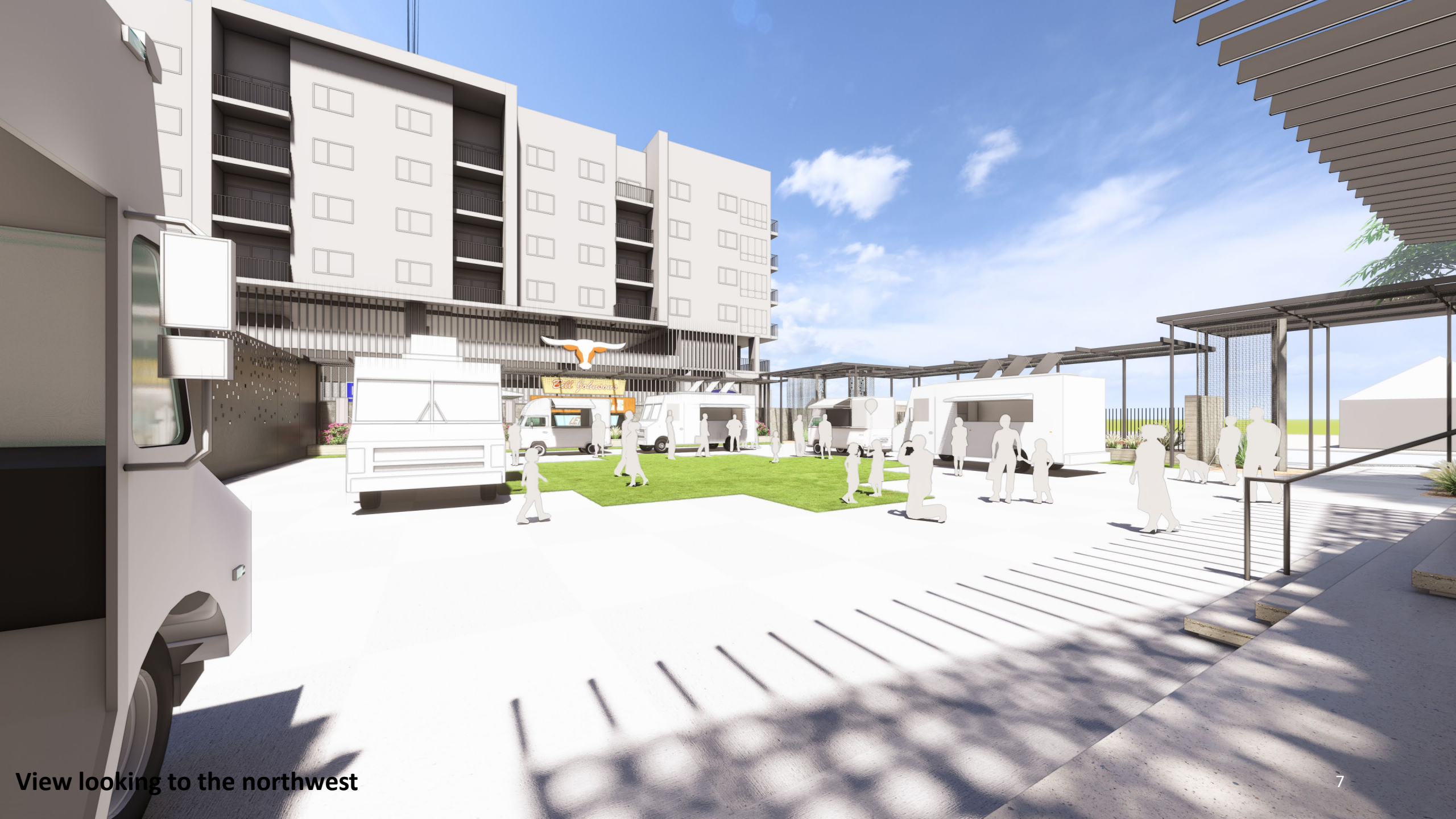
View looking to the northwest