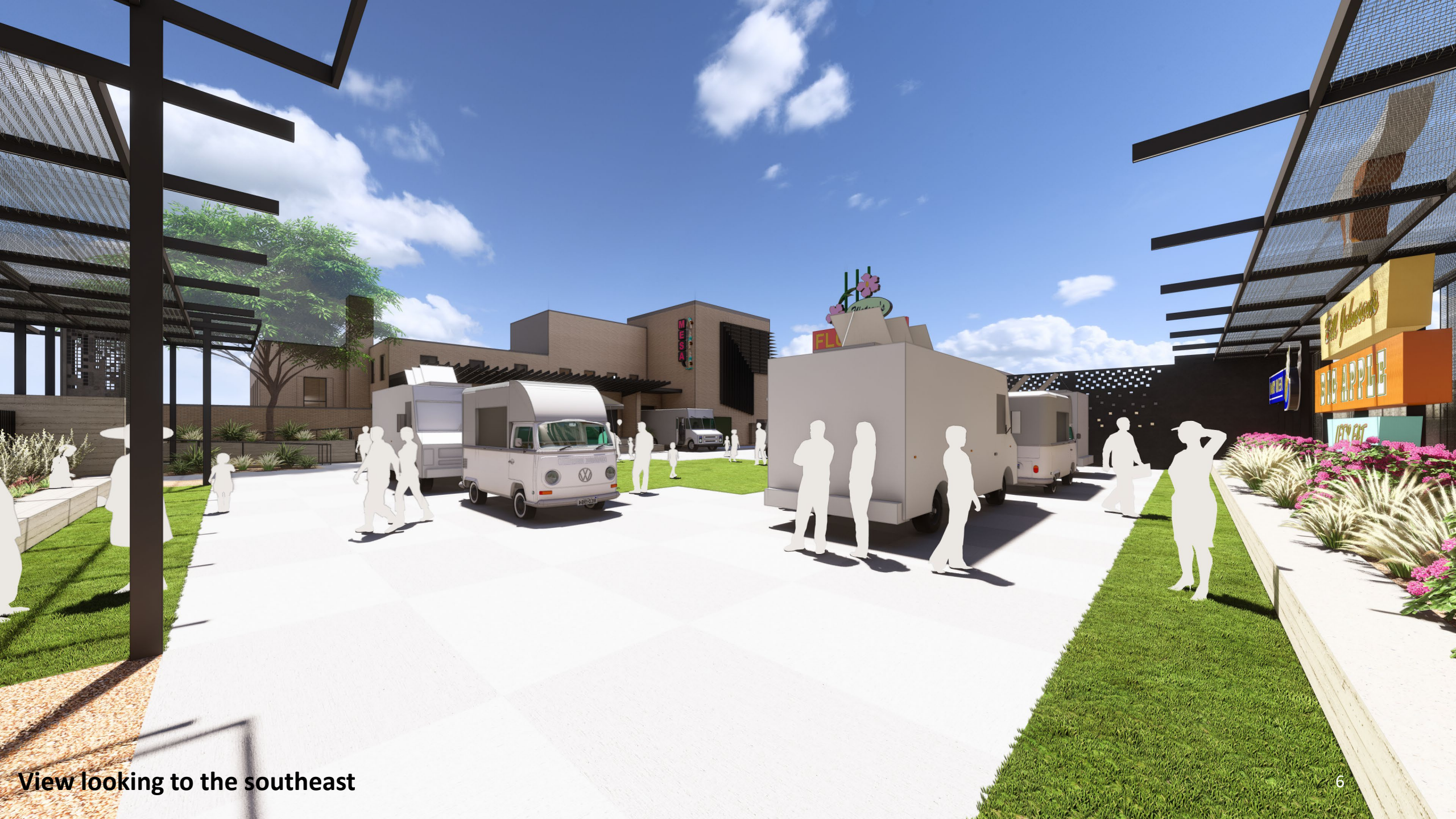
View looking to the southeast