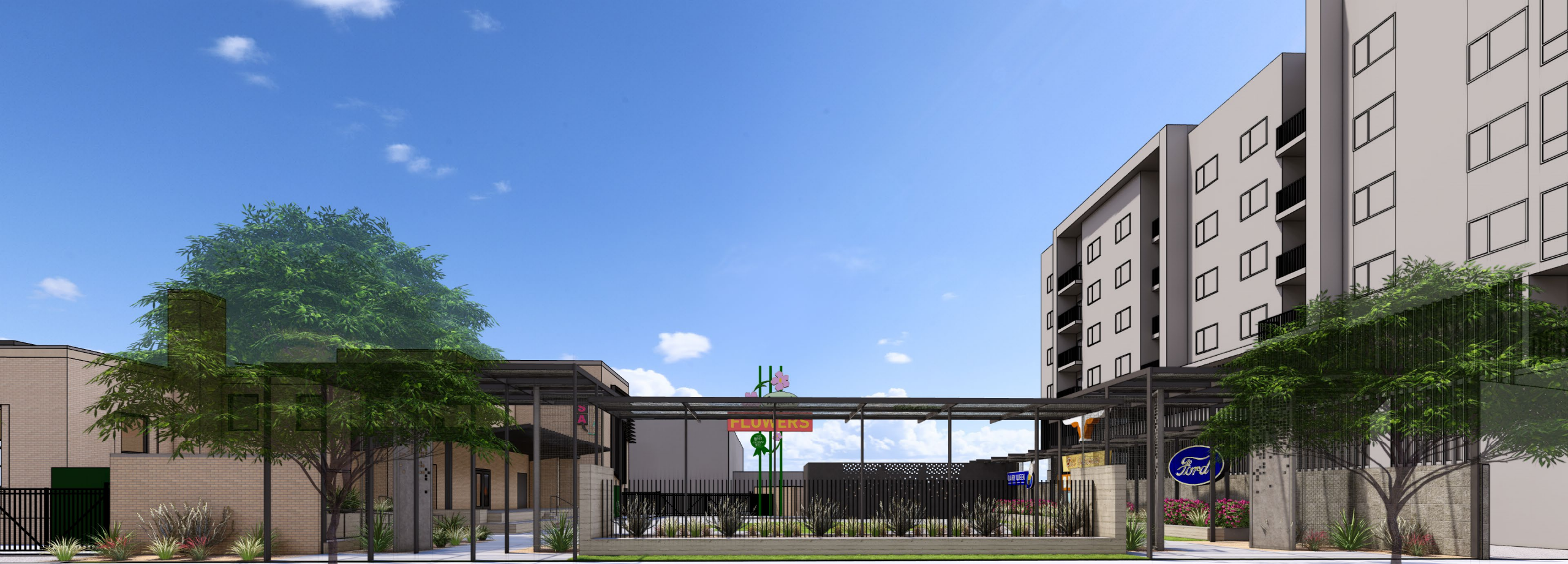
View from Pepper Place