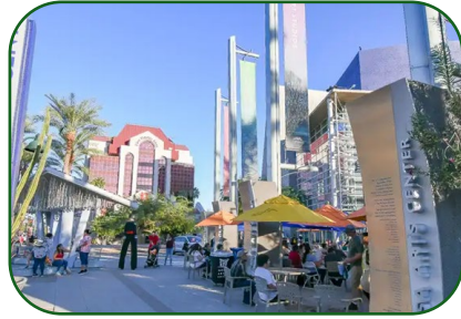
Arts & Culture