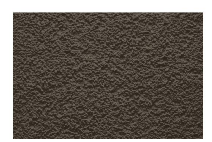
EIFS - Black Fox