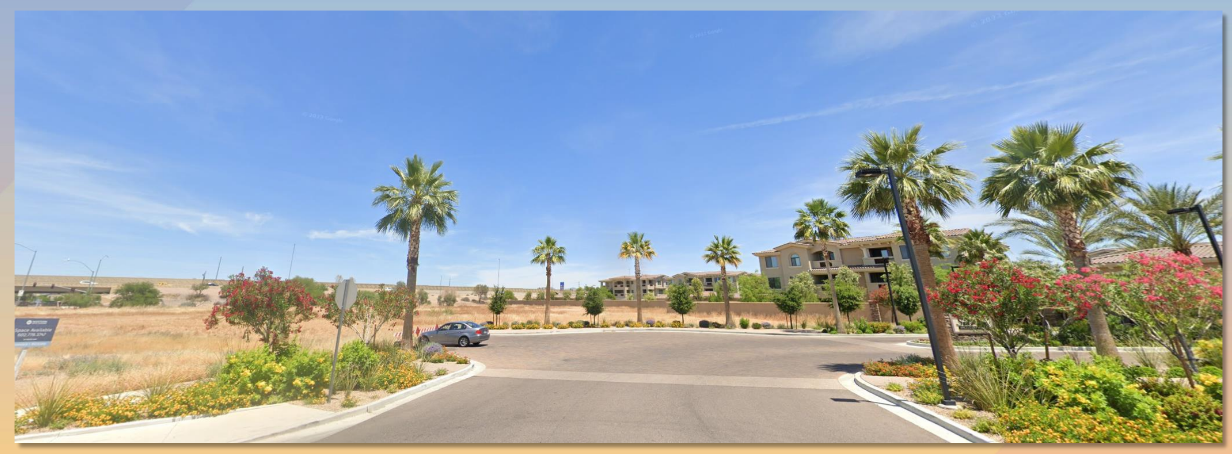
Looking north from Banner Gateway Drive