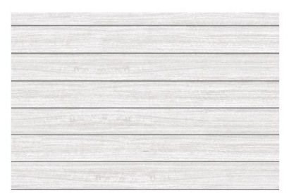
Wood Look Fiber Cement Siding - White