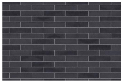
Brick - Dark Gray