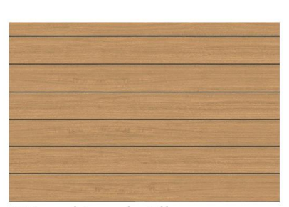
Wood Look Fiber Cement Siding