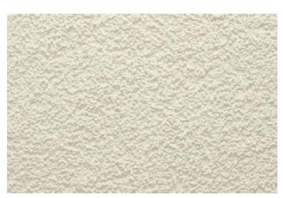
EIFS - Alabaster