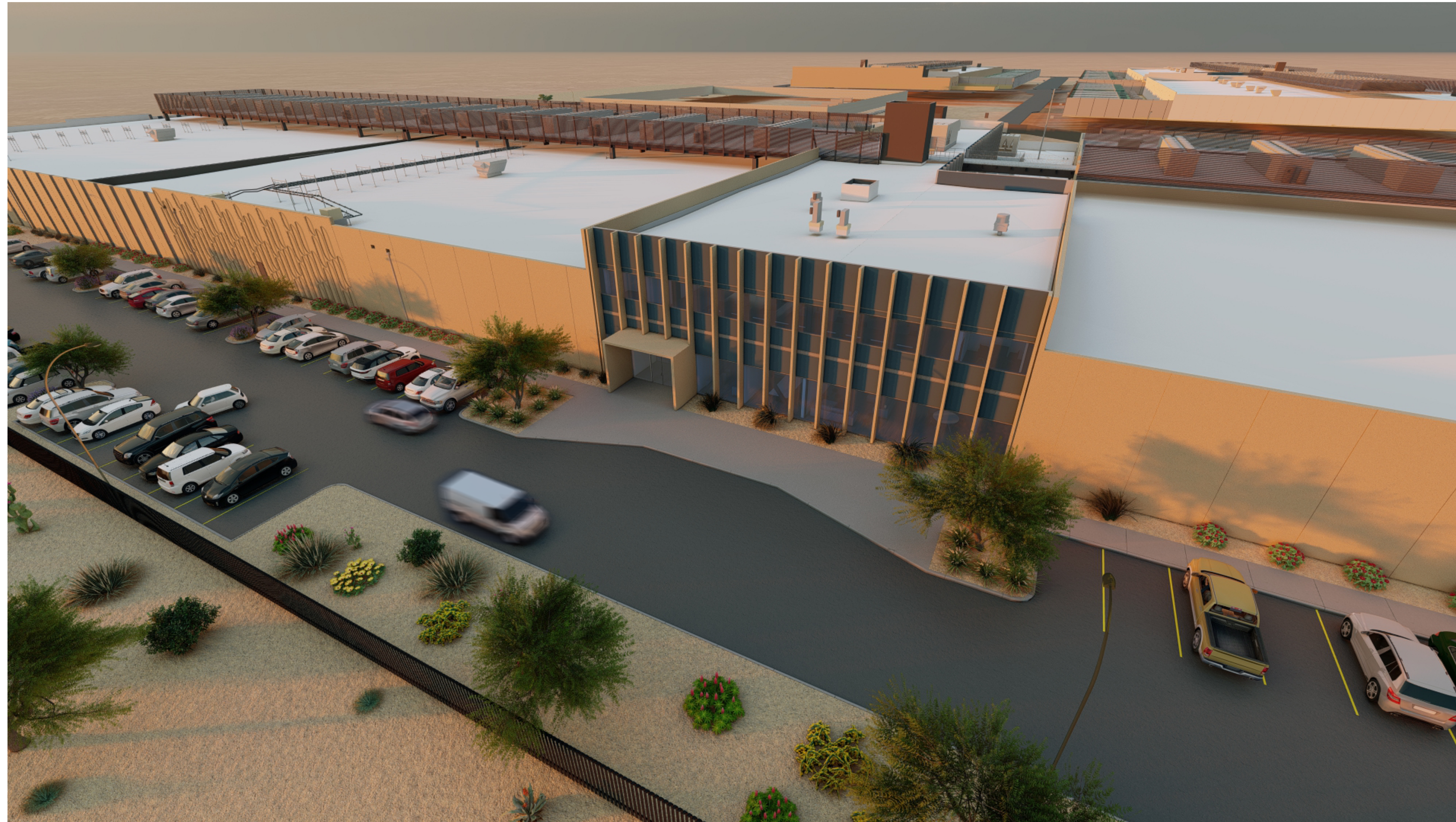
EXTERIOR RENDERING - AERIAL - MAIN ENTRY ON S. HAWES ROAD