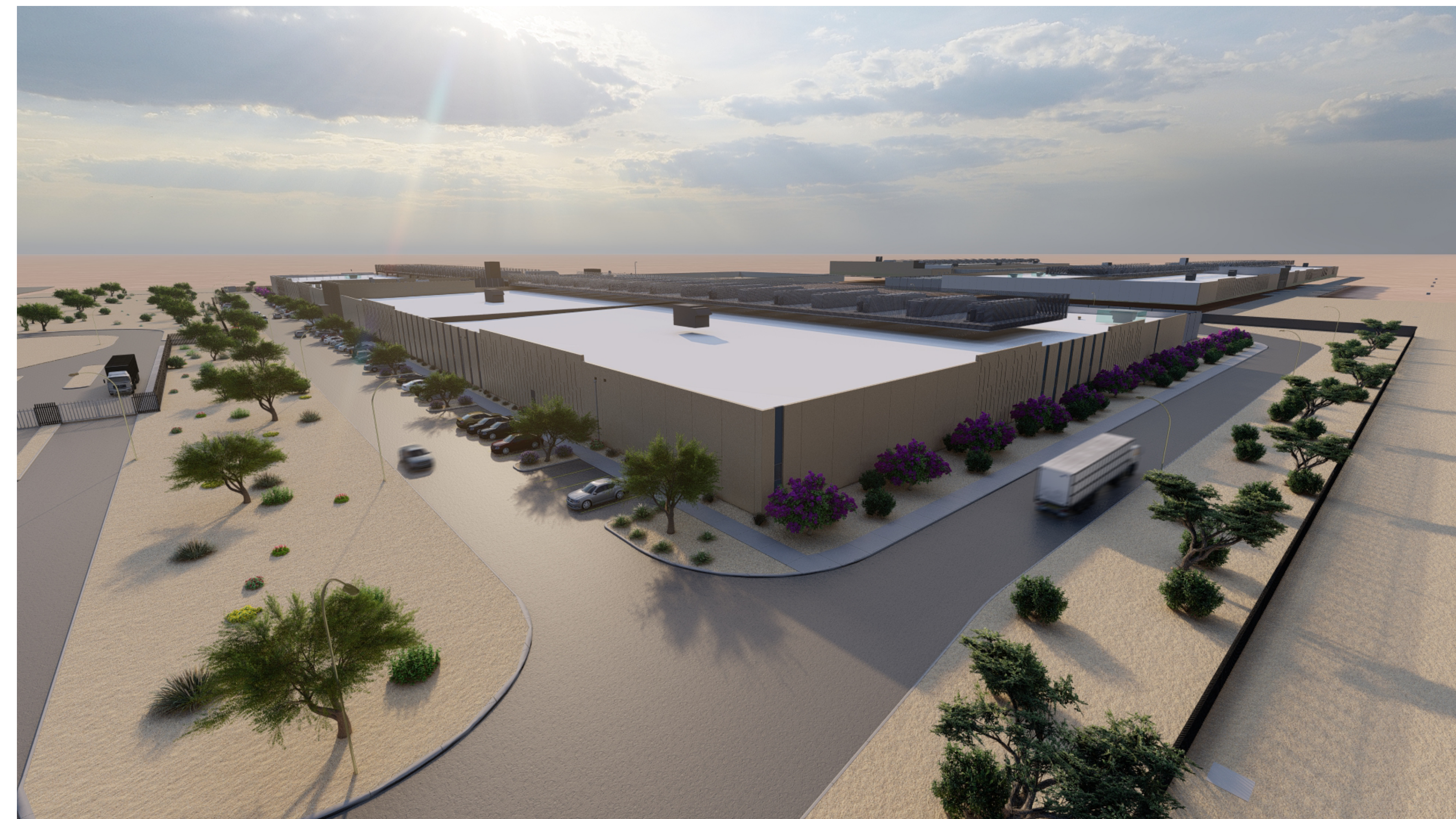
EXTERIOR RENDERING - AERIAL - SOUTHWEST CORNER