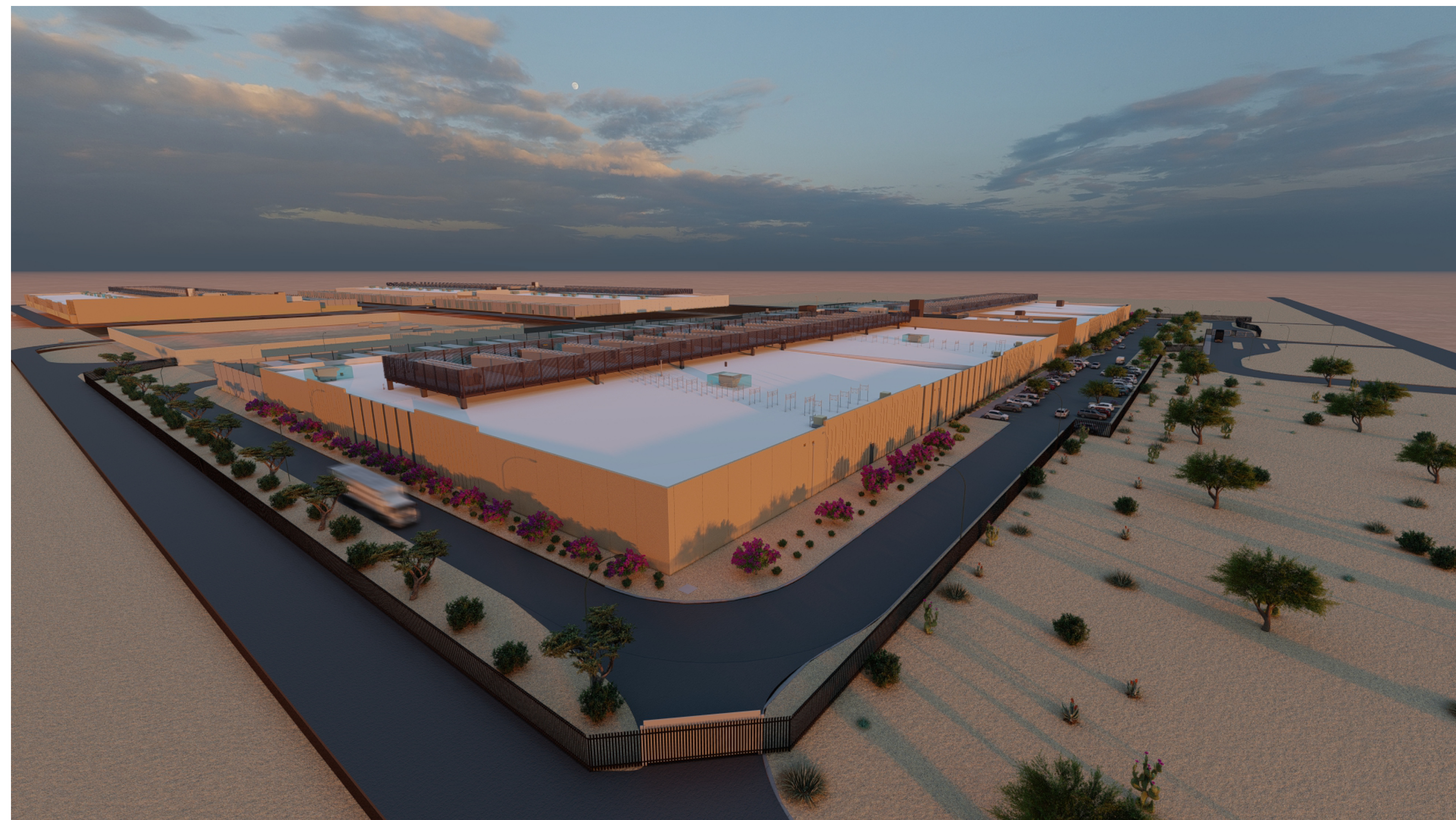
EXTERIOR RENDERING - AERIAL - NORTHWEST CORNER